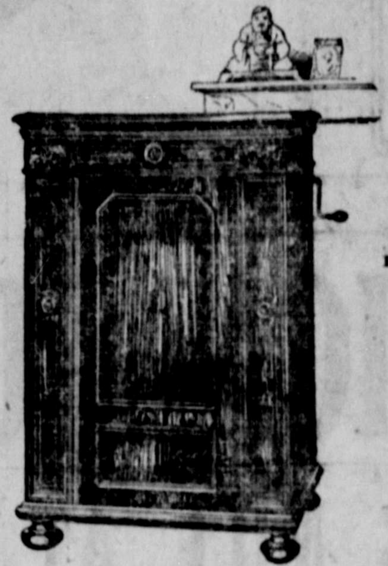
CREDENZA MODEL PRICE $385.00