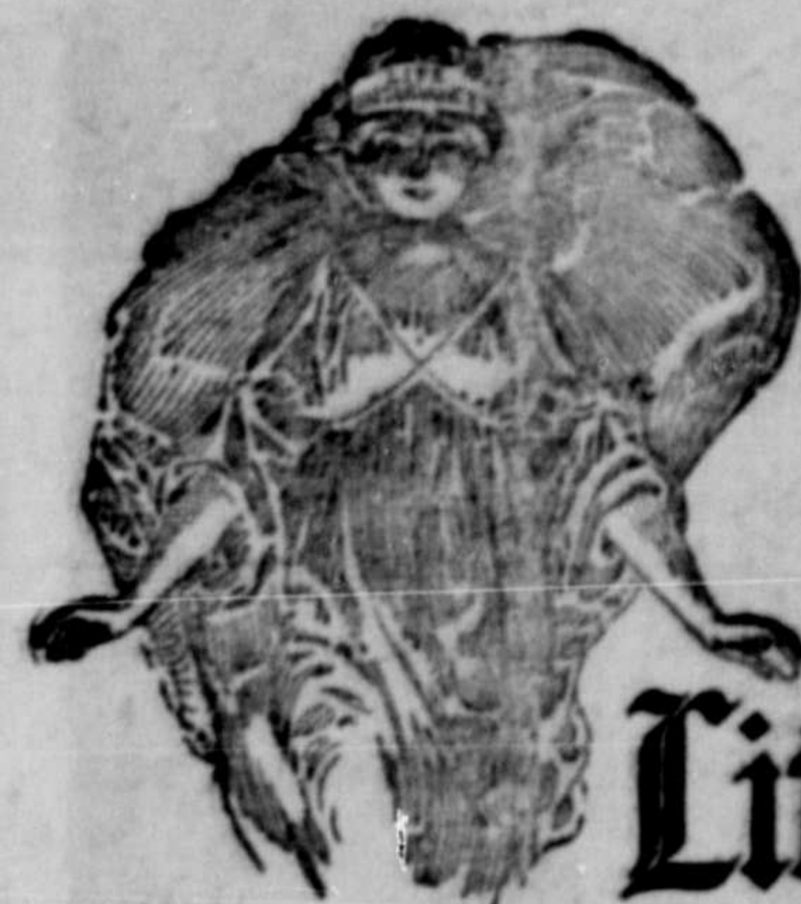
"The Love that Never Dies"

Think! Think of those who depend upon you. Think -- and act. Get in touch with a Life Insurance representative today. Tomorrow may be too late.