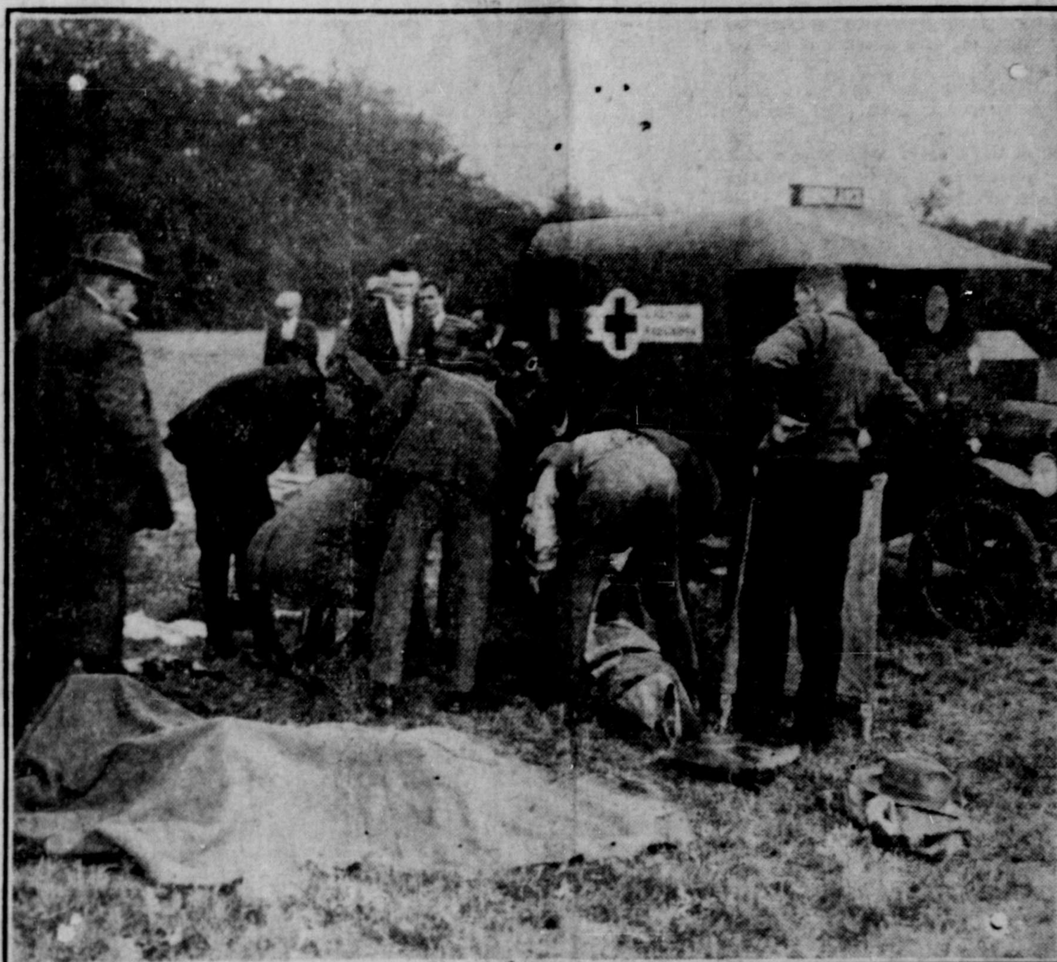
SEVEN PERSONS were burned to death when a French airplane crashed in a field near Peashurst, England. The bodies were recovered from the shell of the plane, of the pilot, mechanic and five passengers.

Mushrooms grown in century-old caves along the banks of the Mississippi river at St. Paul make that city one of the greatest mushroom producers in the United States.