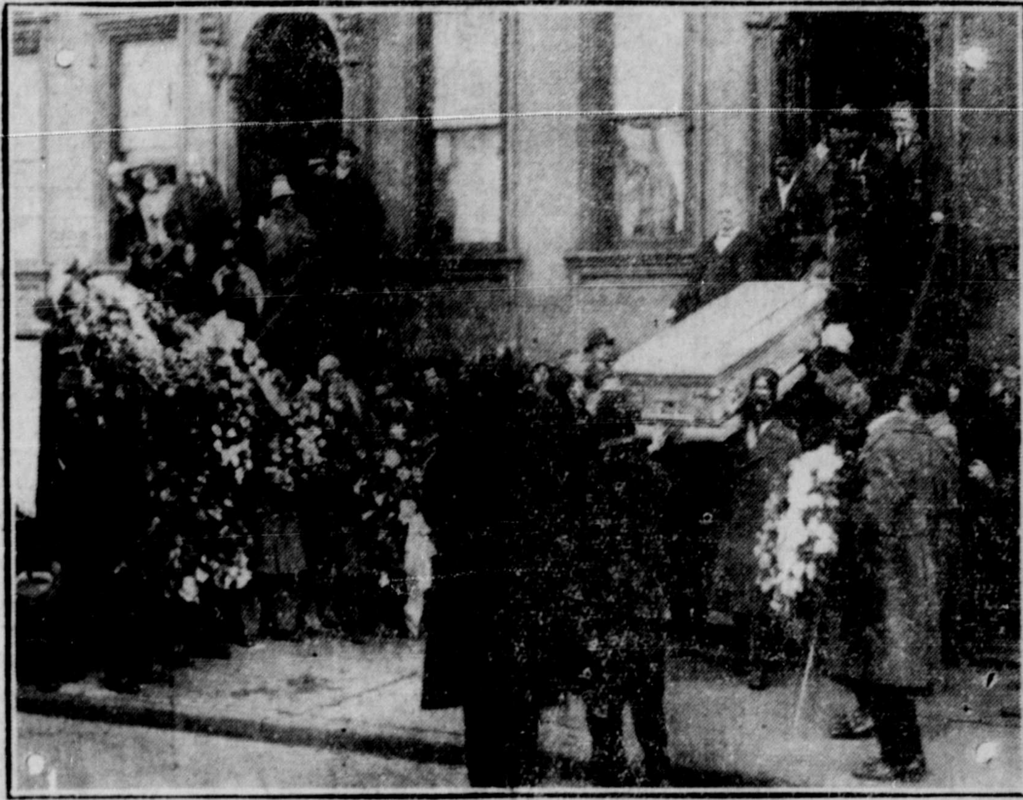
BATTLING SIKI LAID TO REST—Chanting an unintelligible dirge, Senegalese pallbearers lent a weird touch to the funeral, on December 18, of the one-time hero of the pugilistic world and conqueror of Carpentier. Siki was found dead on a New York street, slain, it is believed, in a quarrel with a bootlegger.