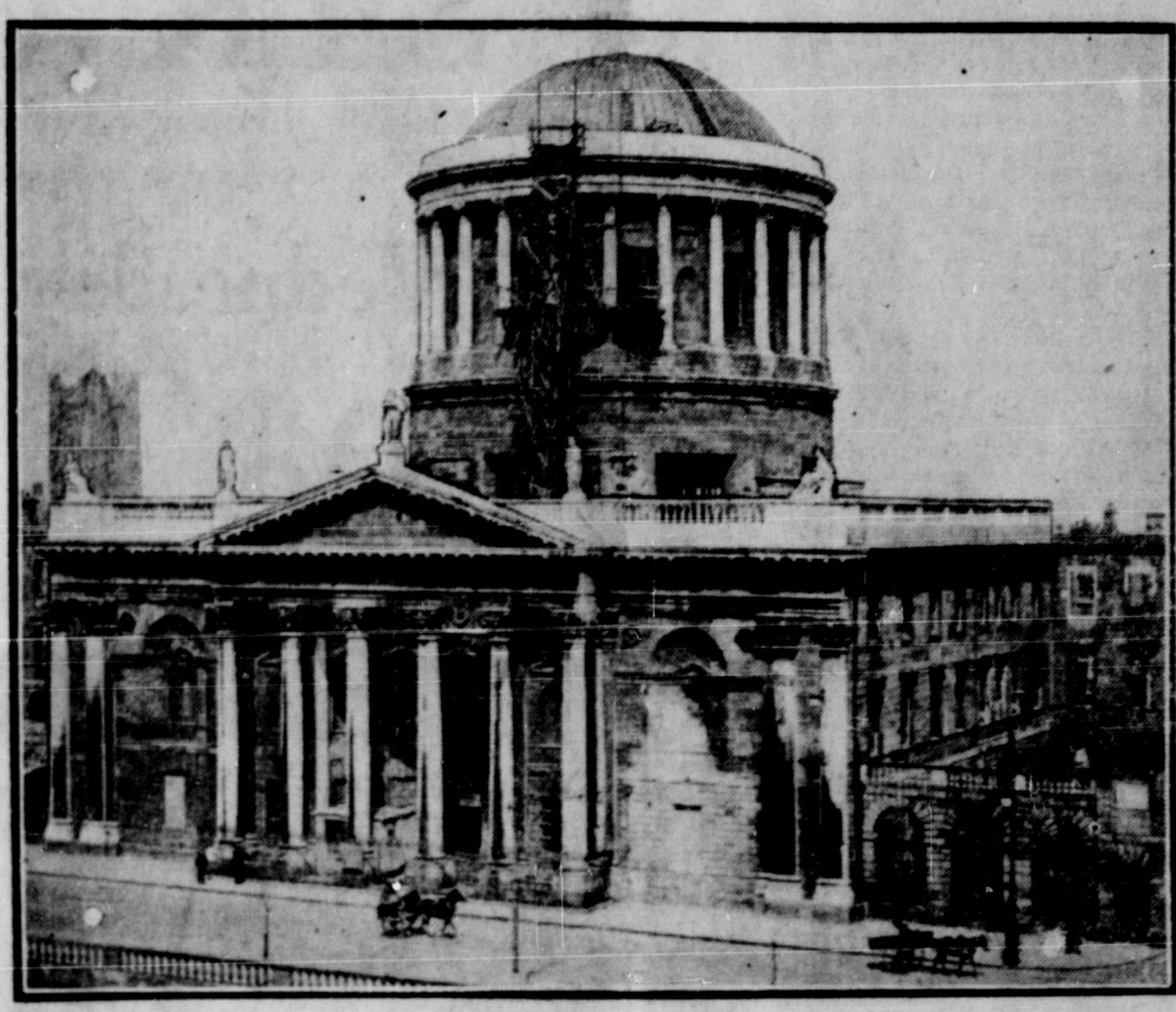
Four Courts, Dublin, which suffered terribly in Easter week of 1916. This shows the new dome replacing that which was then destroyed.

VANCOUVER, July 6.—Repulsed by British Columbia's 13,000 foot "mystery" peak without sight of tidewater on Bute Inlet, 150 miles from Vancouver, members of the Alpine Club expedition which reached an altitude of 10,000 feet on June 21, returned to the city today. They reported that they were almost faced with starvation on the return trip.