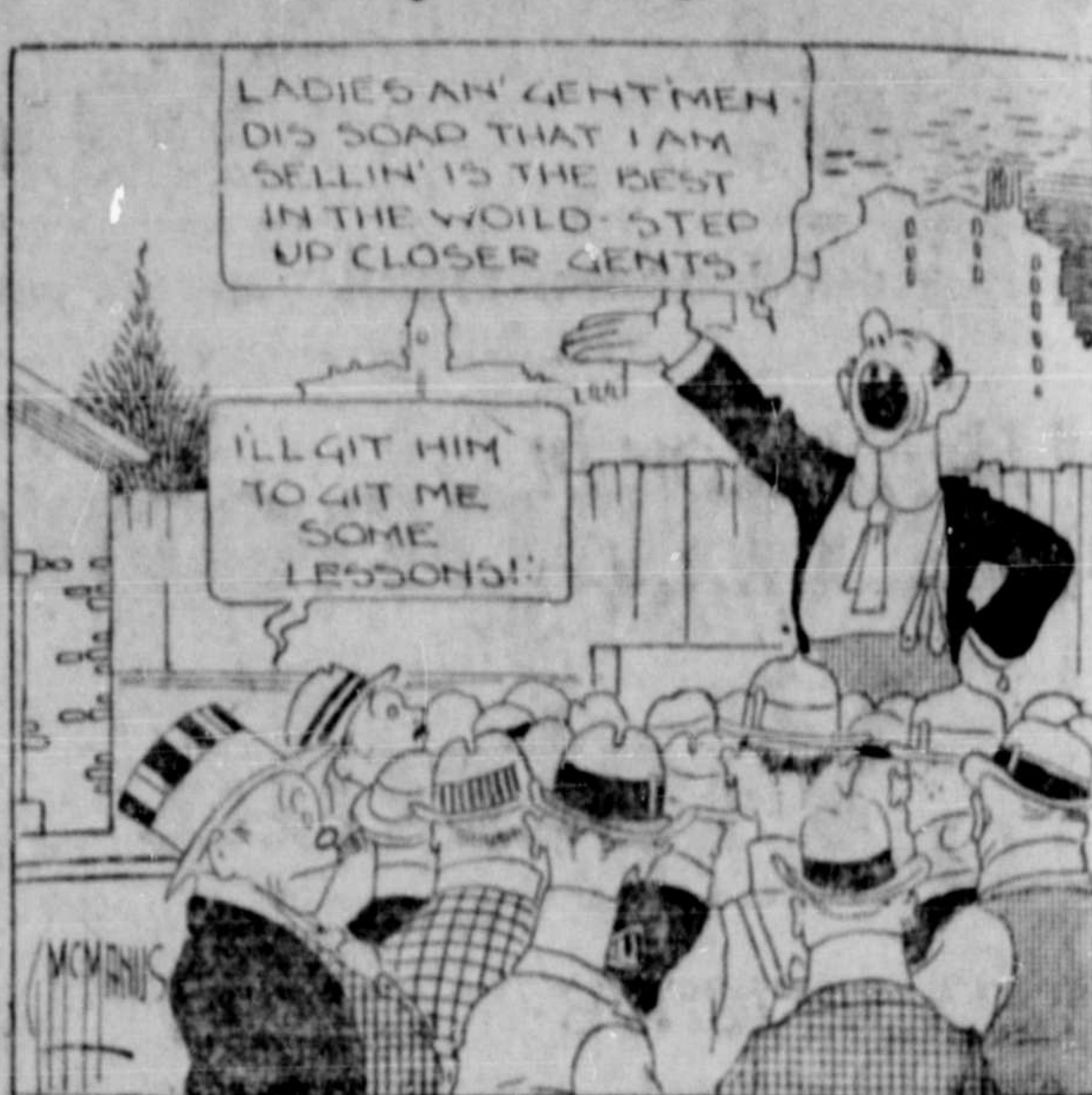
© 1926 by Int'l Feature Service, Inc. Great Britain rights reserved.