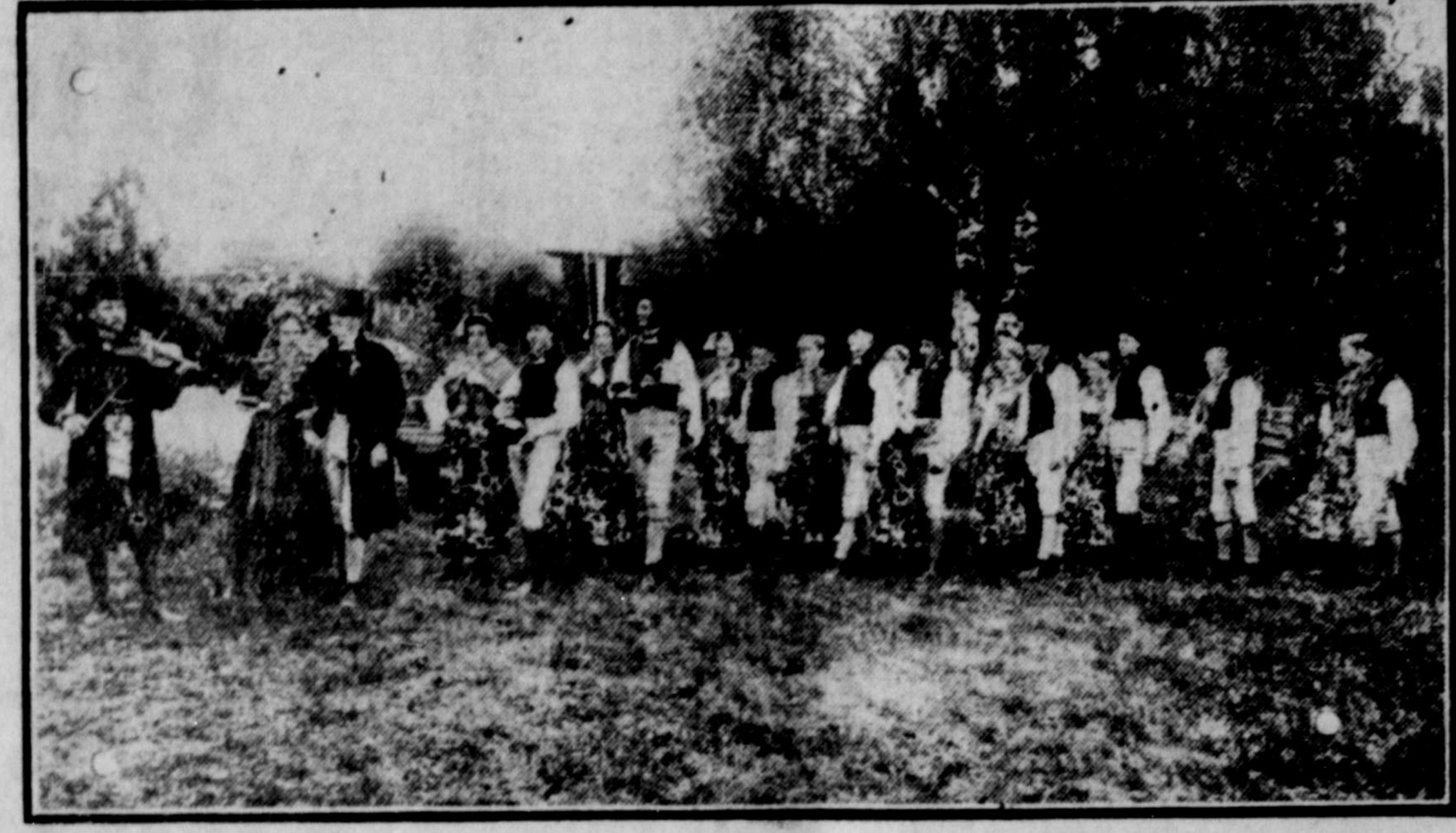
"Here Comes The Bride" in Sweden. A ceremony in that country is a picturesque ceremony, as will be seen from this illustration.