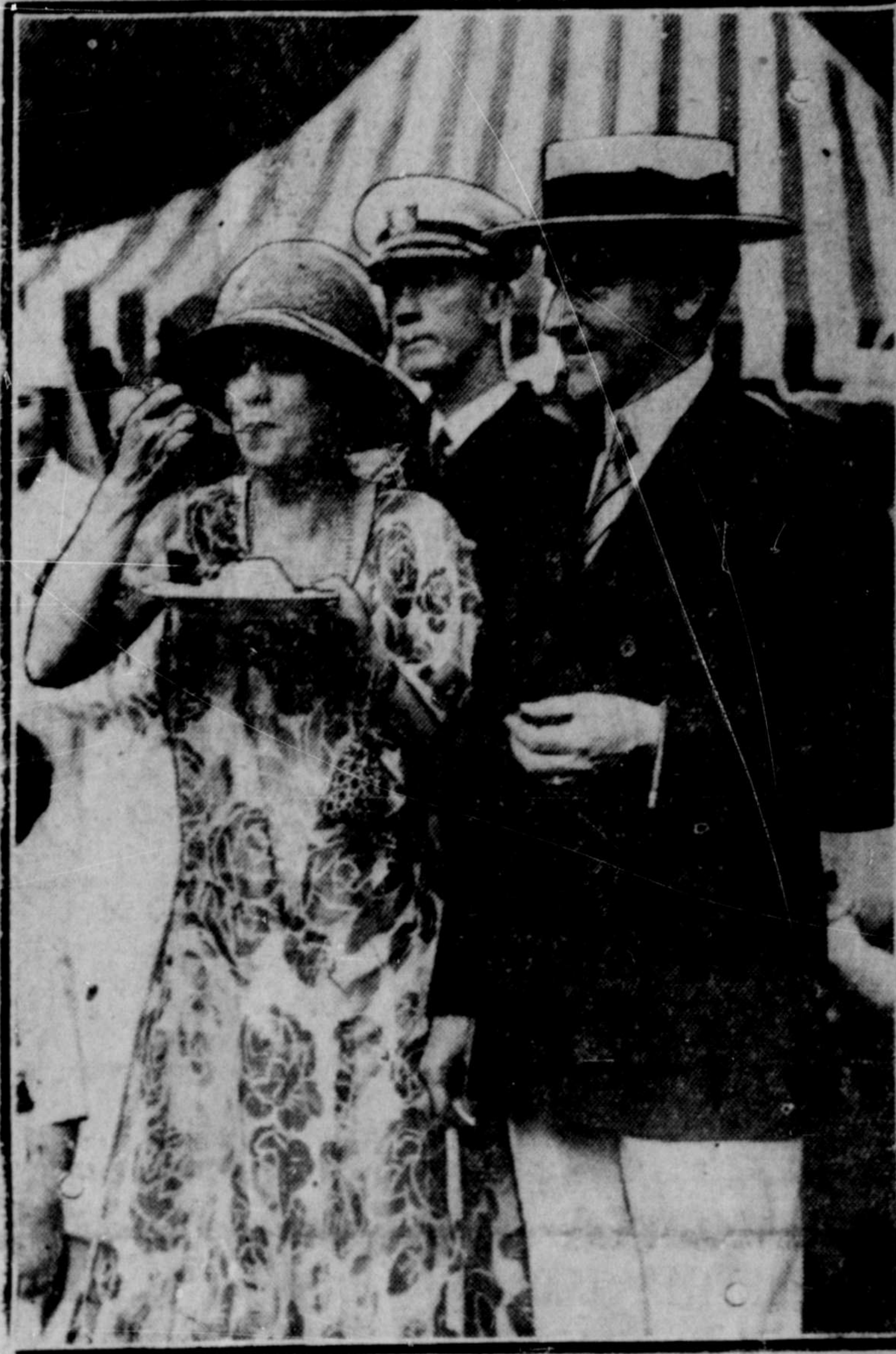
Keeping cool with Coolidge. Mrs. Coolidge having an ice cream with the president at a White House Garden Party for disabled veterans.