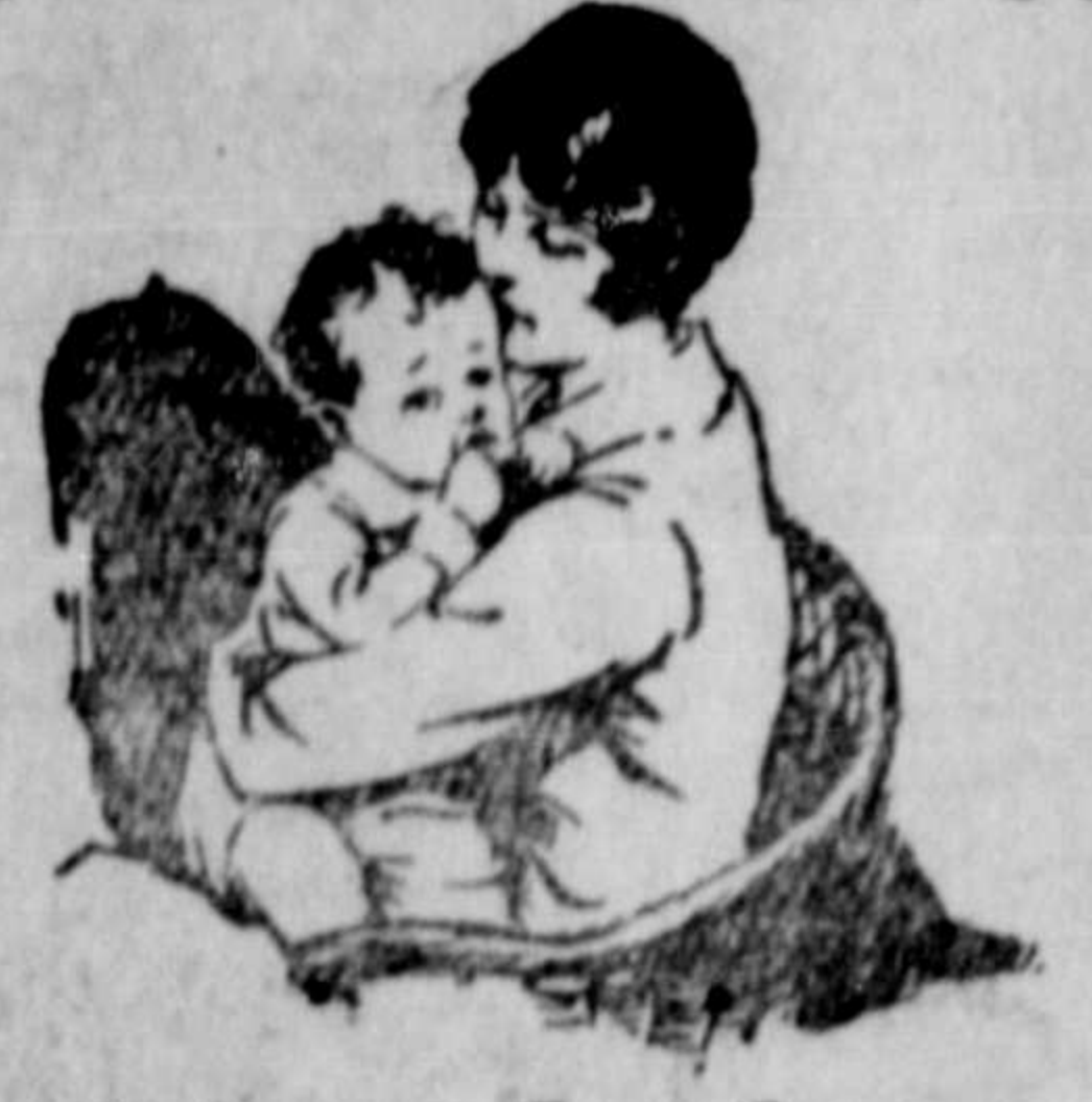
FLY-TOX is a scientific formula... developed at Mellon Institute of Industrial Research by Rex Folsom

"Something baby ate" - Yes. But tainted by Flies