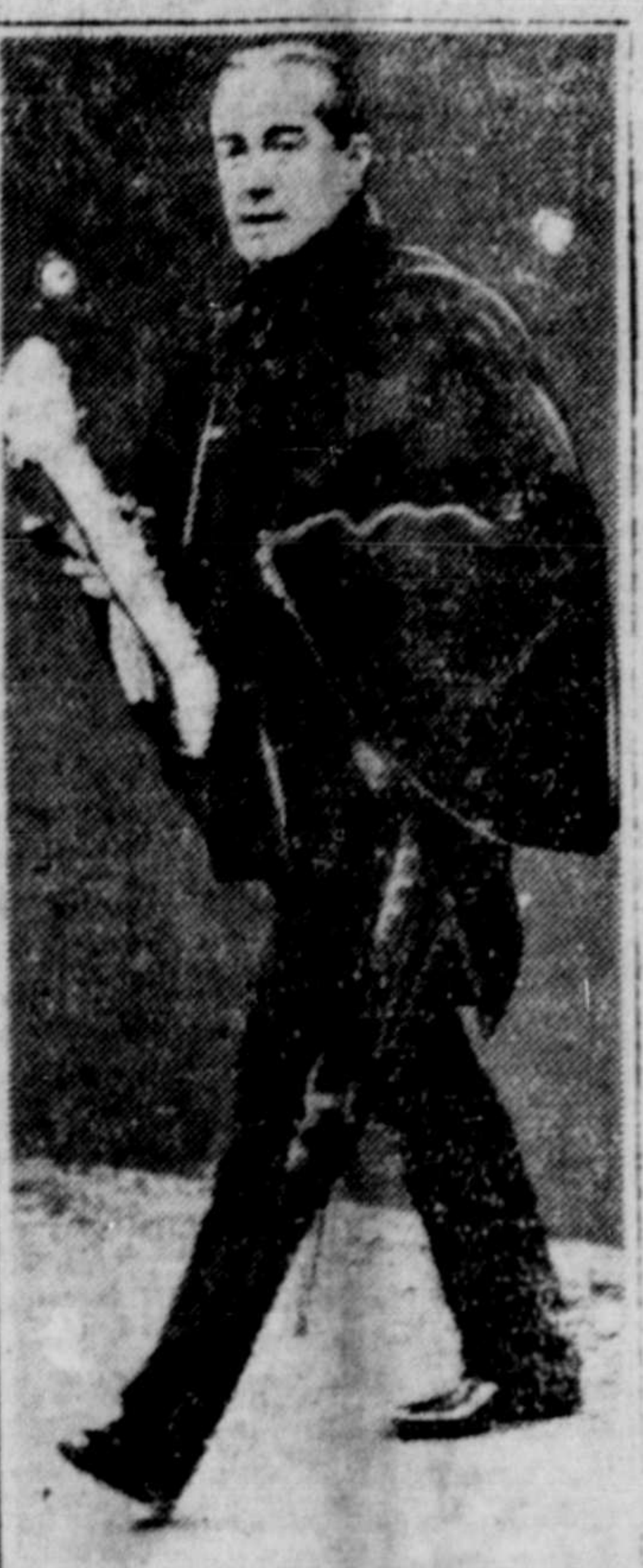
RT. HON. STANLEY BALDWIN, prime minister of Great Britain, arriving at St. James' Palace for the King's levee.