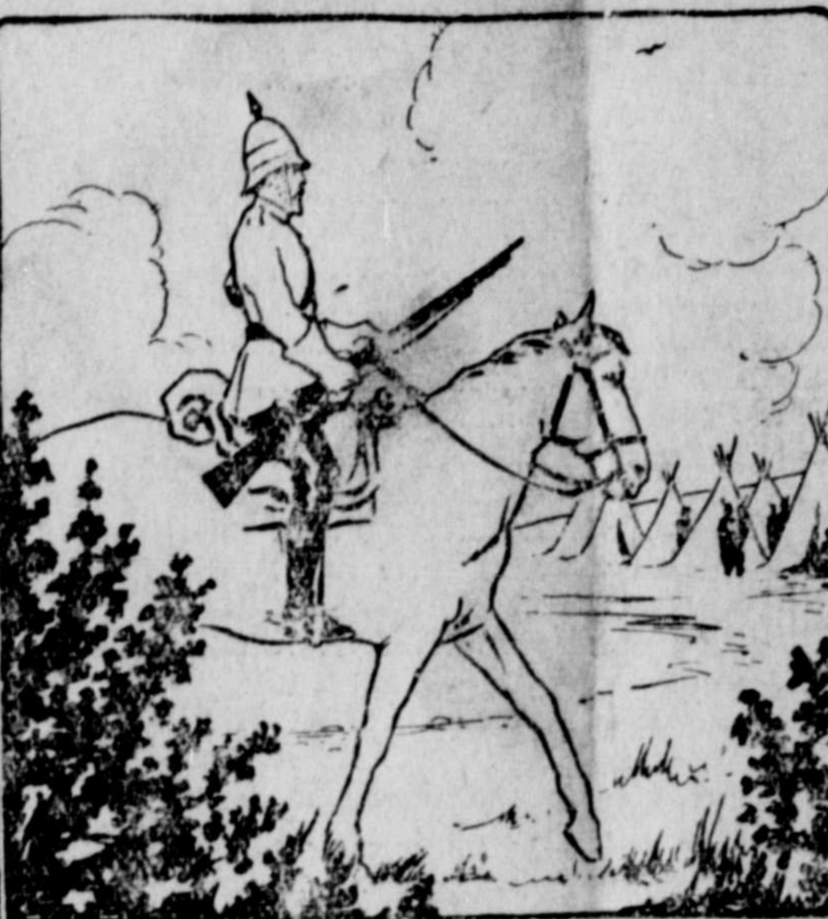
NORTHWEST MOUNTED POLICE - 1873