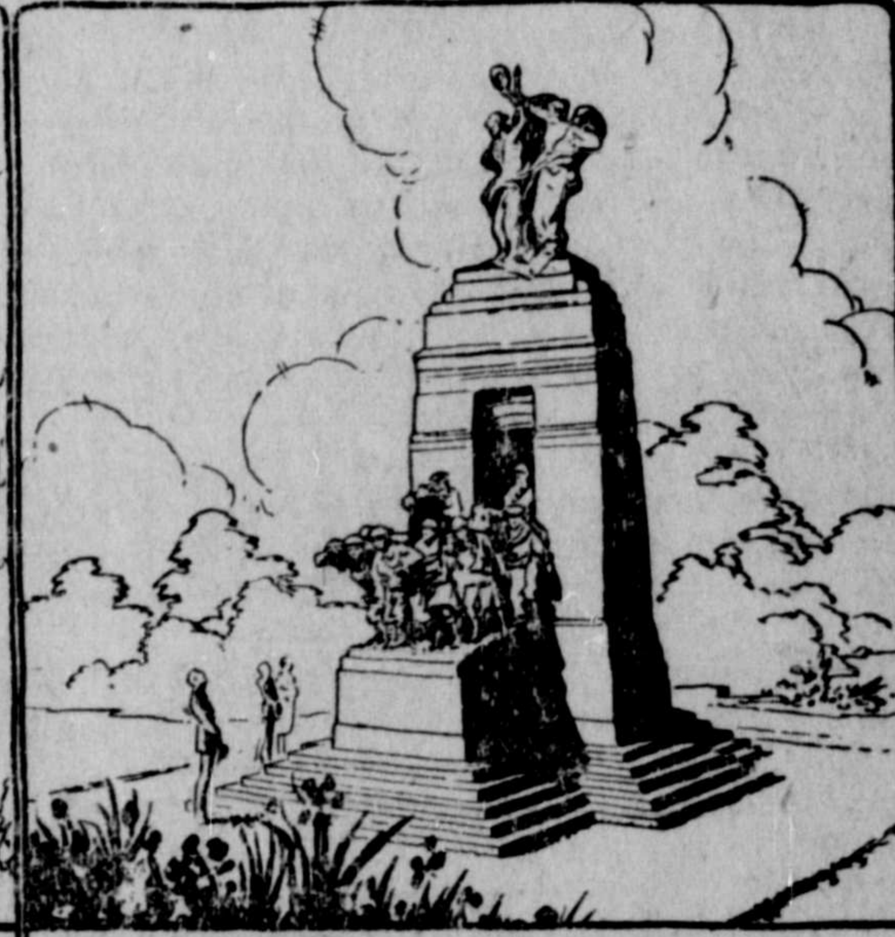
PROPOSED NATIONAL WAR MEMORIAL TO BE ERECTED AT OTTAWA