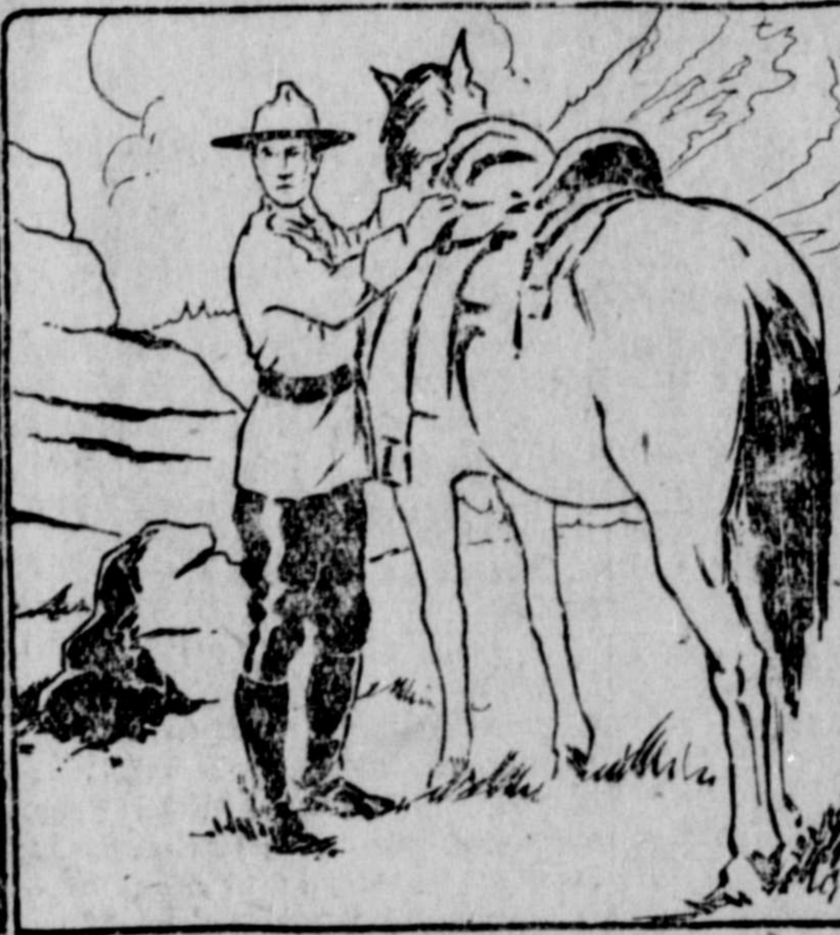
ROYAL CANADIAN MOUNTED POLICE - 1927