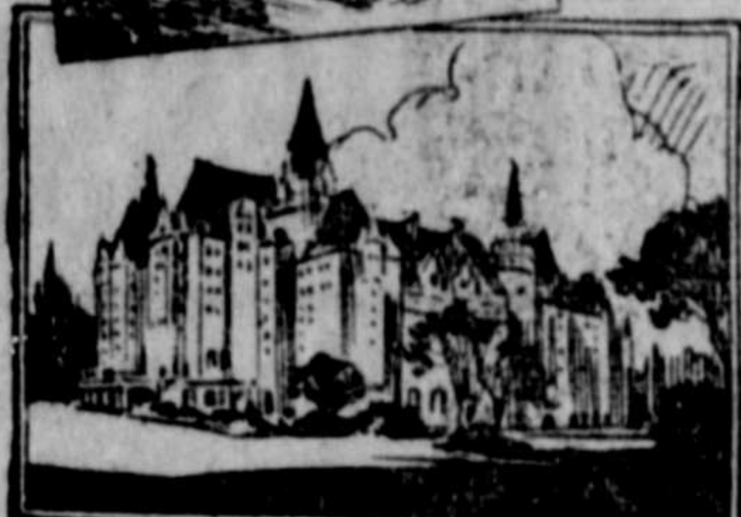
Chateau Laurier, Ottawa.