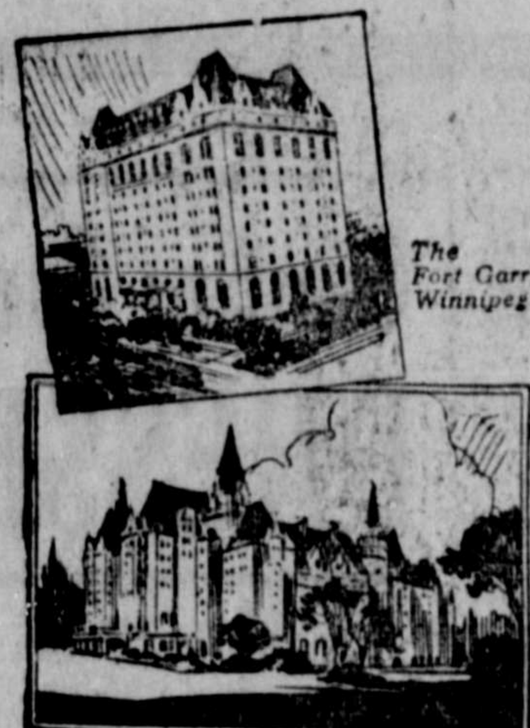
The Fort Garry, Winnipeg.

The Canadian National Industrial Department has taken a leading part in placing the facts as to industrial opportunities in Canada before prospective entrants and in inducing and helping them to locate and prosper here. Canada, with its cheap and plentiful power, desirable sites and stable labour conditions, affords unique opportunities for industrial location and growth. The expanding domestic market is supplemented by tariff preferences which throw the whole of the British Empire open to Canadian-made merchandise.