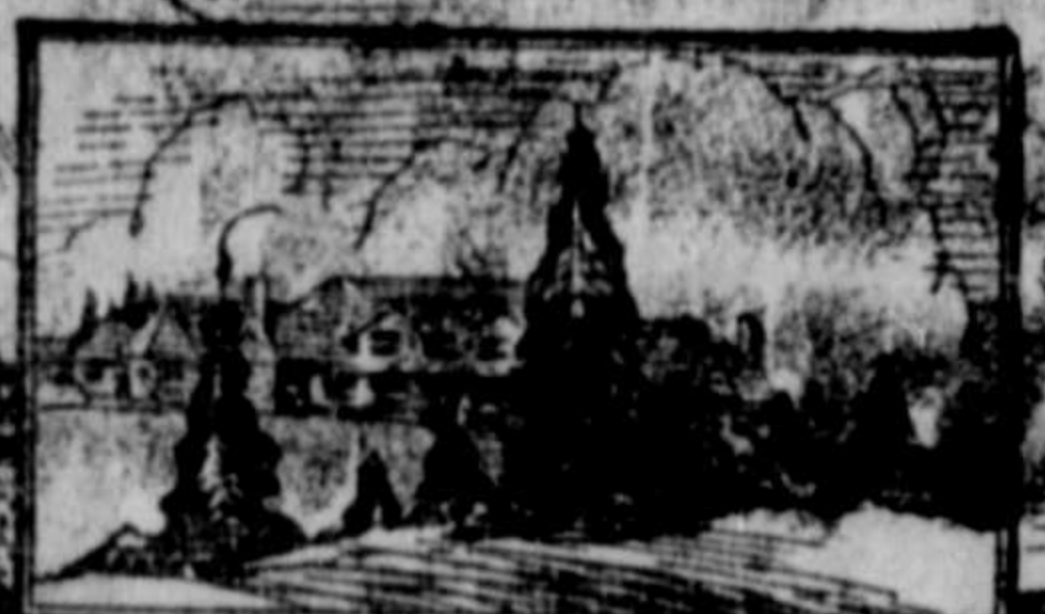
Minaki Lodge, Minaki, Ont.