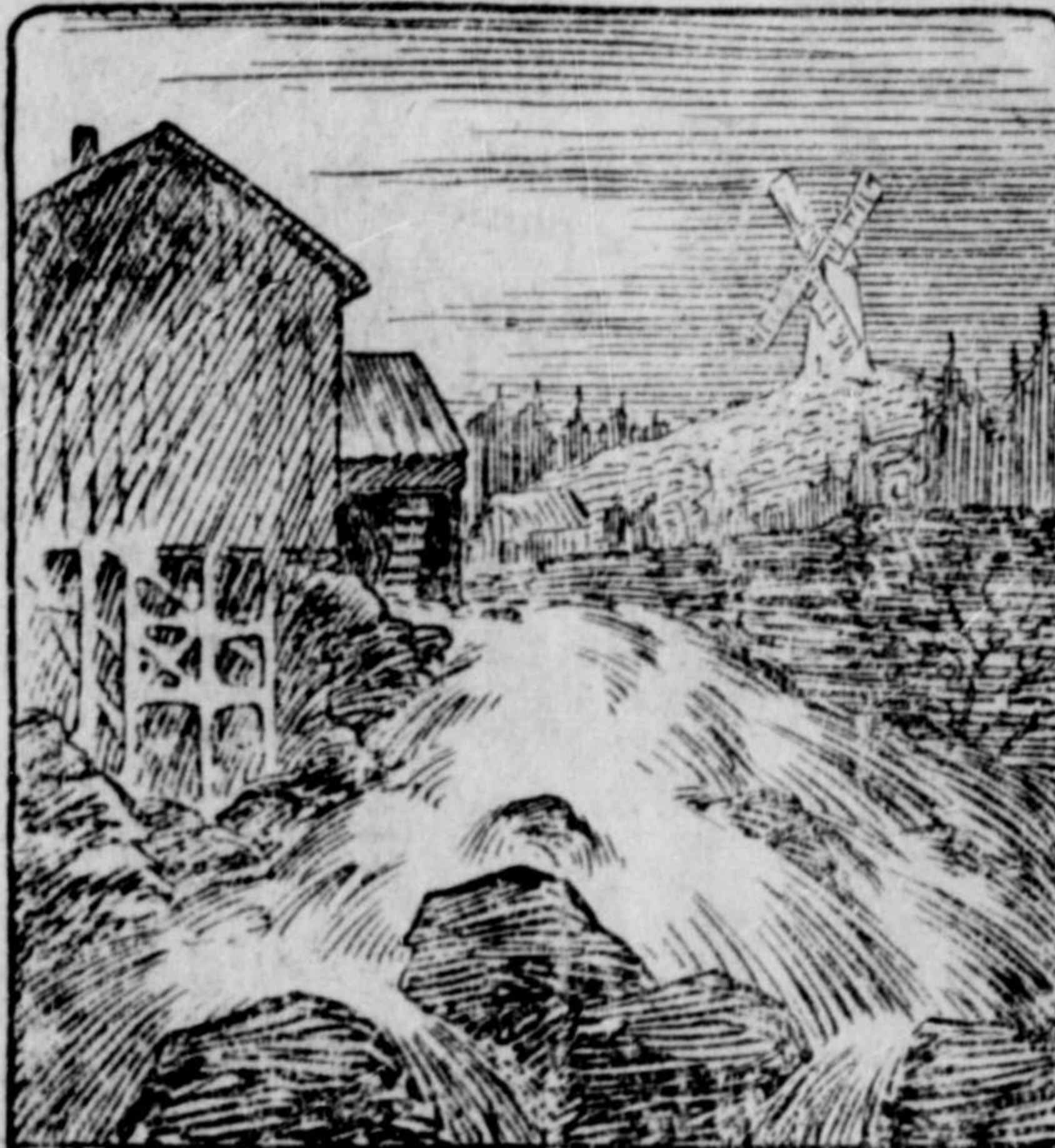
WIND AND WATER POWER