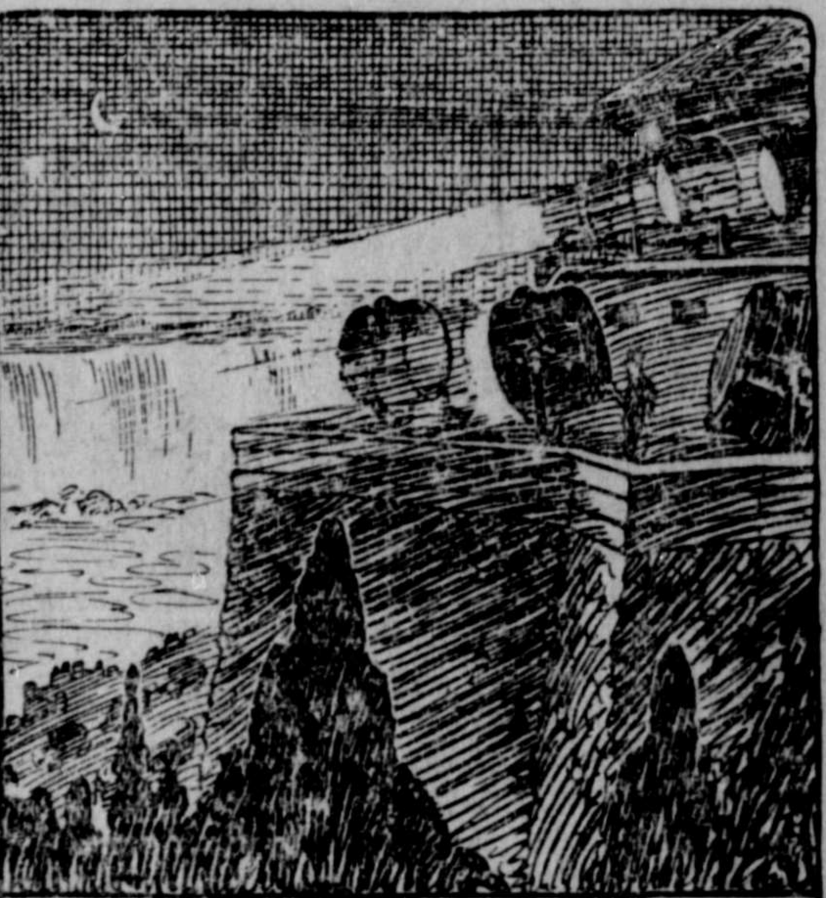
NIAGARA ILLUMINATES ITSELF