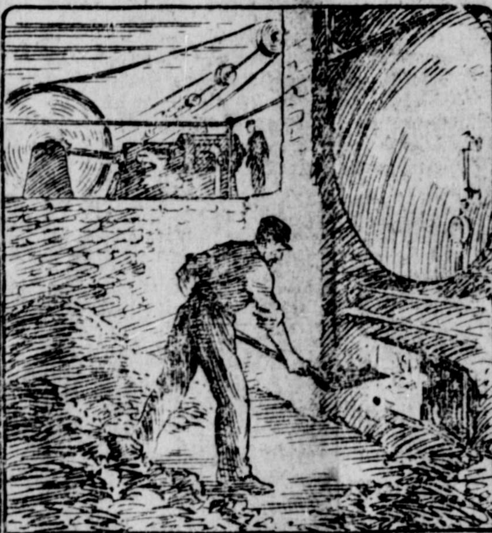
THE AGE OF STEAM