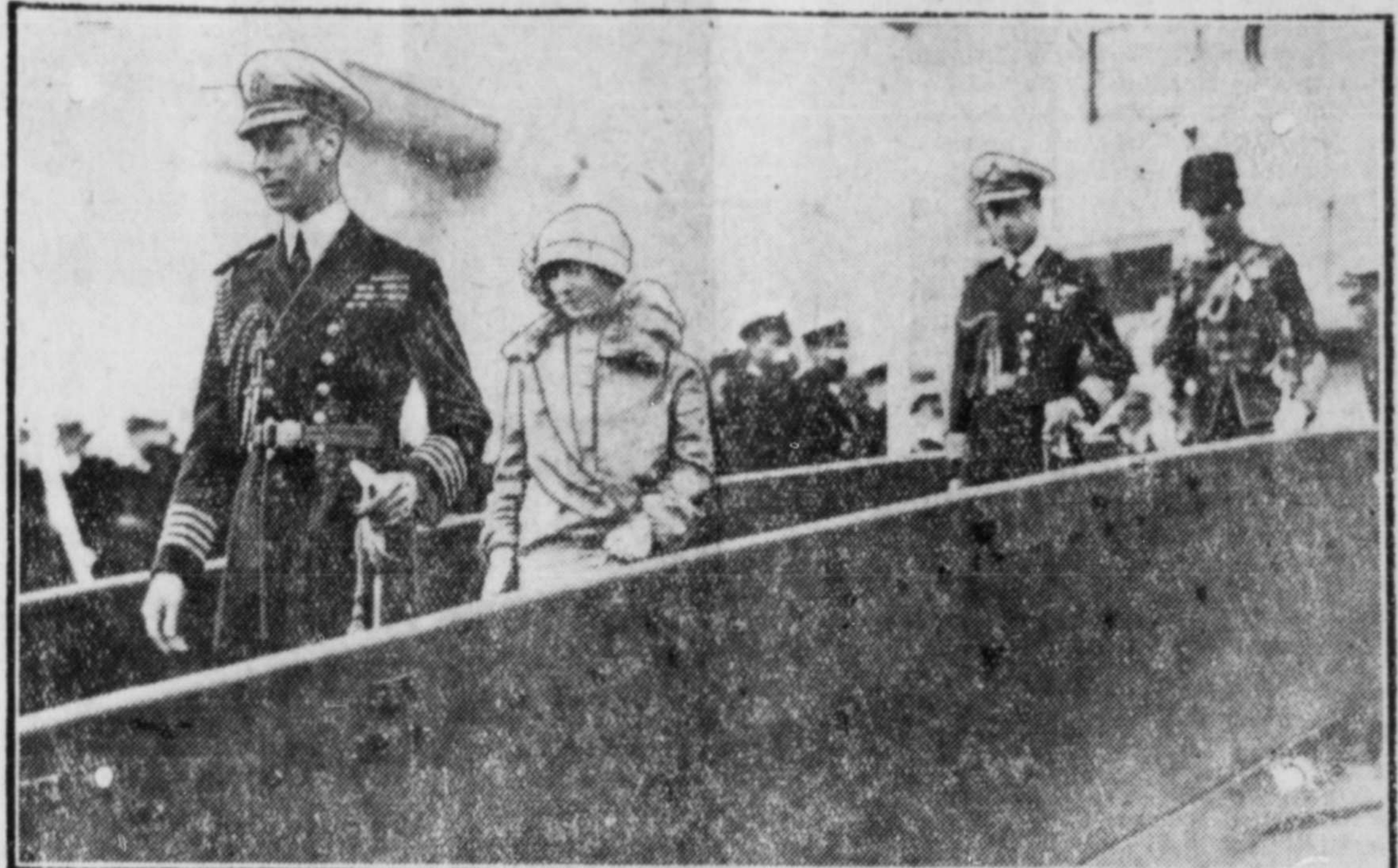
HOME FROM EMPIRE TOUR: The Duke and Duchess of York coming down the gangway at Portsmouth.

Special General Meeting on Wednesday, July 27, at 8 p.m. All members requested to attend. 174