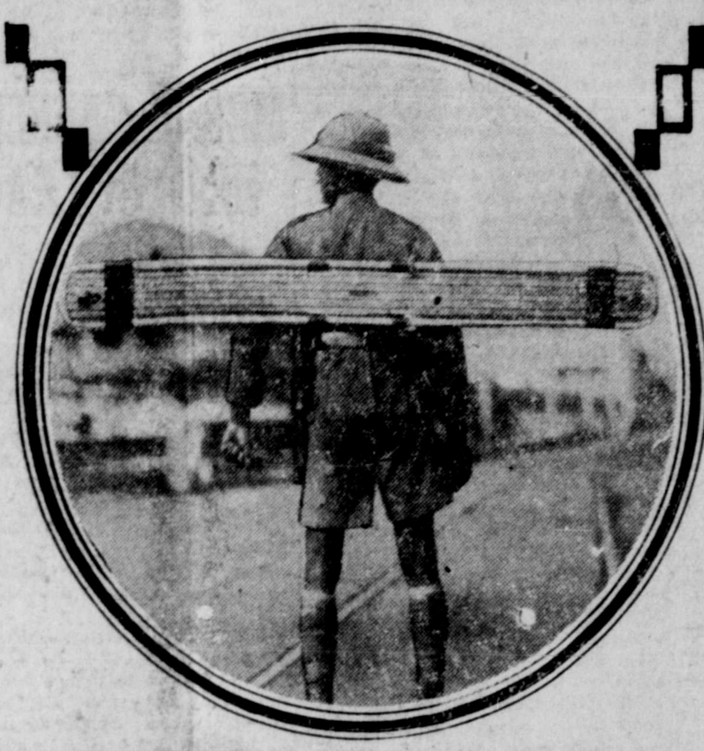
A TRAFFIC OFFICER in Singapore, Straits Settlement, with new traffic directing attachment. The automatic arms are of rattan, with little red discs at the end which refract the light of approaching motor cars