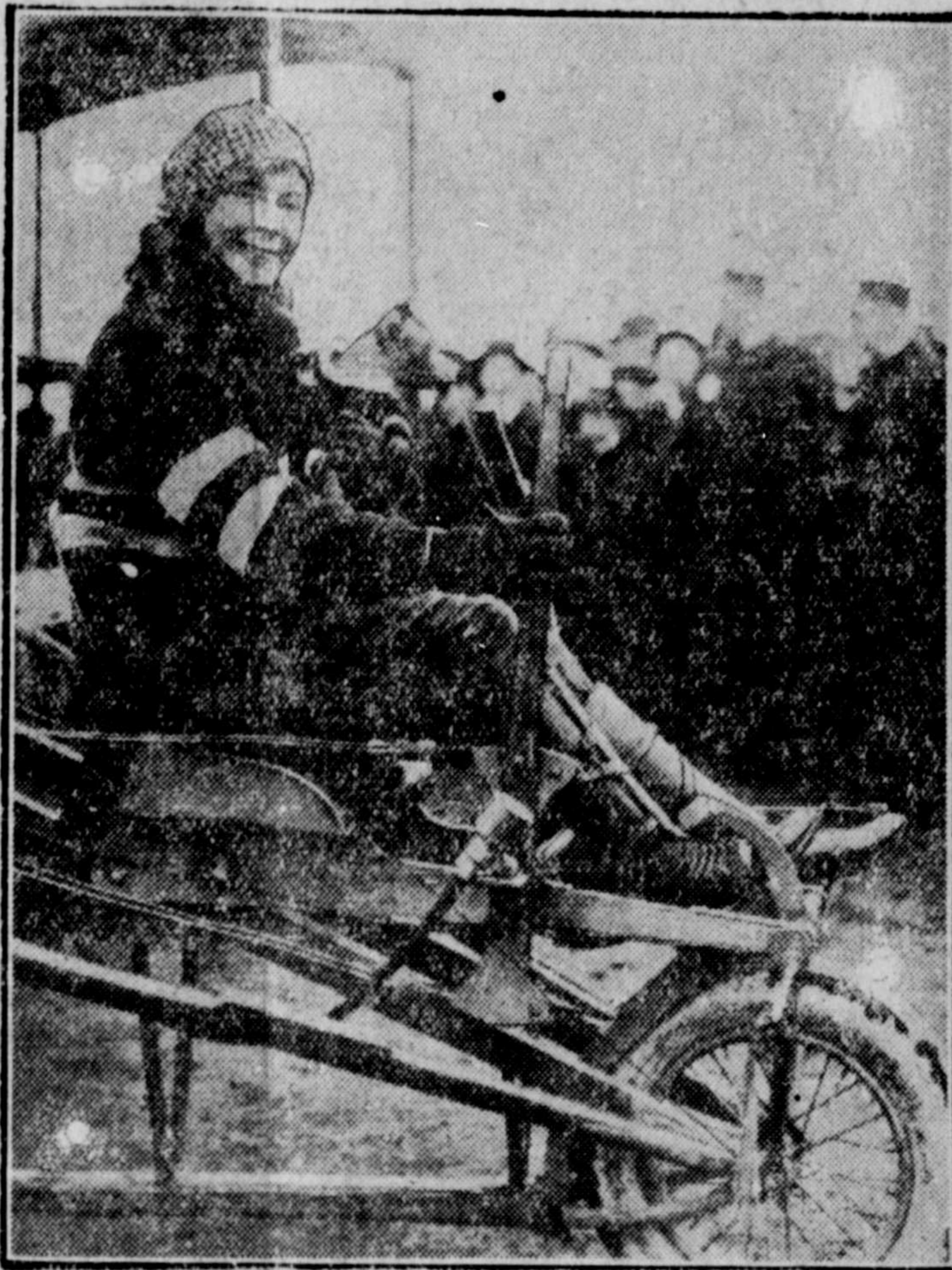
RUTH LAW, pioneer aviatrix, had planned to compete for the $25,000 Orteig prize for a non-stop flight from New York to Paris