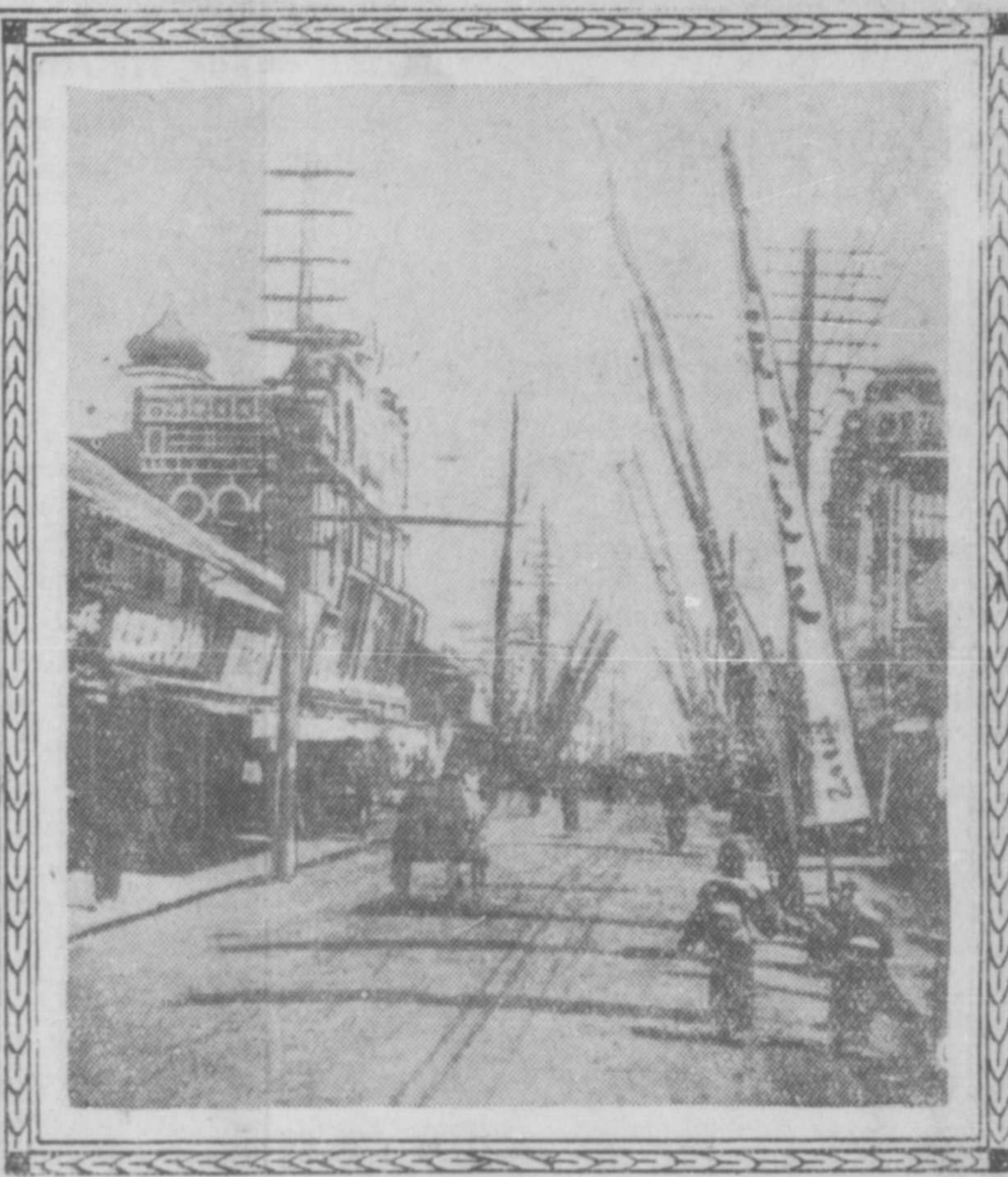
IN THE THEATRICAL SECTION OF YOKOHAMA: The names of the various shows and the stars performing in them are printed on long linen cloths which wave gaily in front of theatres, and are picturesque.

WEATHER REPORT. Prince Rupert.—Cloudy, calm; temperature, 50.