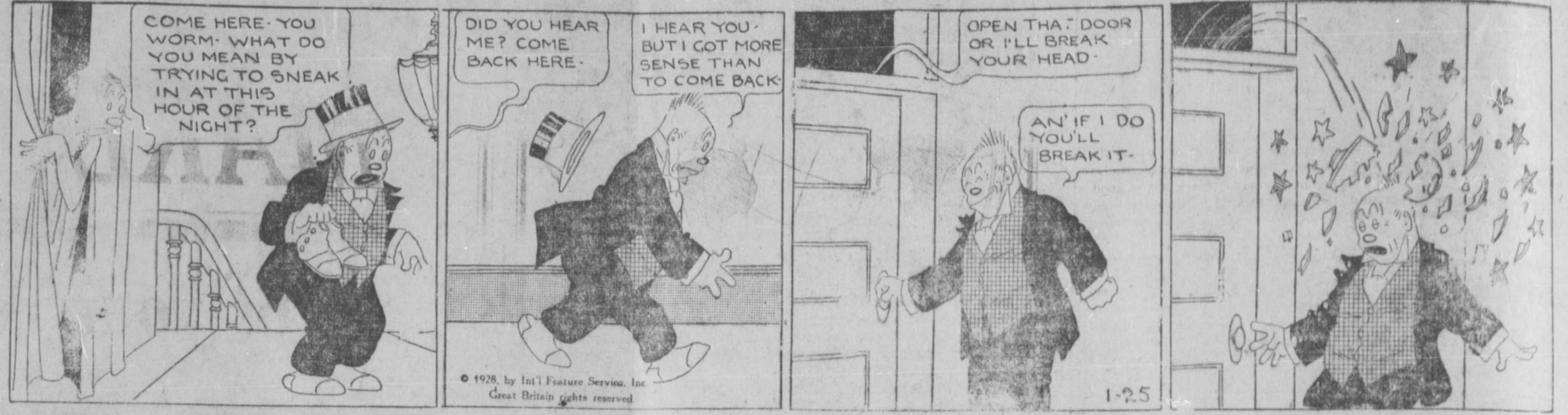
© 1928, by In'l Feature Service, Inc. Great Britain rights reserved.