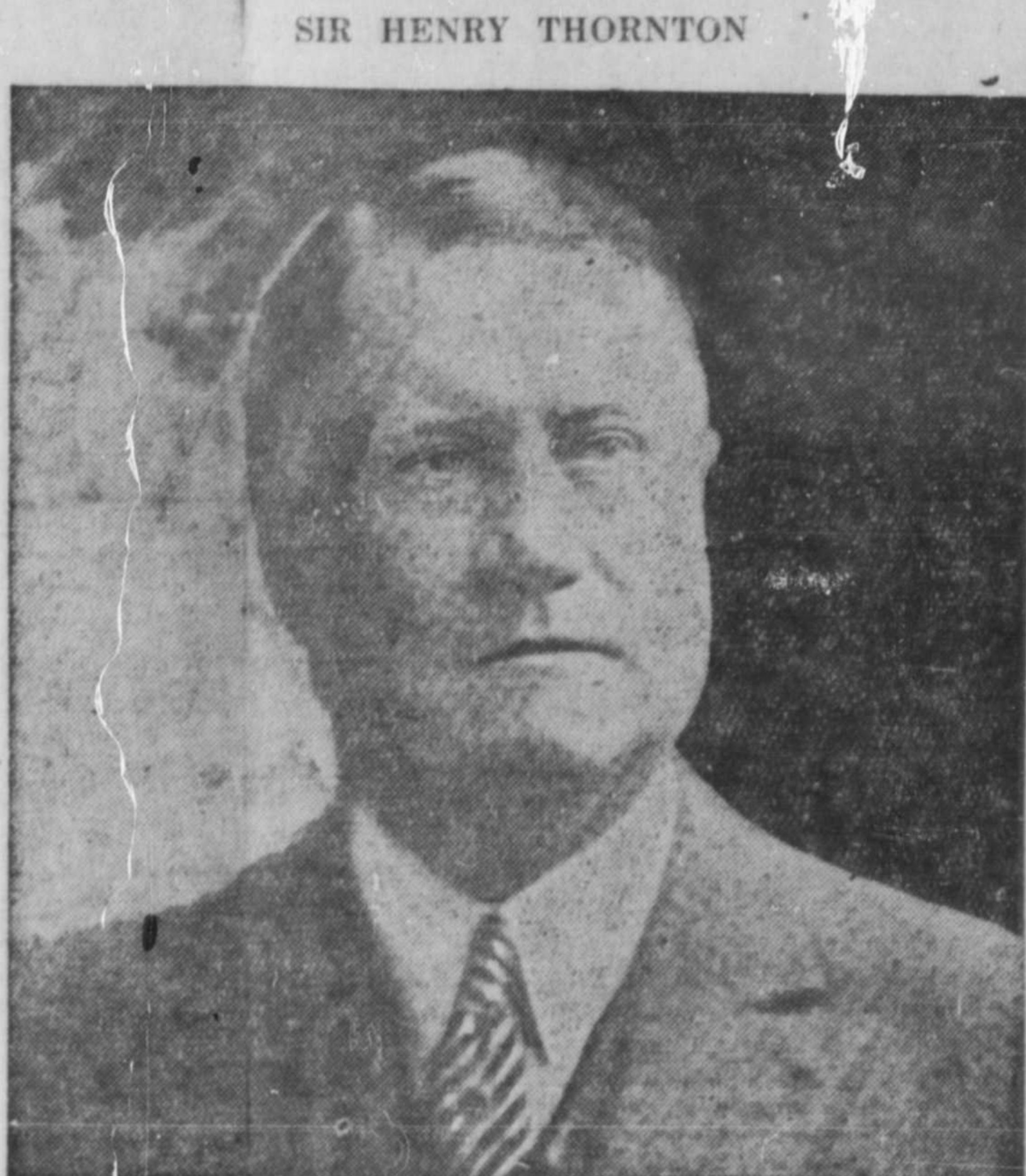
SIR HENRY THORNTON President of Canadian National Railways, who is visiting the city today, accompanied by a party of officials of the line. They arrived from Vancouver on the steamer Prince George this morning and will proceed East at 5 o'clock this afternoon by special train. Sir Henry was the guest of honor and speaker at a luncheon given at noon by the Prince Rupert Board of Trade.