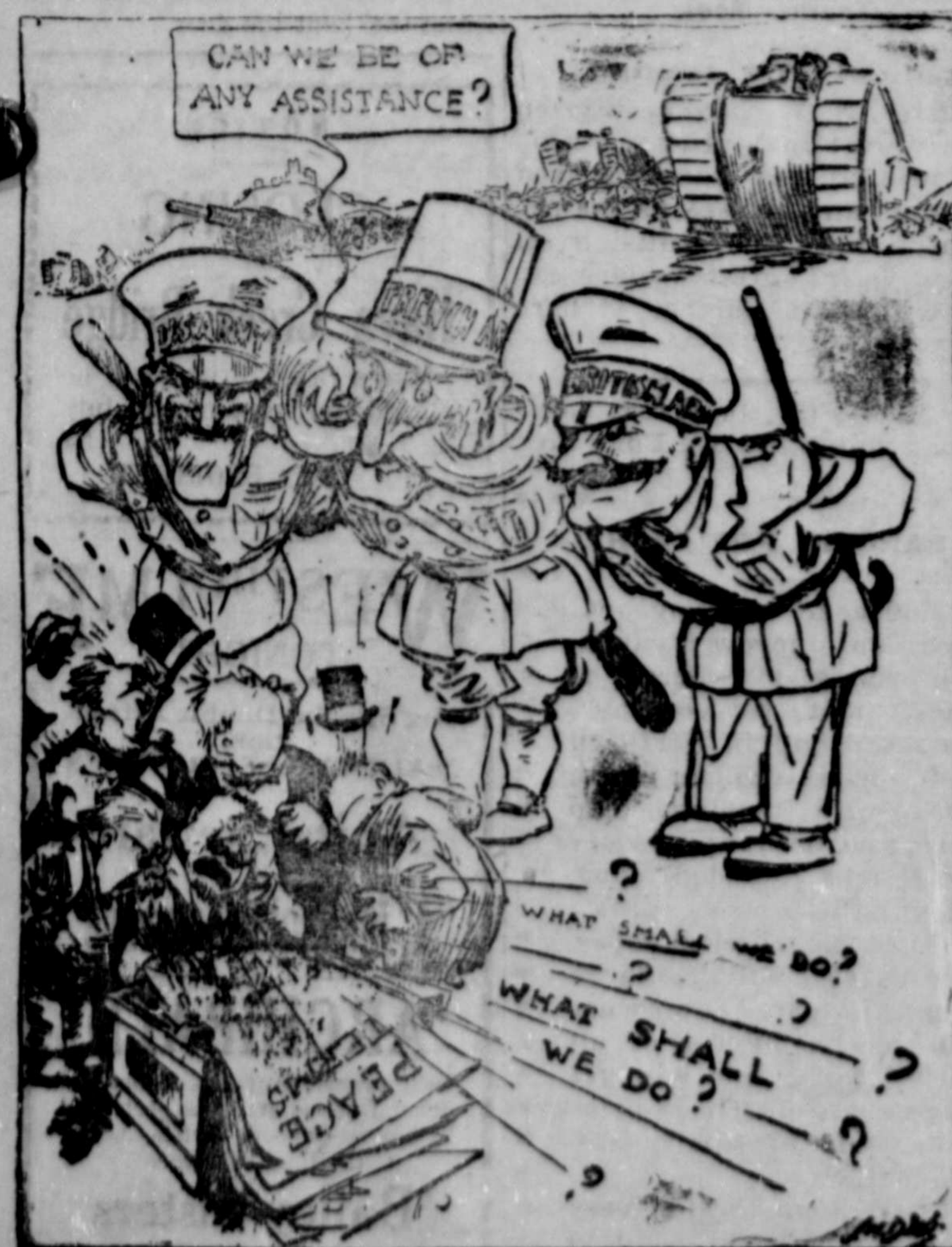
Helping Them Make Up Their Minds

Every dollar spent for goods produced by Canadian labor means better conditions for Canadian workers, and no goods purchased abroad are cheap that take the place of our own labor and our own raw material.