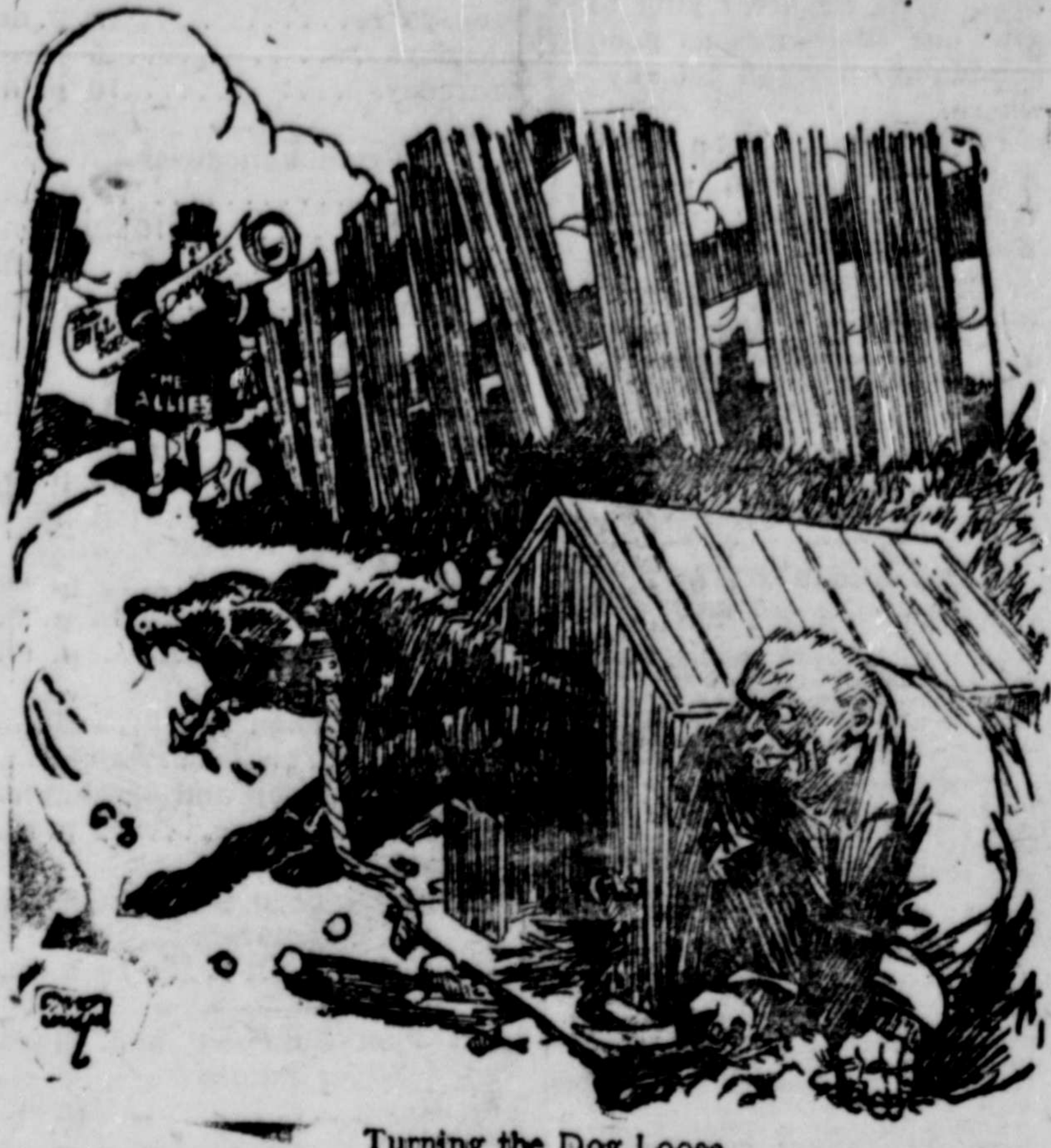
Turning the Dog Loose