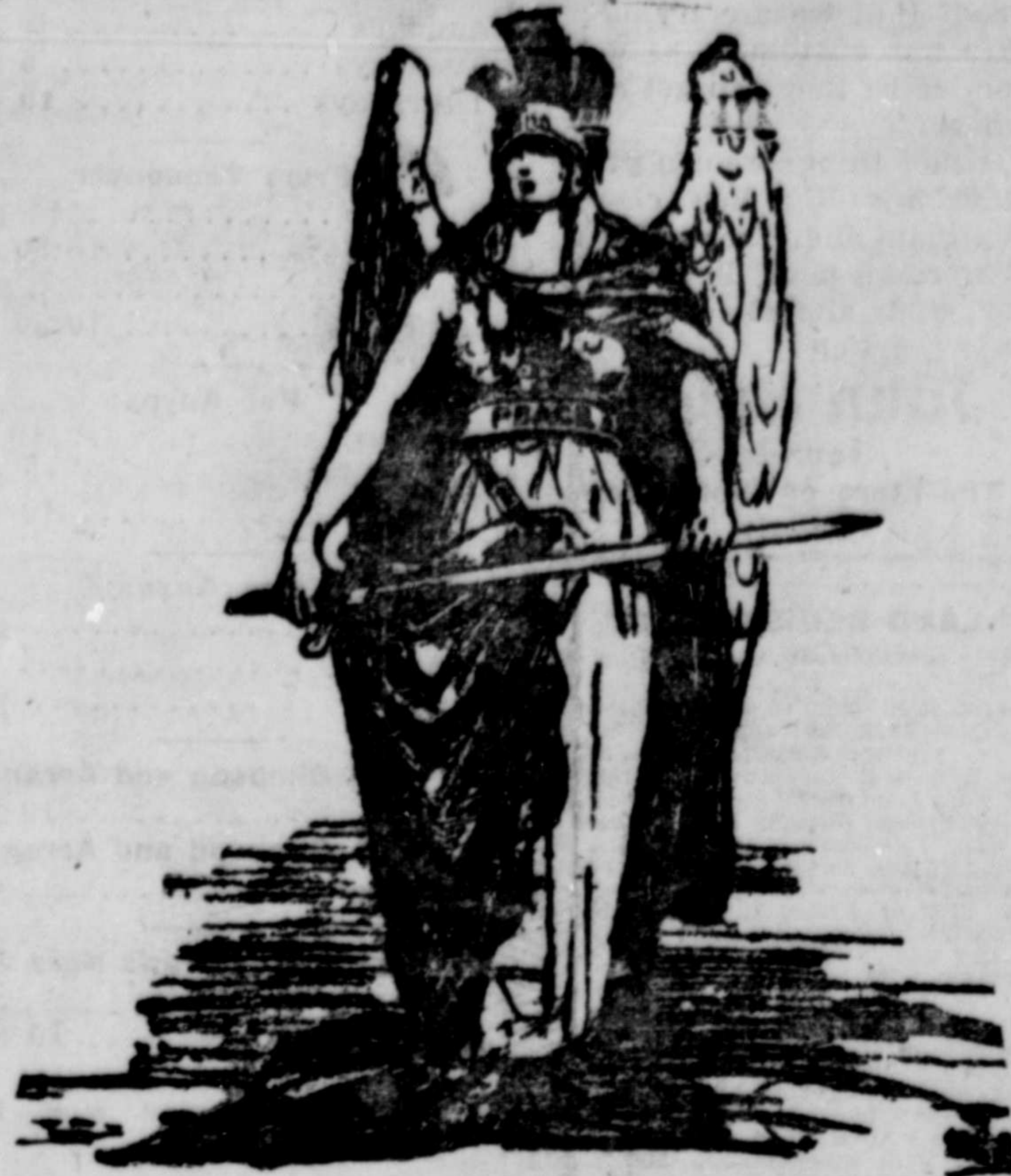
As She Appears to Critics of the Treaty