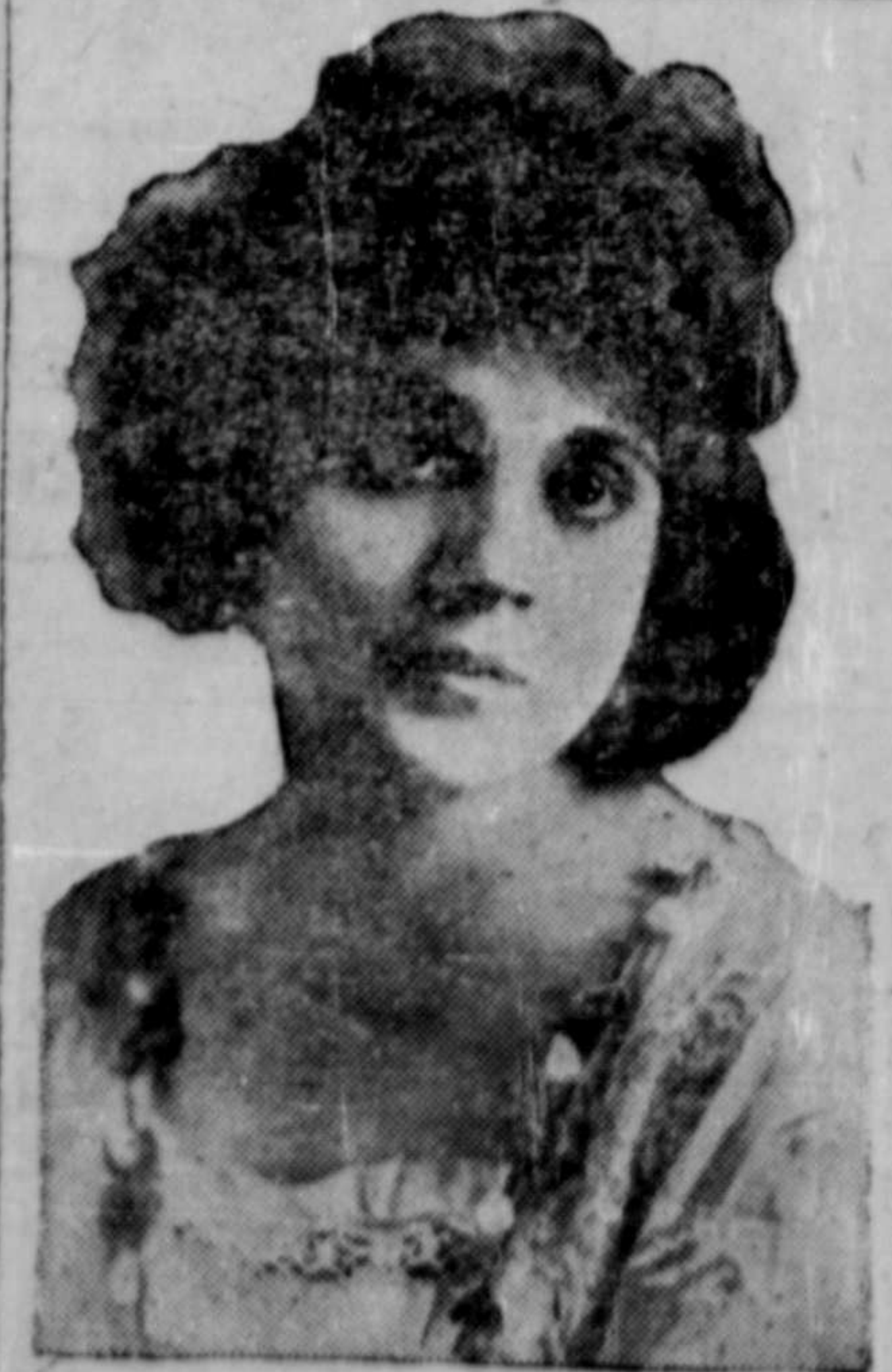
Showing tonight at the Empress Theatre.

These American visitors who spent four days in town last week positively state they are coming back by way of Rupert, so that they can enjoy another meal at the St. Regis. Some say our cook is a wonder. Others say it is the baker. Which?