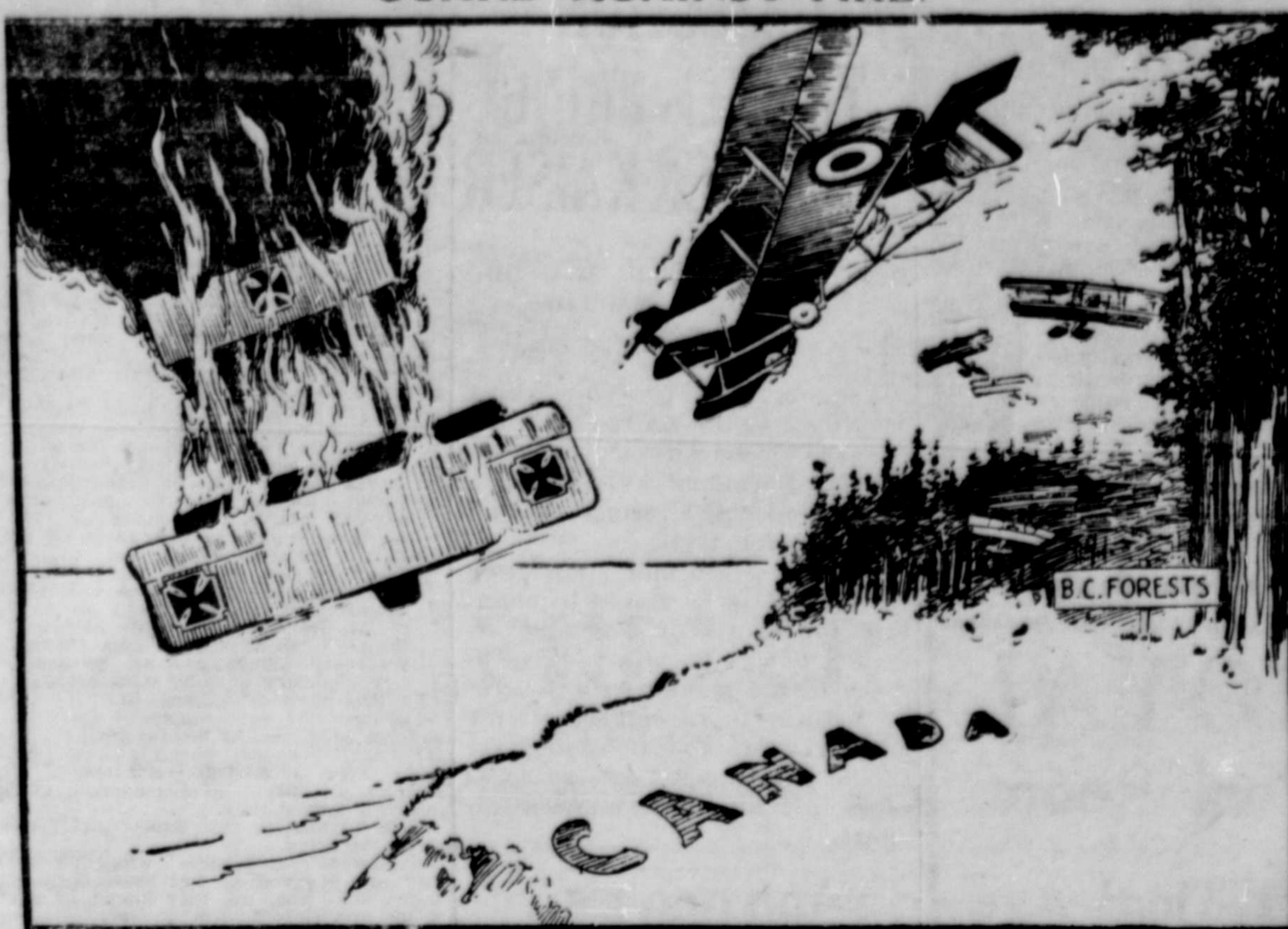
Our Forests Helped to Win the War.