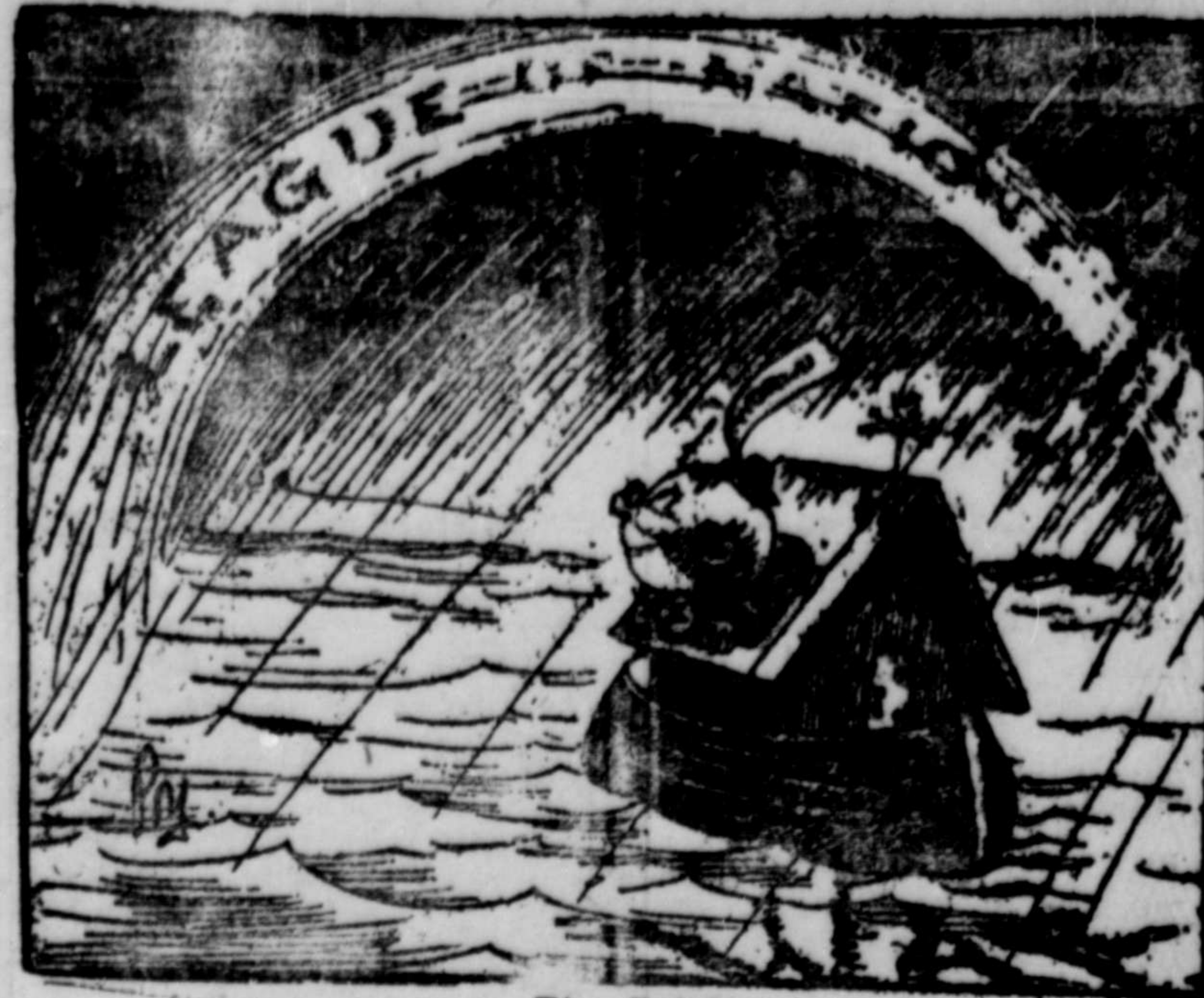
The Rainbow — Evening News, London.

Tickets may be had from the Commissioner, or on board the steamer. 58