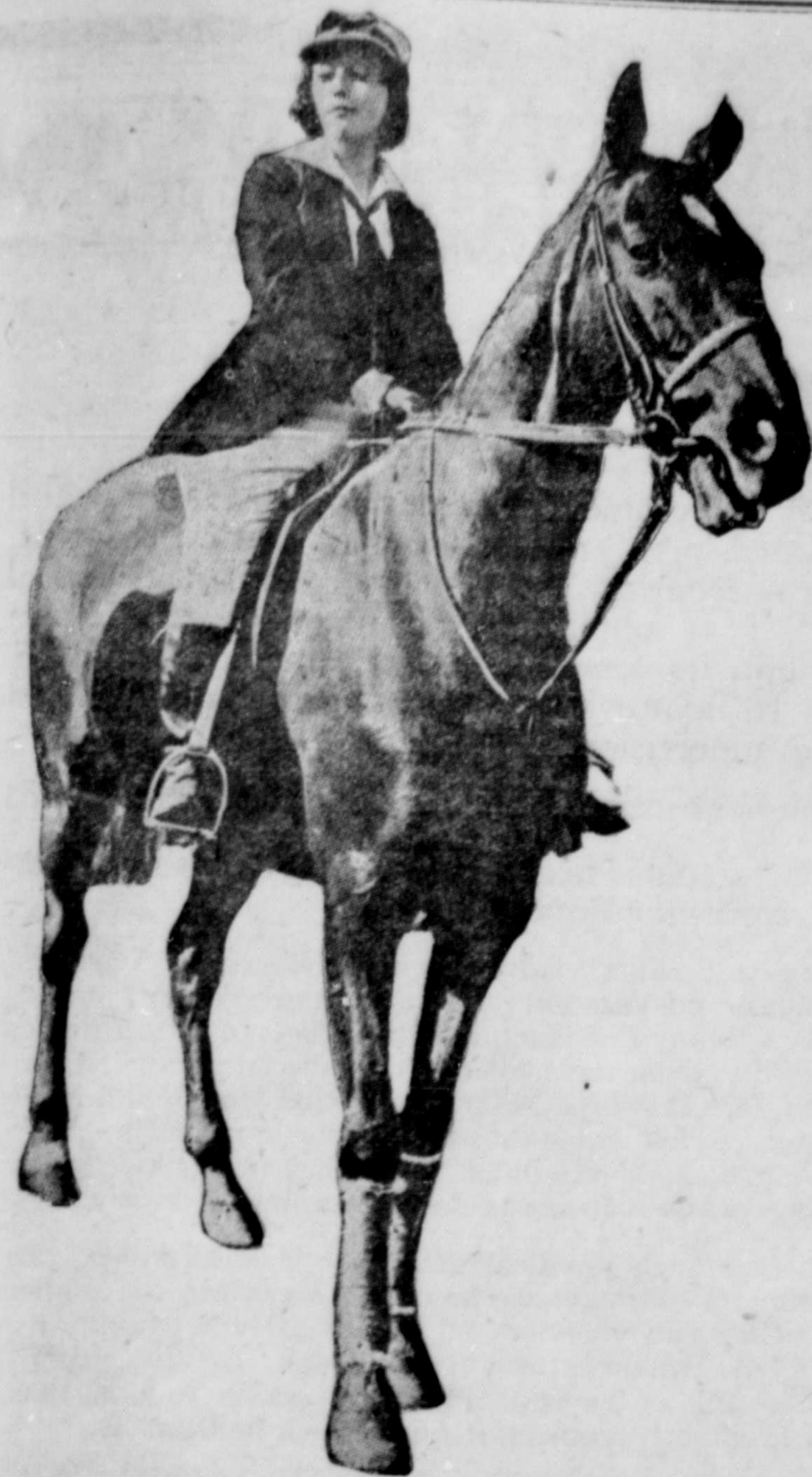
MABEL NORMAND as "Mickey," who will be seen at the Empress Theatre tonight, Friday and Saturday with Saturday matinee.