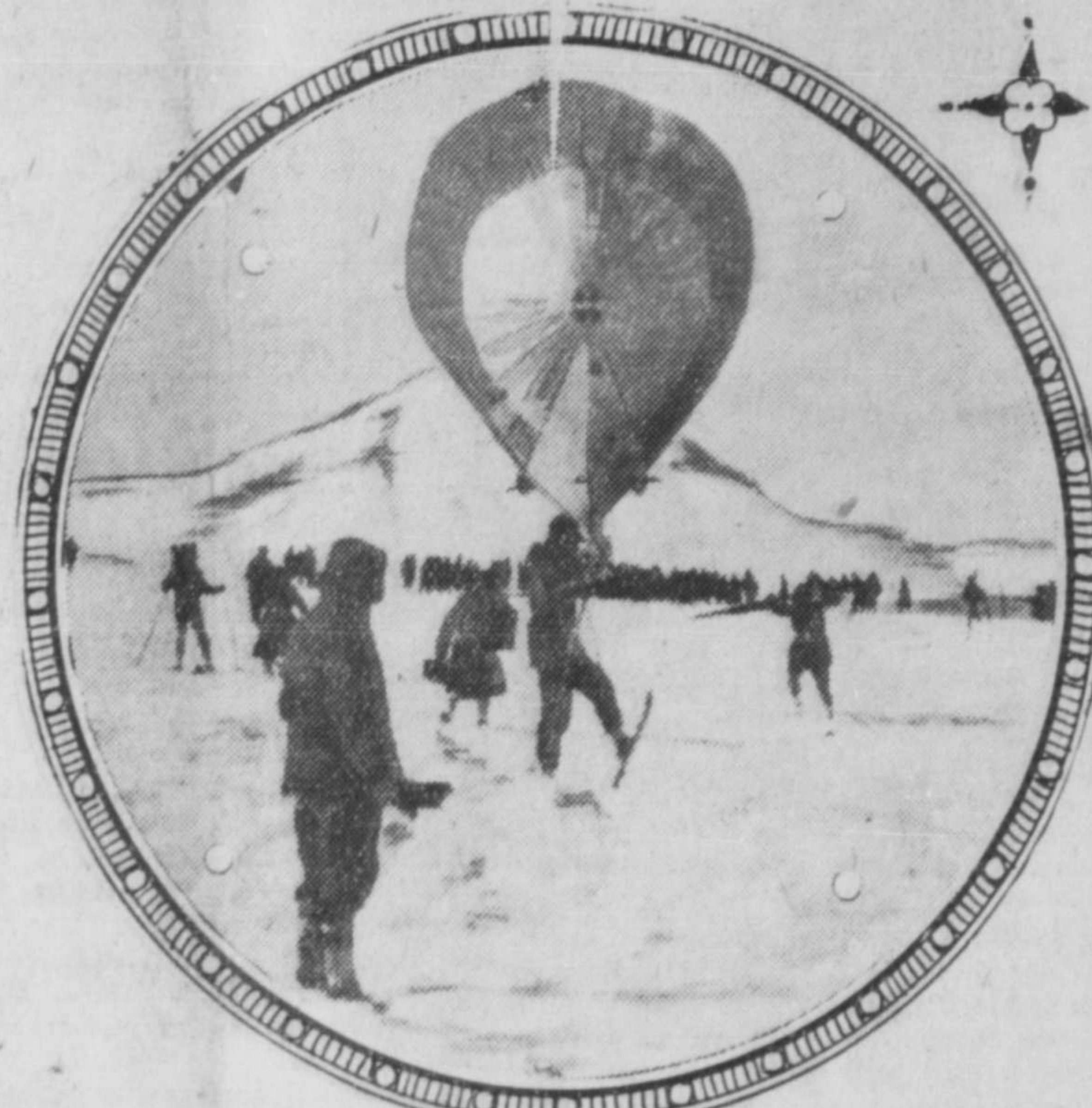
BEFORE THE ITALIA GOT LOST IN THE ARCTIC: The picture shows the dirigible being held down by its ground crew at Spitsbergen prior to rising into the clouds, headed for the North Pole

The Fisheries department announces that an additional twelve hours has been added to the already existing 48 hour weekly close season on the Skeena River on account of the excessive number of licenses that have been issued.