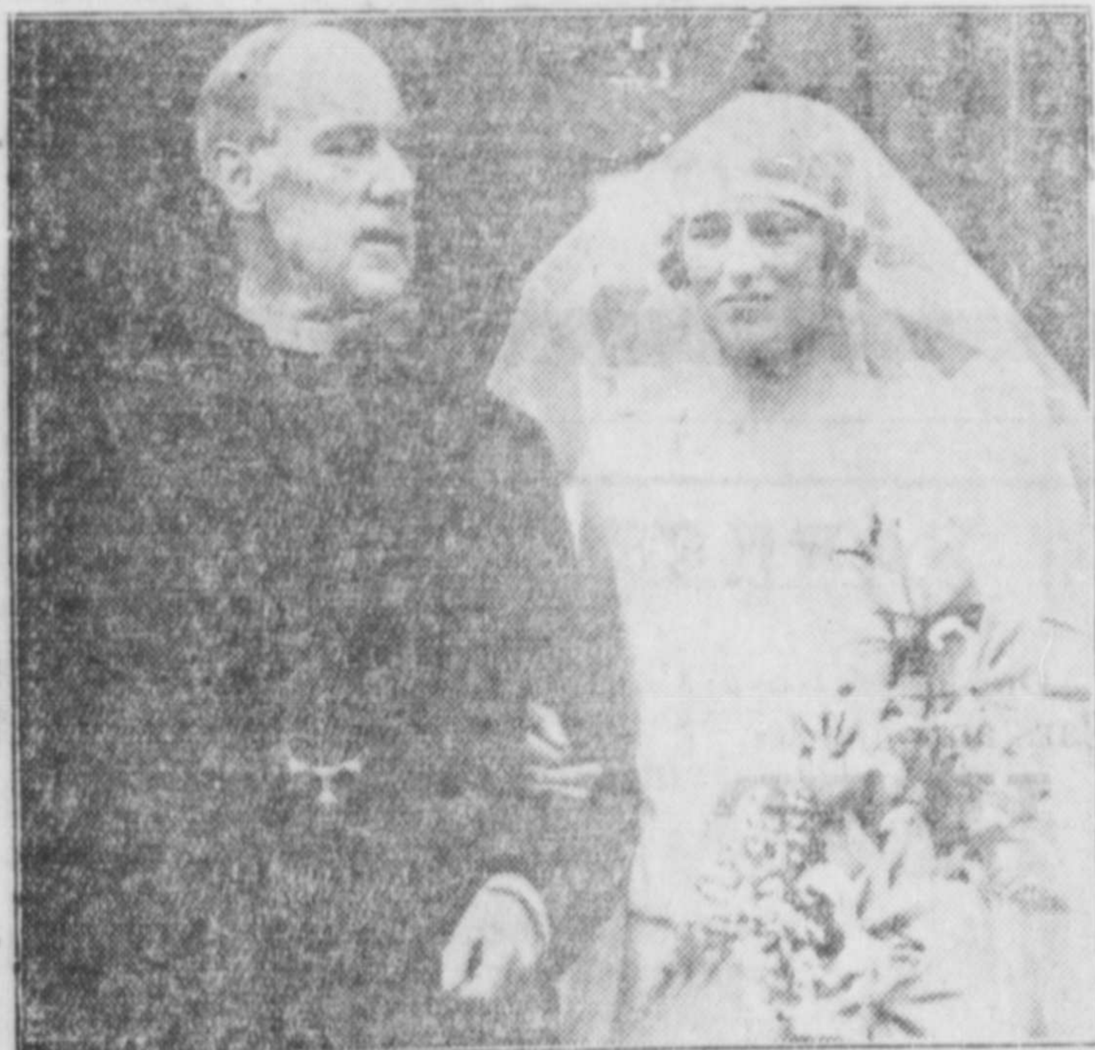
The Bishop of Norwich is here seen leaving St. Peter's Church, London, with his bride, after the wedding ceremony at which the Archbishop of Wales officiated.