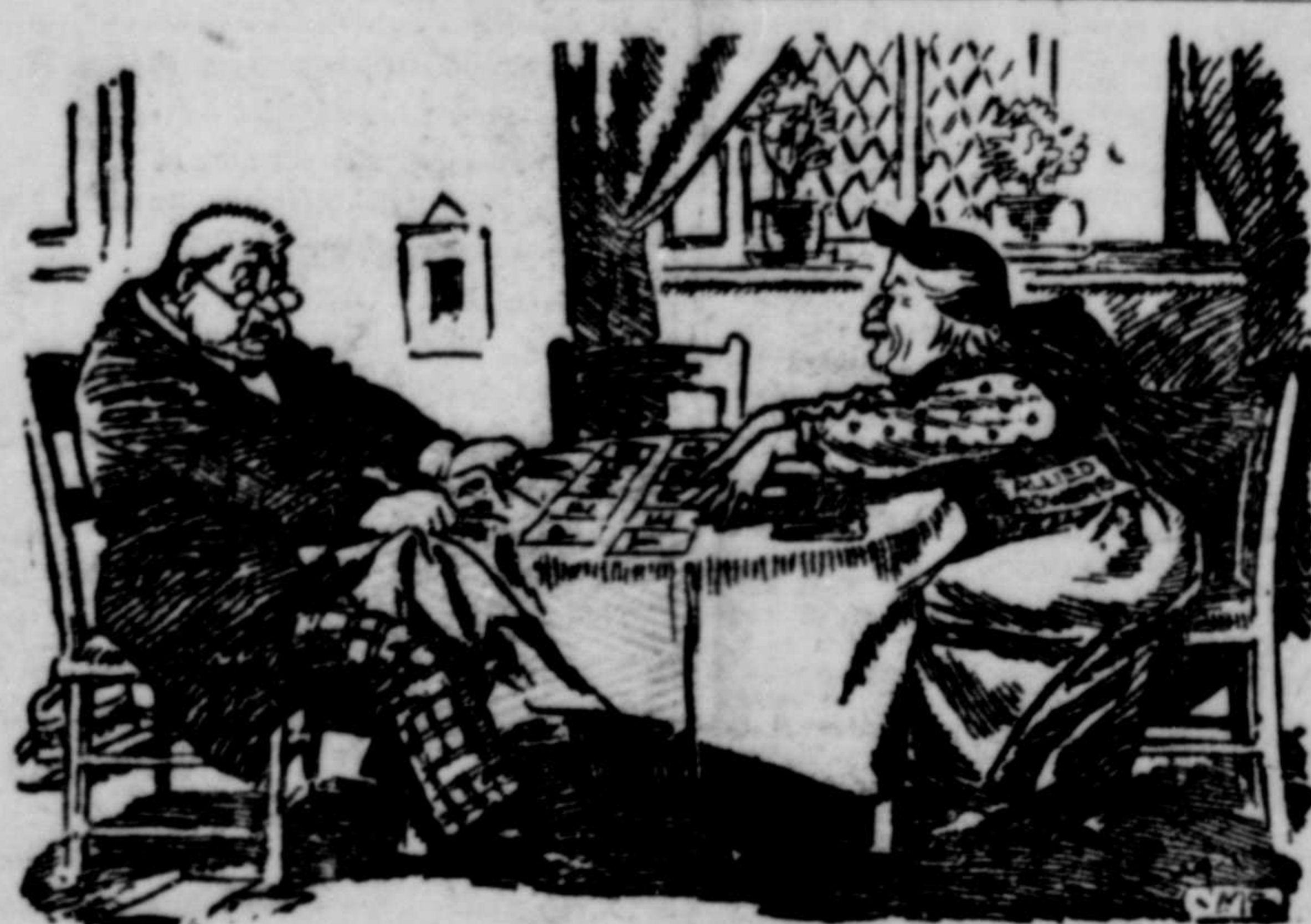
Telling His Fortune

Edmonton, July 15.—The Prince of Wales will visit both Edmonton and Calgary. Governor Brett has just received advice from the Duke of Devonshire that the Prince will arrive here on the morning of Friday, September 12, and will make a stop of two full days, leaving for Calgary on Saturday at midnight.