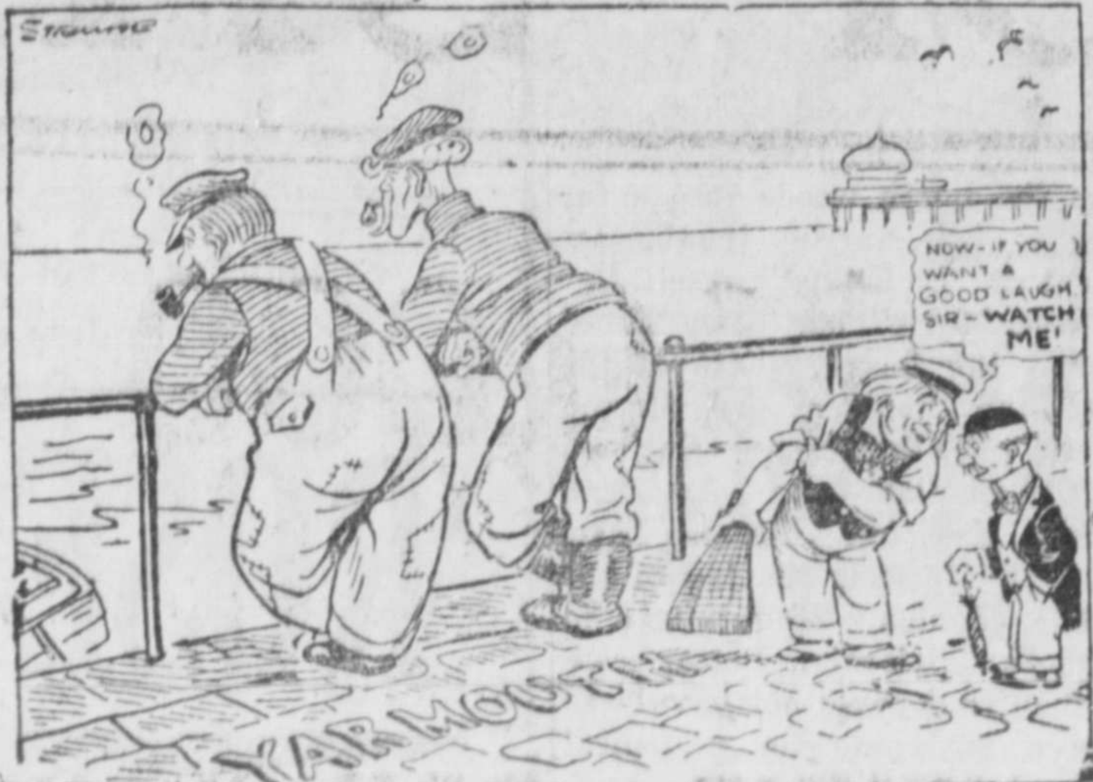
STANLEY AND RAMSAY WAITING FOR THE SMACKS Lloyd George means business (The British Liberal Conference was held at Yarmouth) —The Daily Express

THIS IS THE PAGE WHICH MOST PEOPLE READ BECAUSE IT IS FULL OF HUMAN BUSINESS INTEREST TO YOUNG AND OLD.