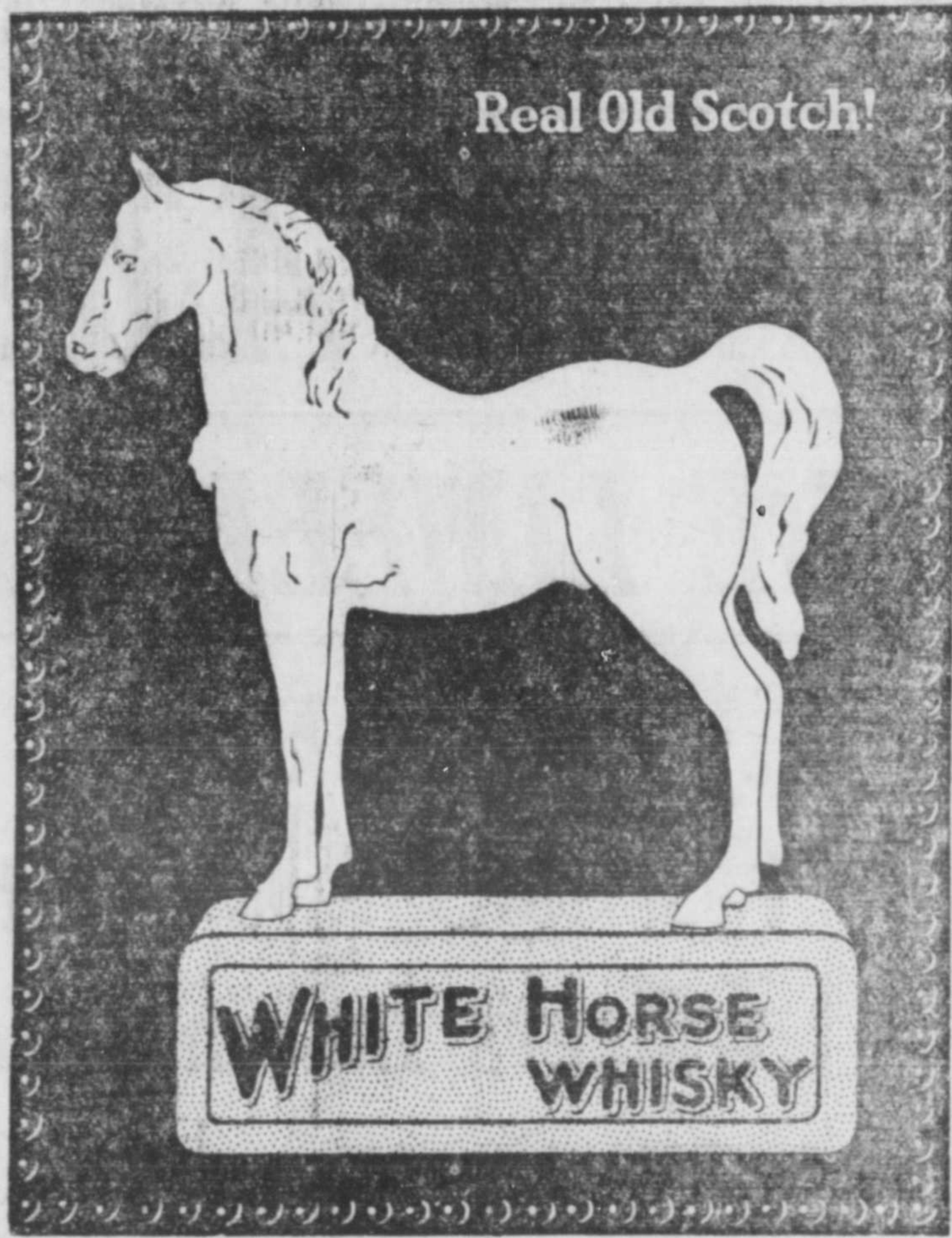
This advertisement is not published or displayed by the Liquor Control Board or by the Government of British Columbia