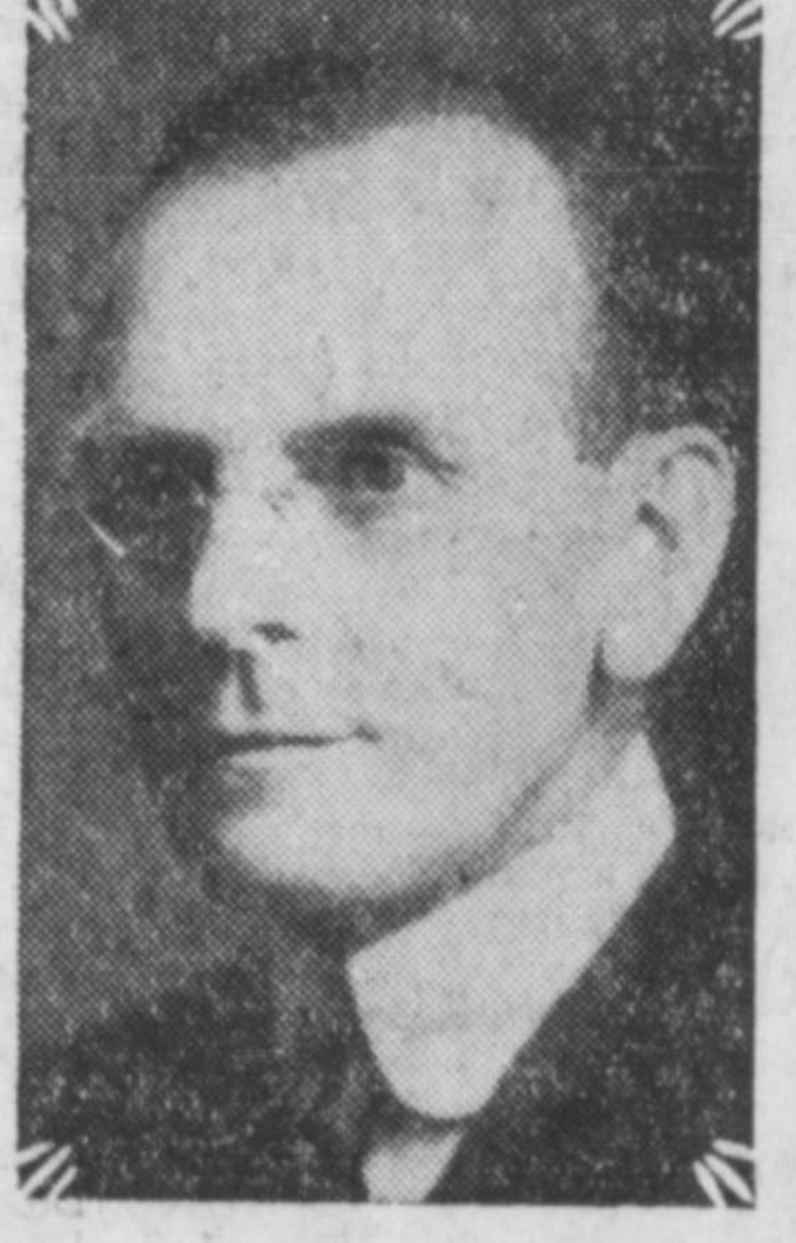
Joseph E. Atkinson, publisher of The Toronto Star, who, it is rumored, is to be offered one of the vacant senatorships.