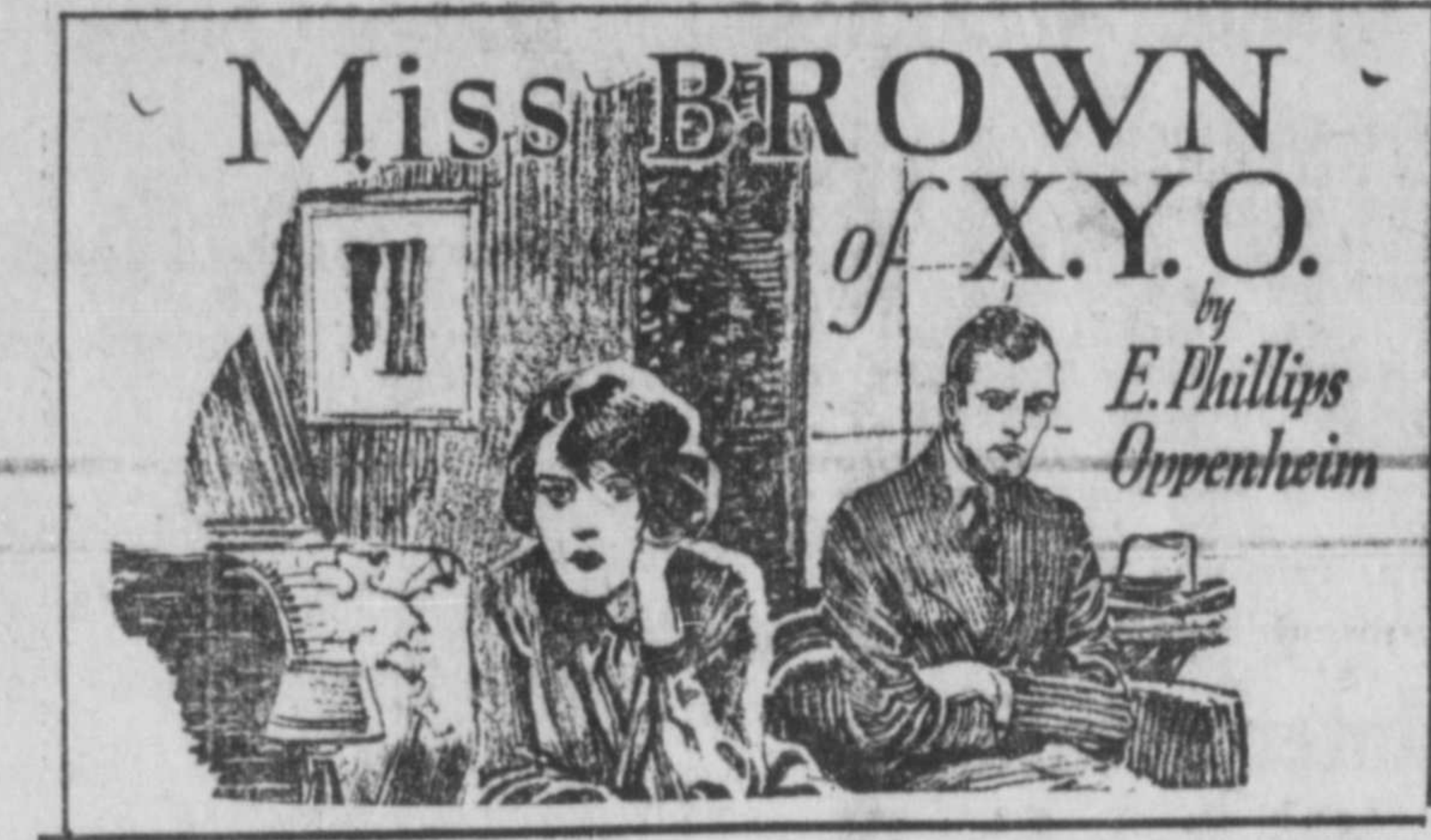
Copyright, 1927, by E. Phillips Oppenheim