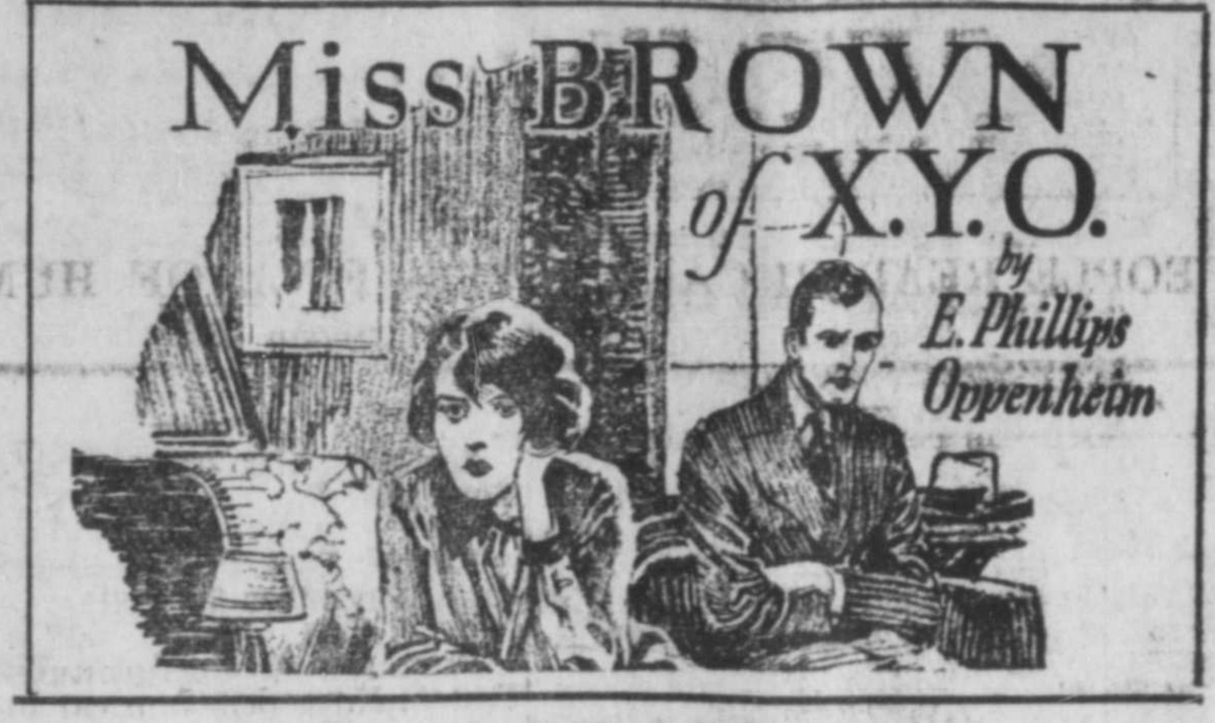
Copyright, 1927, by E. Phillips Oppenheim