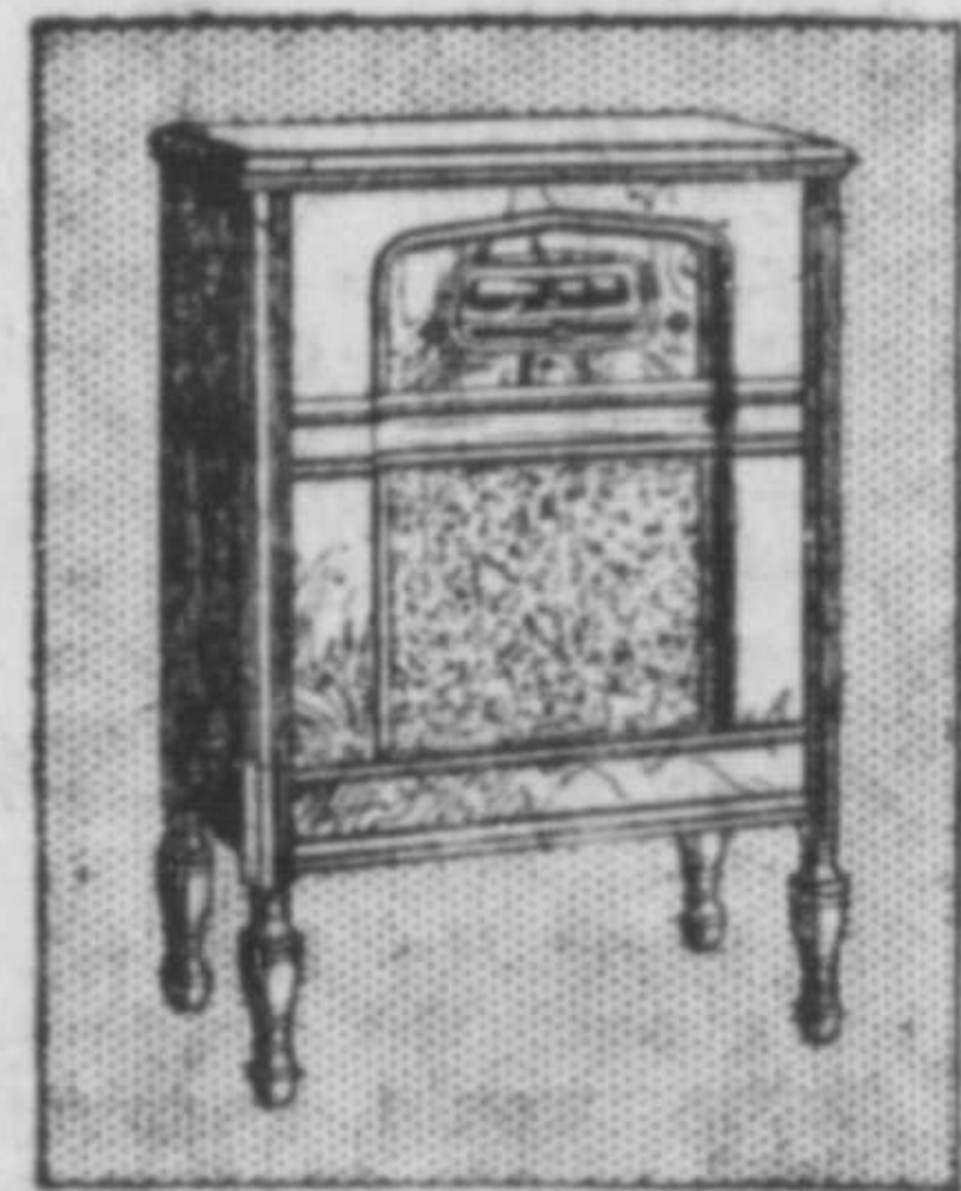
VICTOR RADIO CONSOLE R-52 $255 (Complete with tubes)