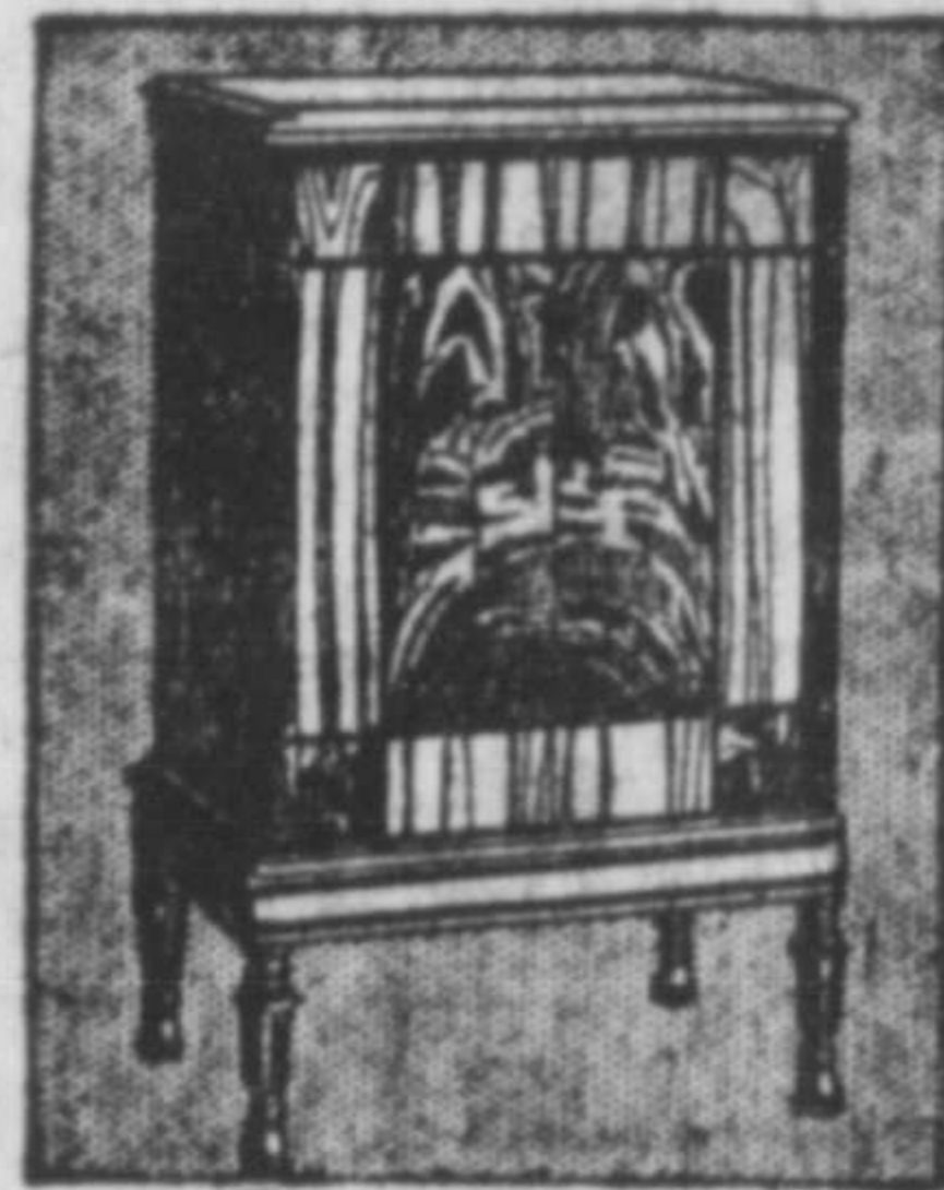
VICTOR RADIO-ELECTROLA RE-45 $375 (Complete with tubes)