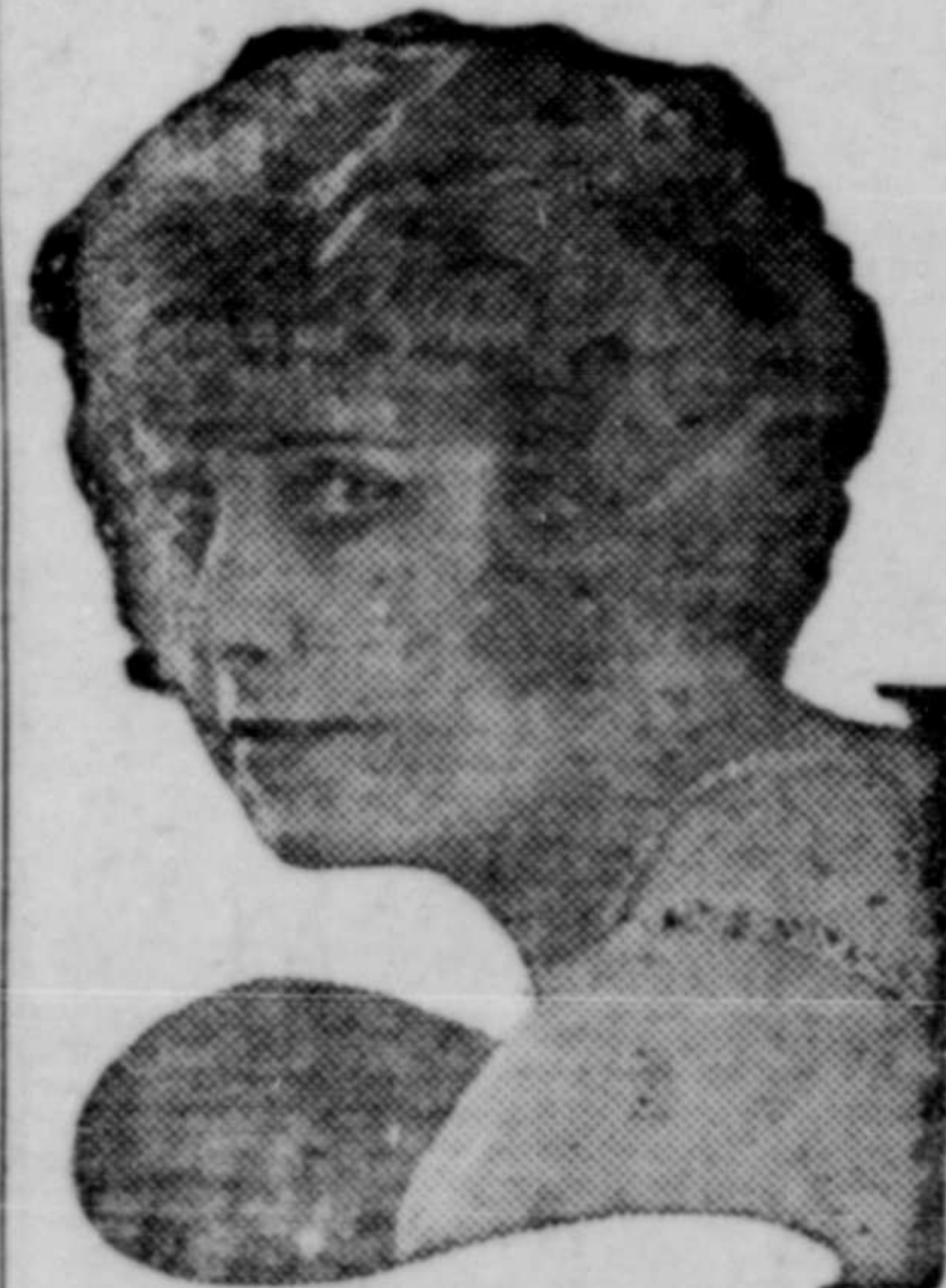
PEARL WHITE, the peerless star, appearing in the great Pathe serial "The Lightning Raider" at the Westholme Theatre tonight.