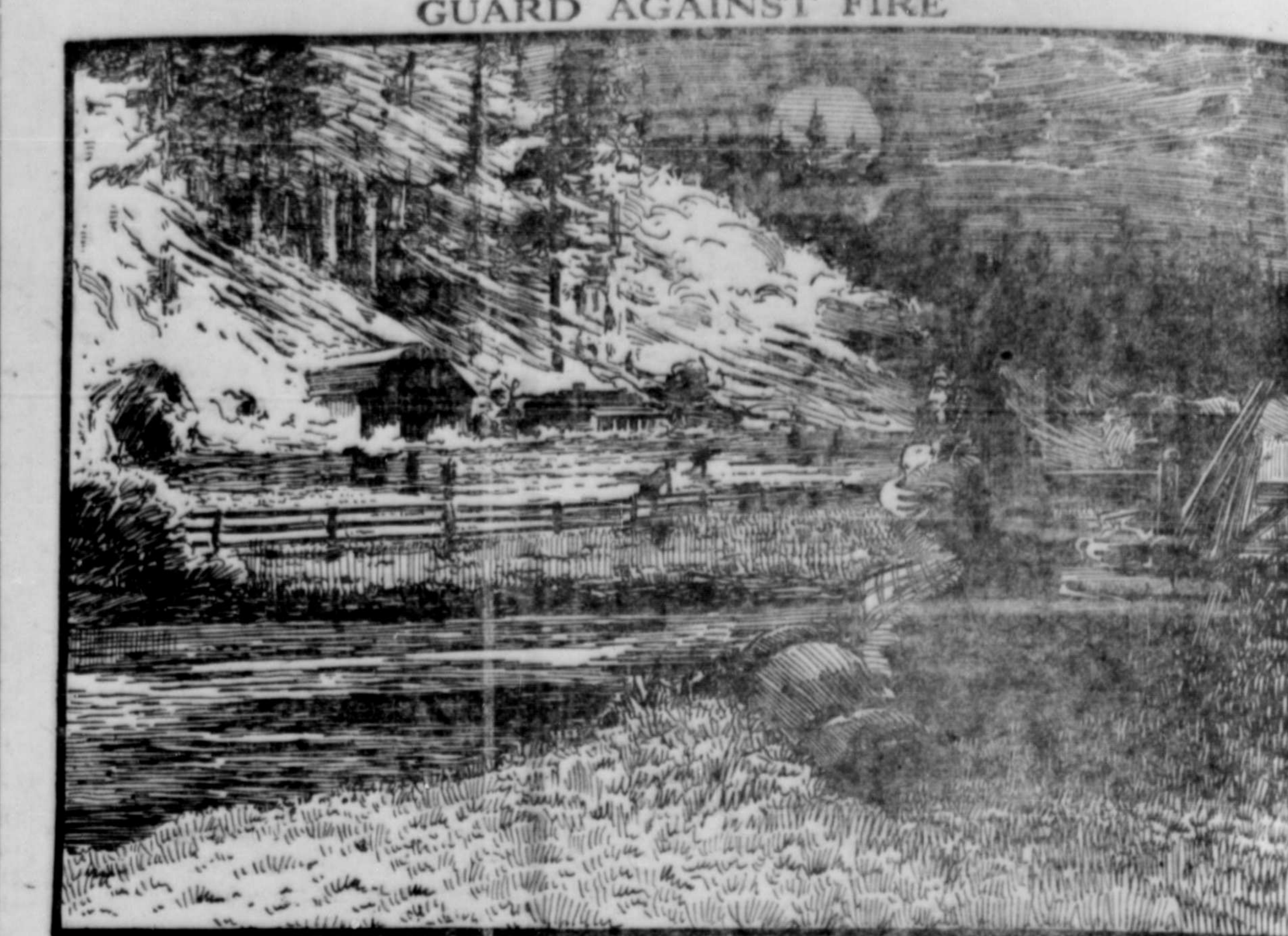
GUARD AGAINST FIRE