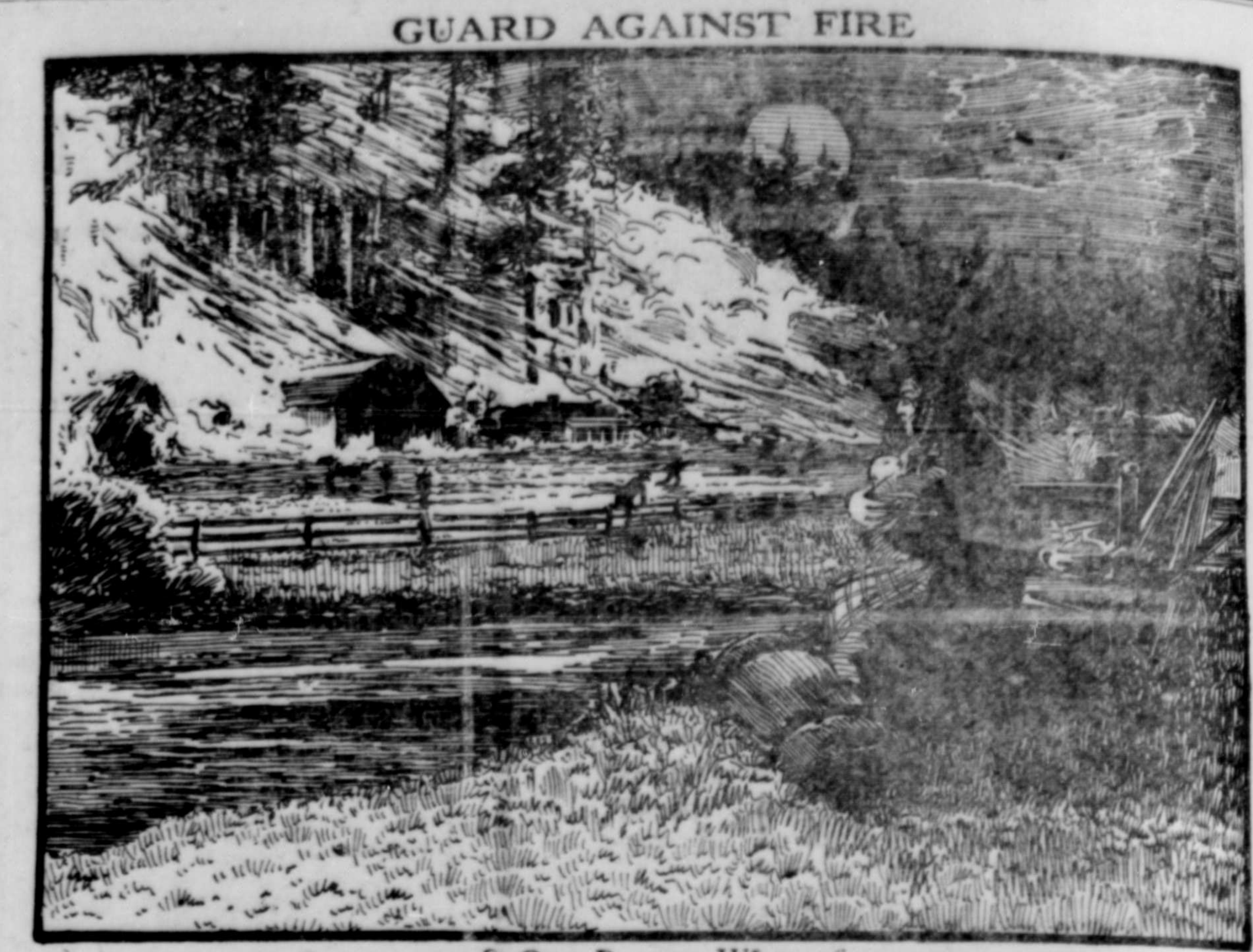
One Reason Why.