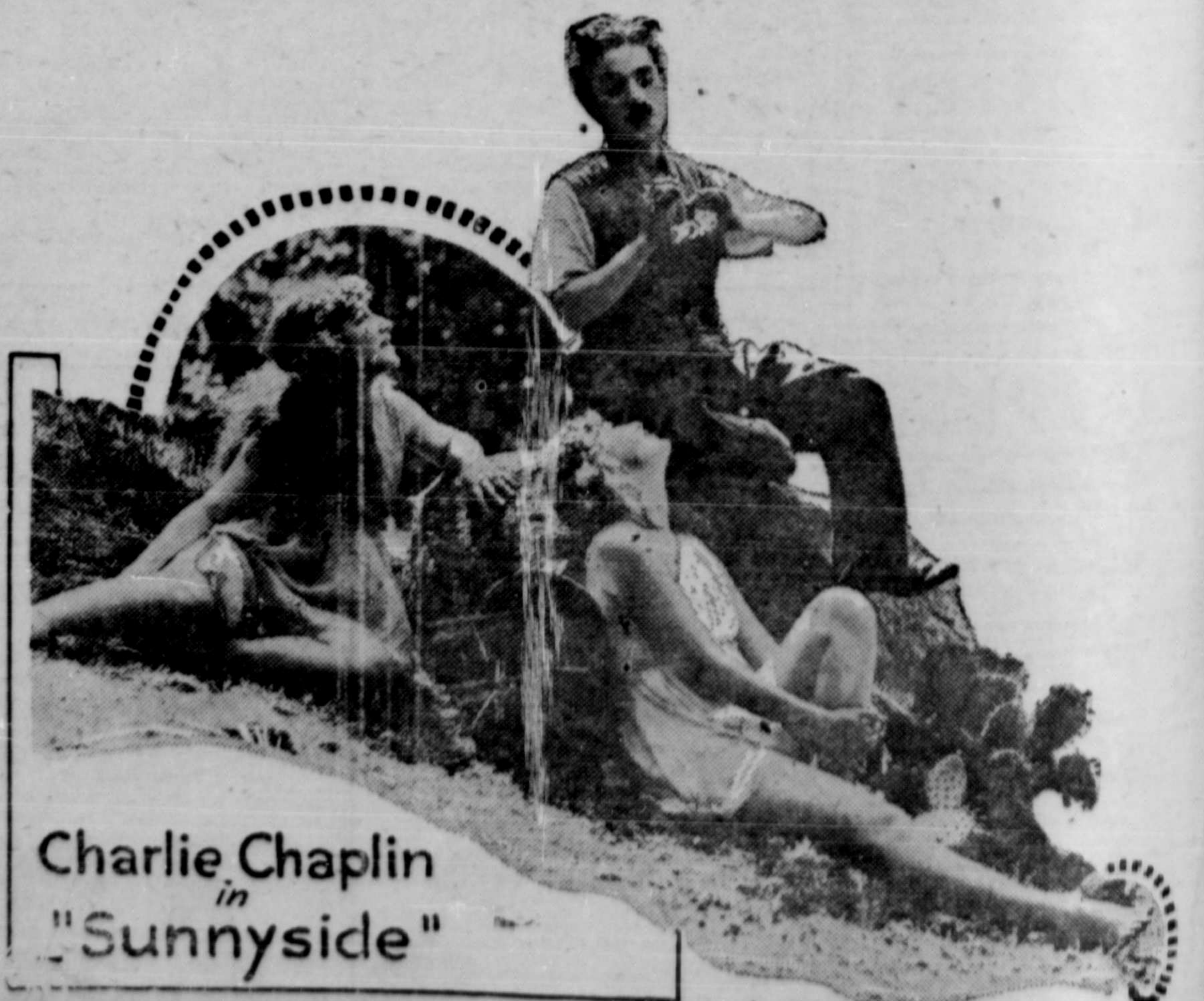
Charlie Chaplin in "Sunnyside"