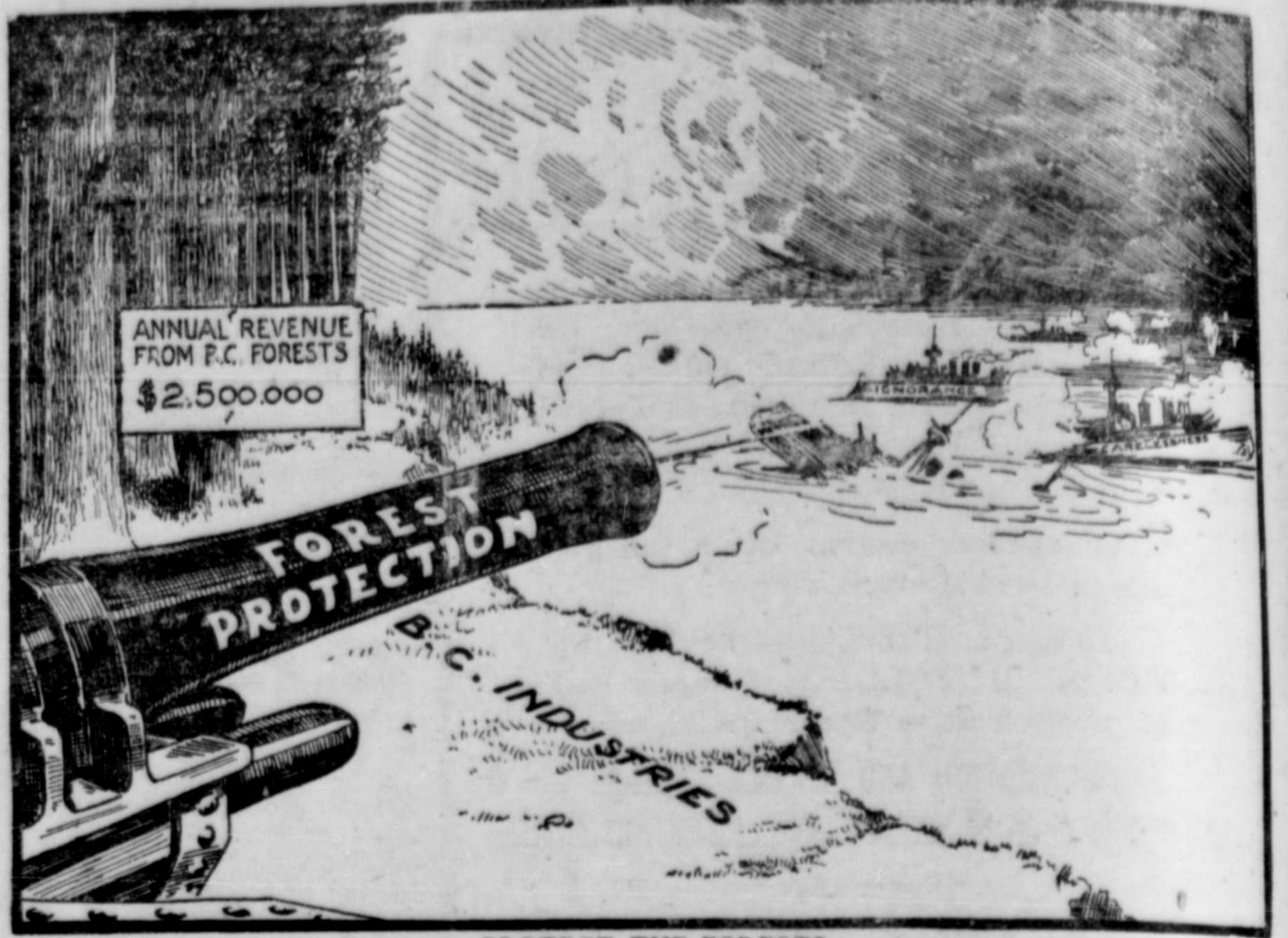
PROTECT THE FORESTS