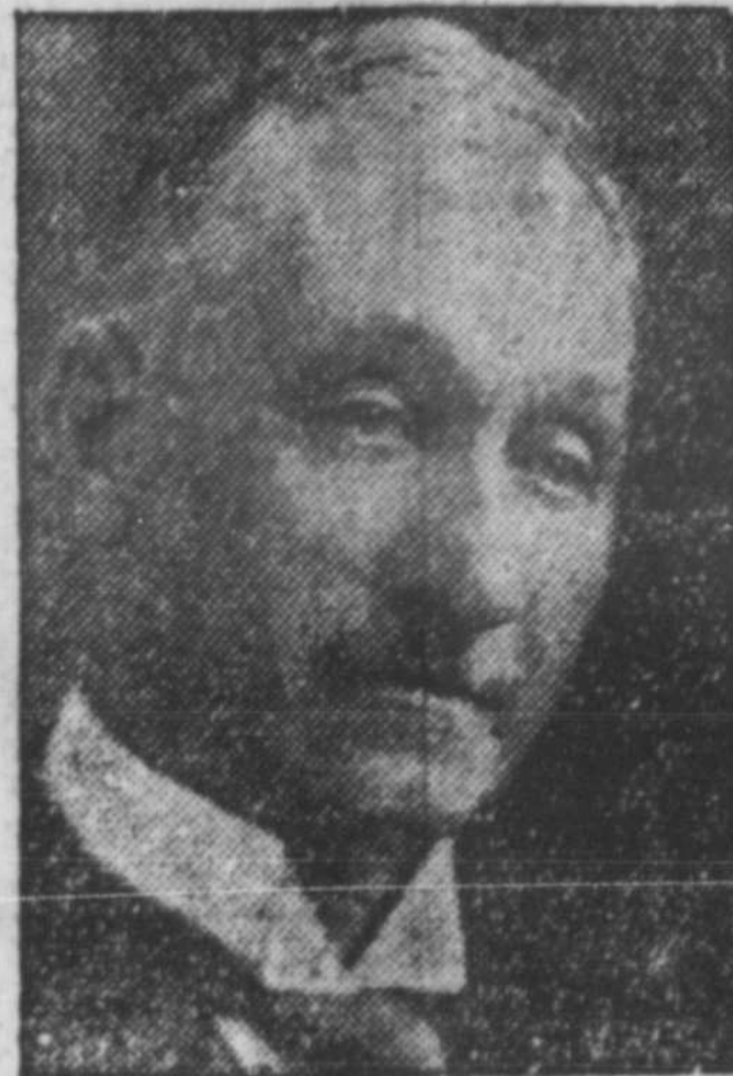
Minister of Finance in Mackenzie King Government who is reported slightly improved from previous illness.