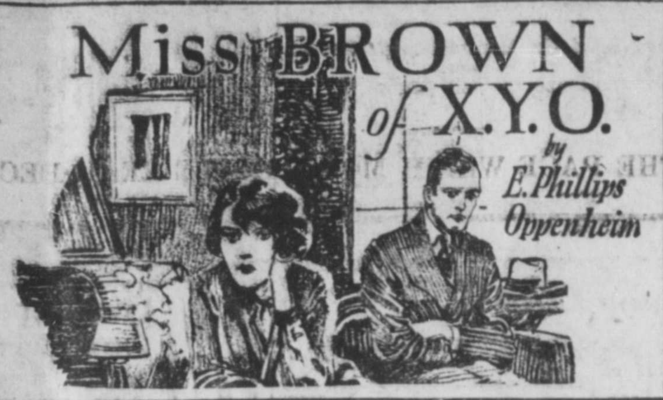
Copyright, 1927, by E. Phillips Oppenheim