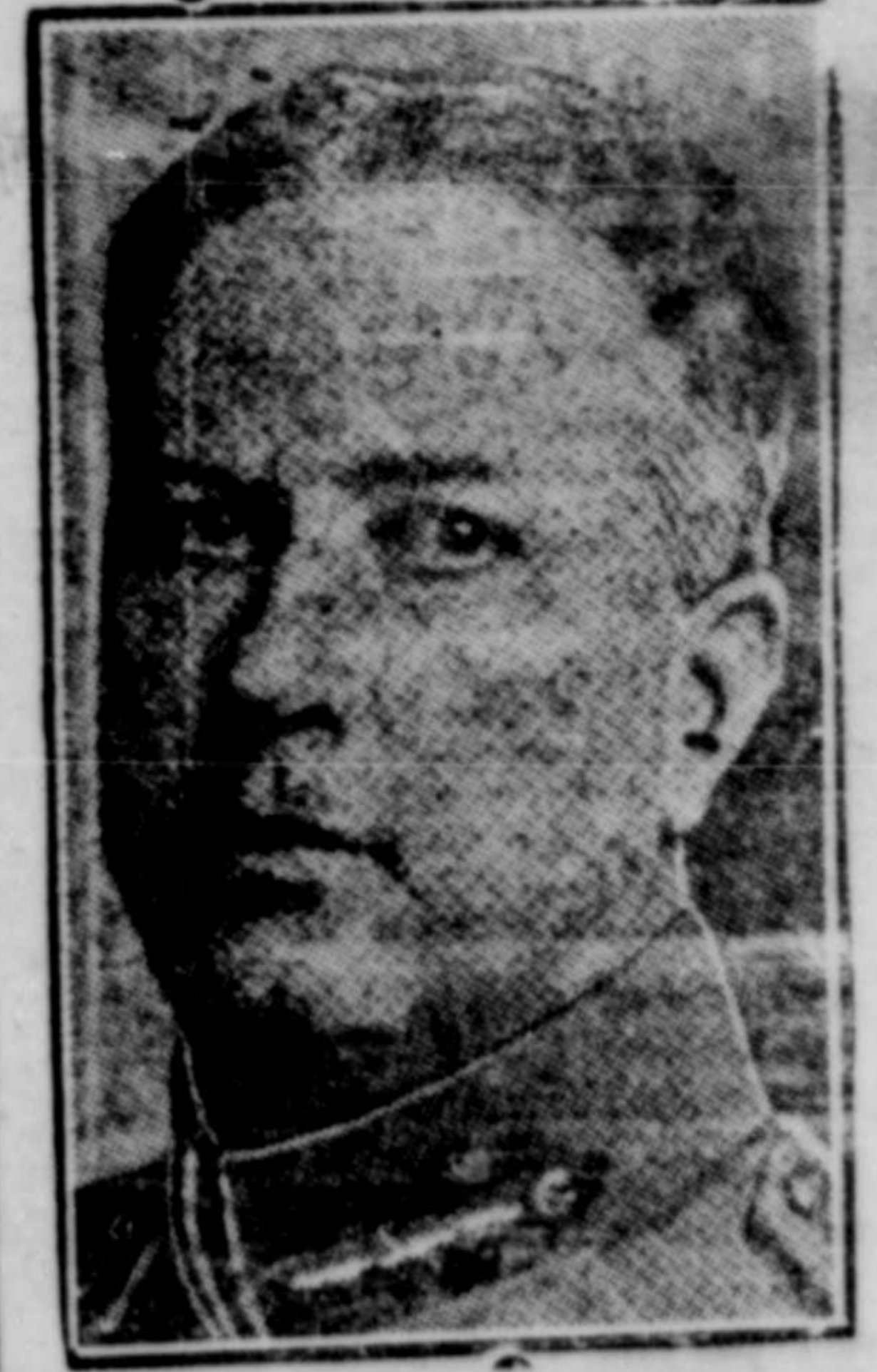
GENERAL SIR ARTHUR CURRIE The announcement of whose appointment to the position of Inspector-General was made yesterday.

Just arrived, men's dancing pumps. Family Shoe Store. tf