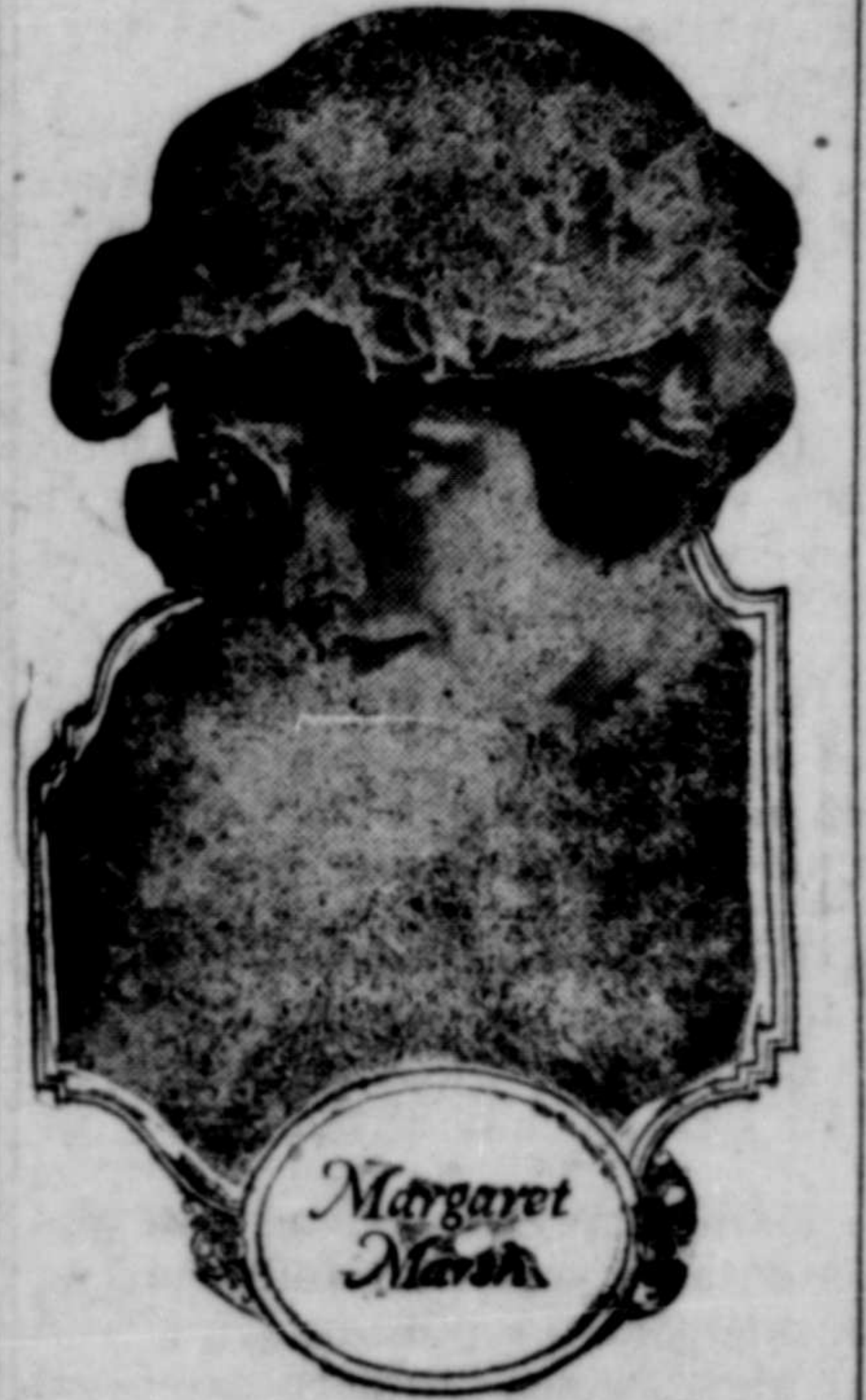
Leading lady in "Master Mystery" serial showing at the Empress Theatre tonight.