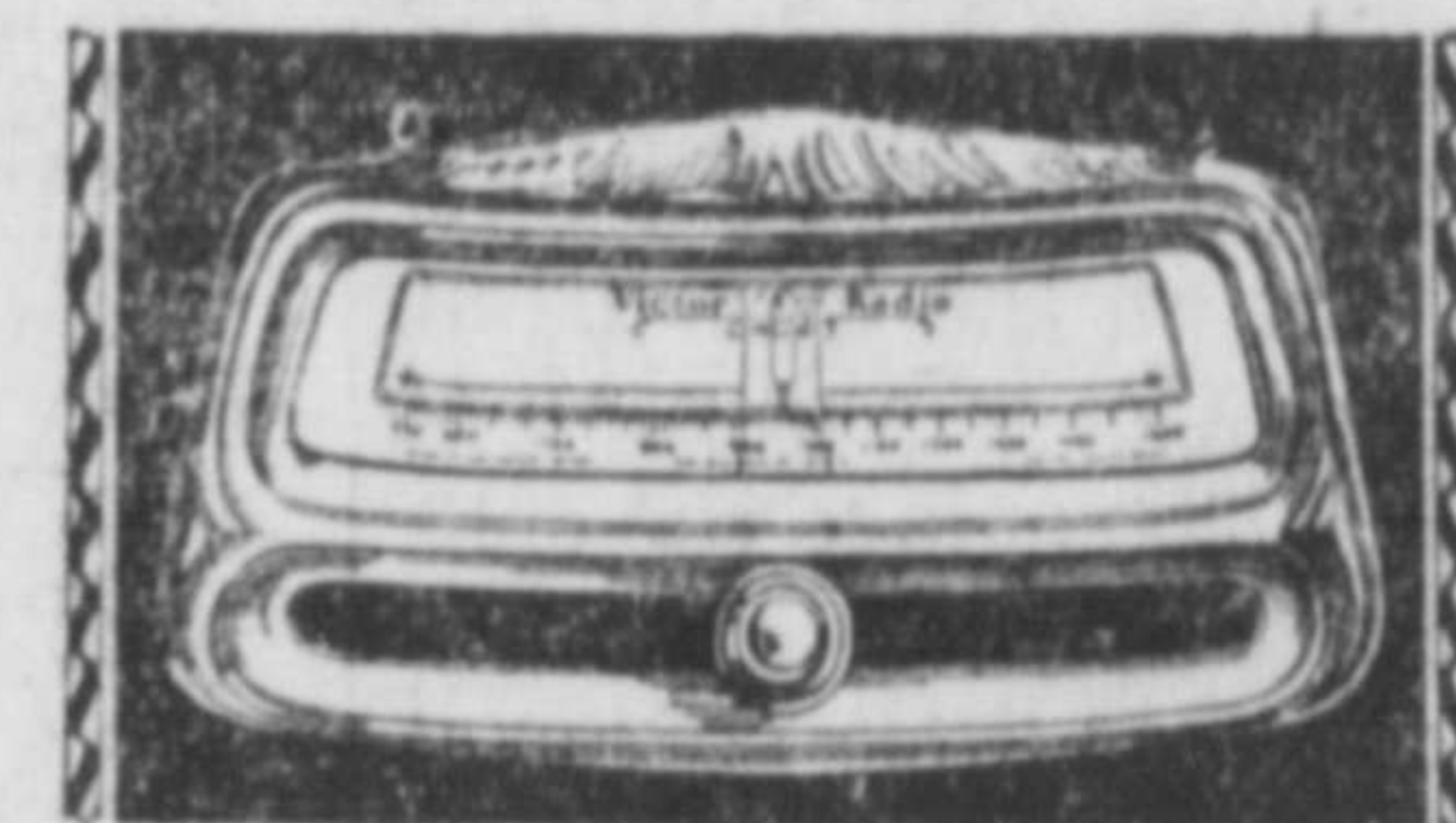
VICTOR RADIO-ELECTROLA RE-45 $375 (Complete with tubes)