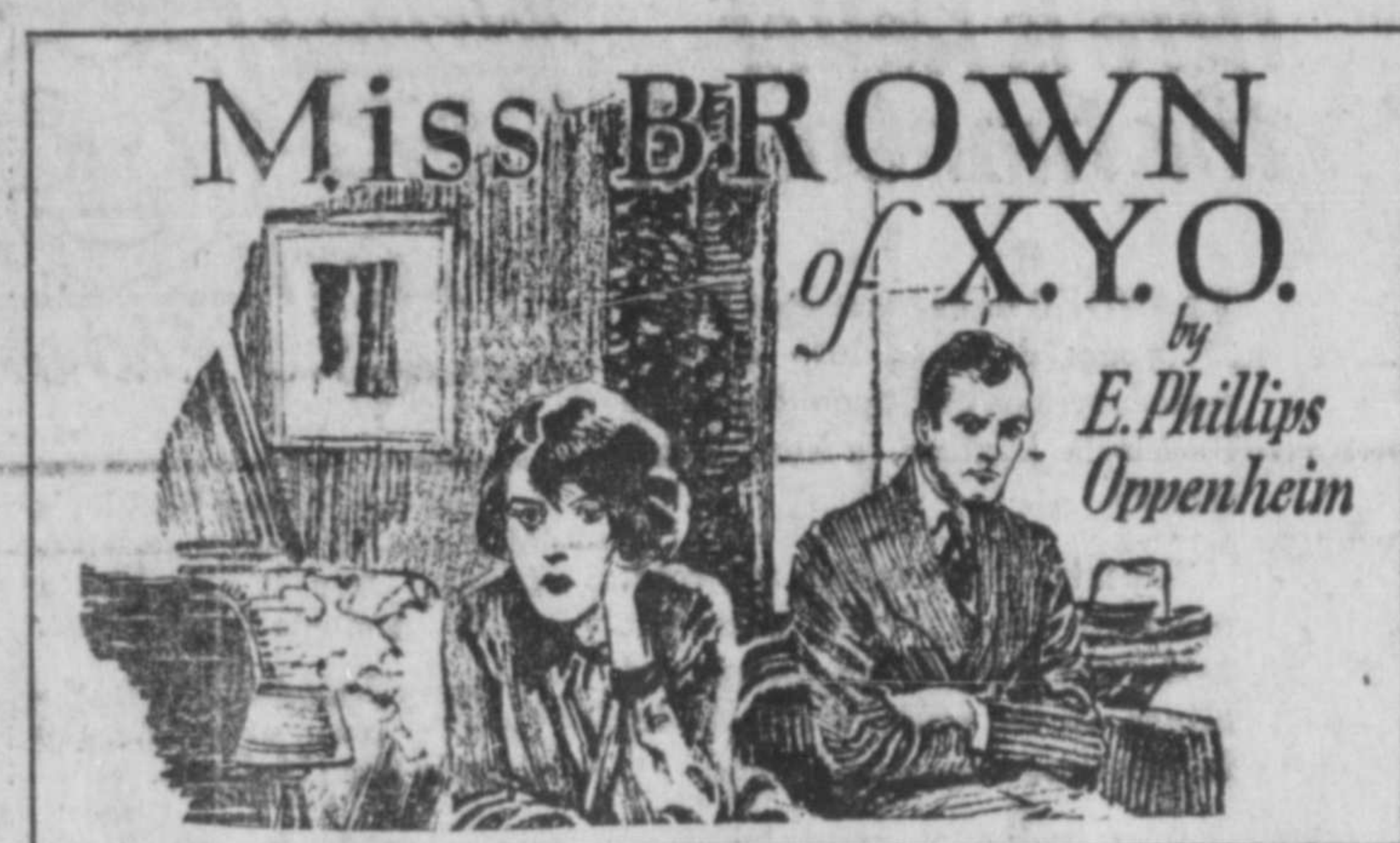
Copyright, 1927, by E. Phillips Oppenheim