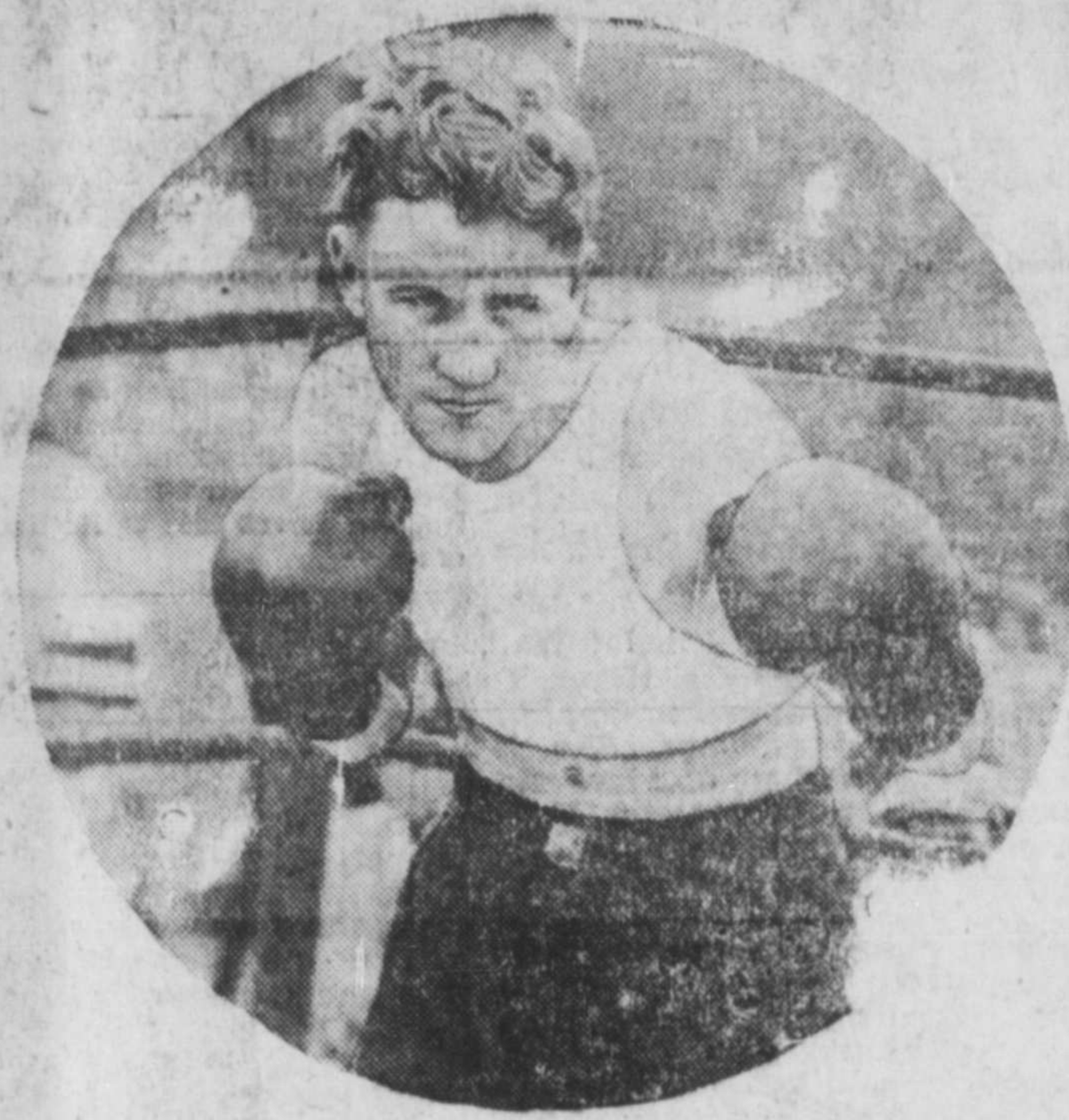
Ace Hudkins, who unsuccessfully attempted to wrest from Mickey Walker the middleweight title at Los Angeles.