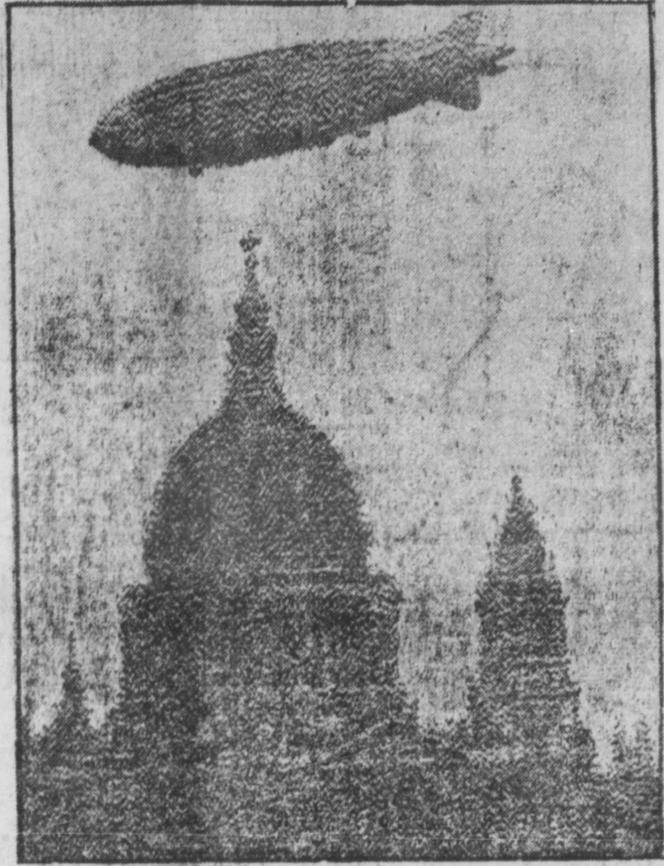
Above is a remarkable radio picture sent from England showing the new British airship R-101 hovering over St. Paul's Cathedral, London, on her first trial flight.