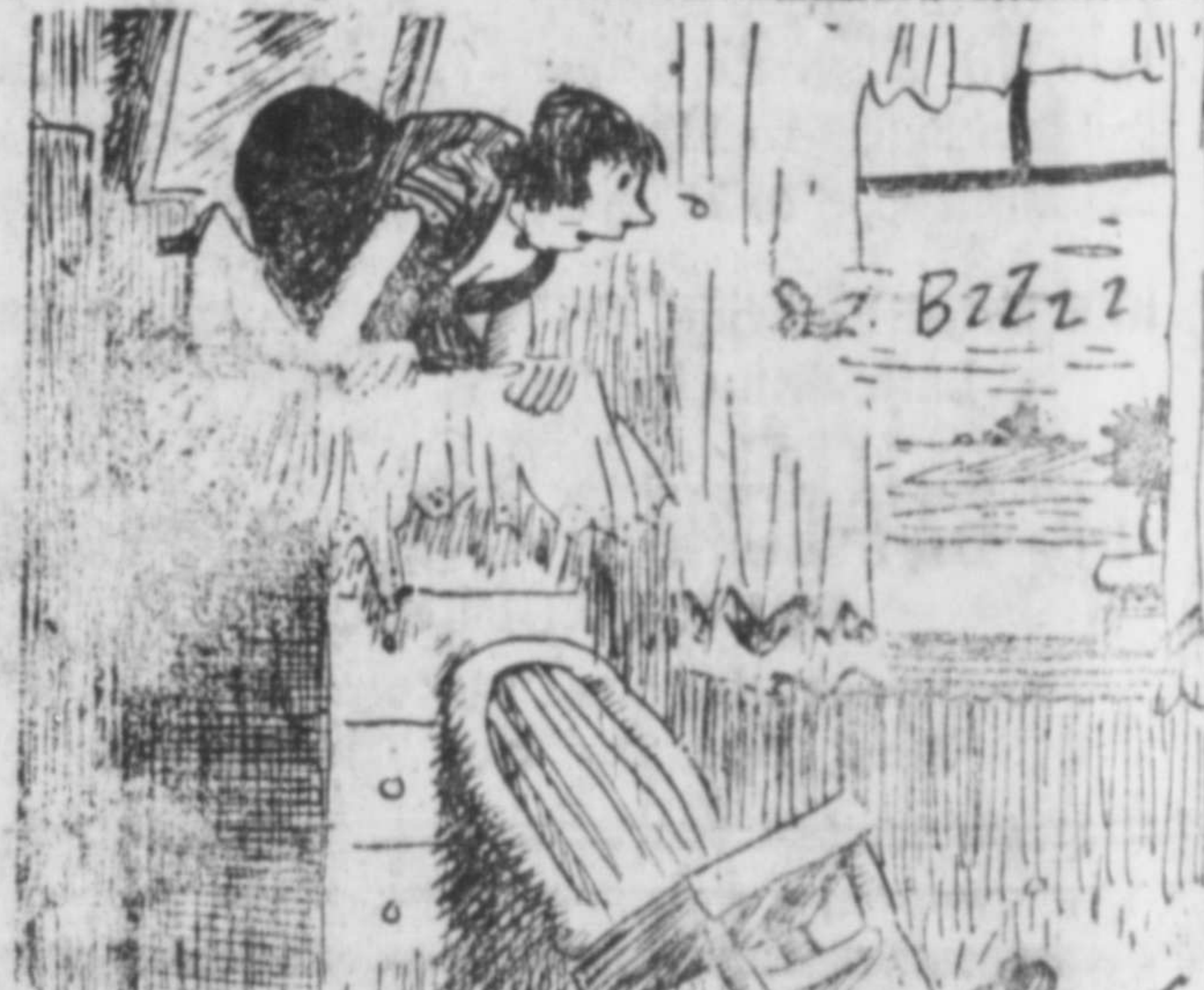
JUST AS YOU GAIN A CERTAIN AMOUNT OF SAFETY FROM THE 'RAT'—A 'BUMBLE BEE' BUZZES IN