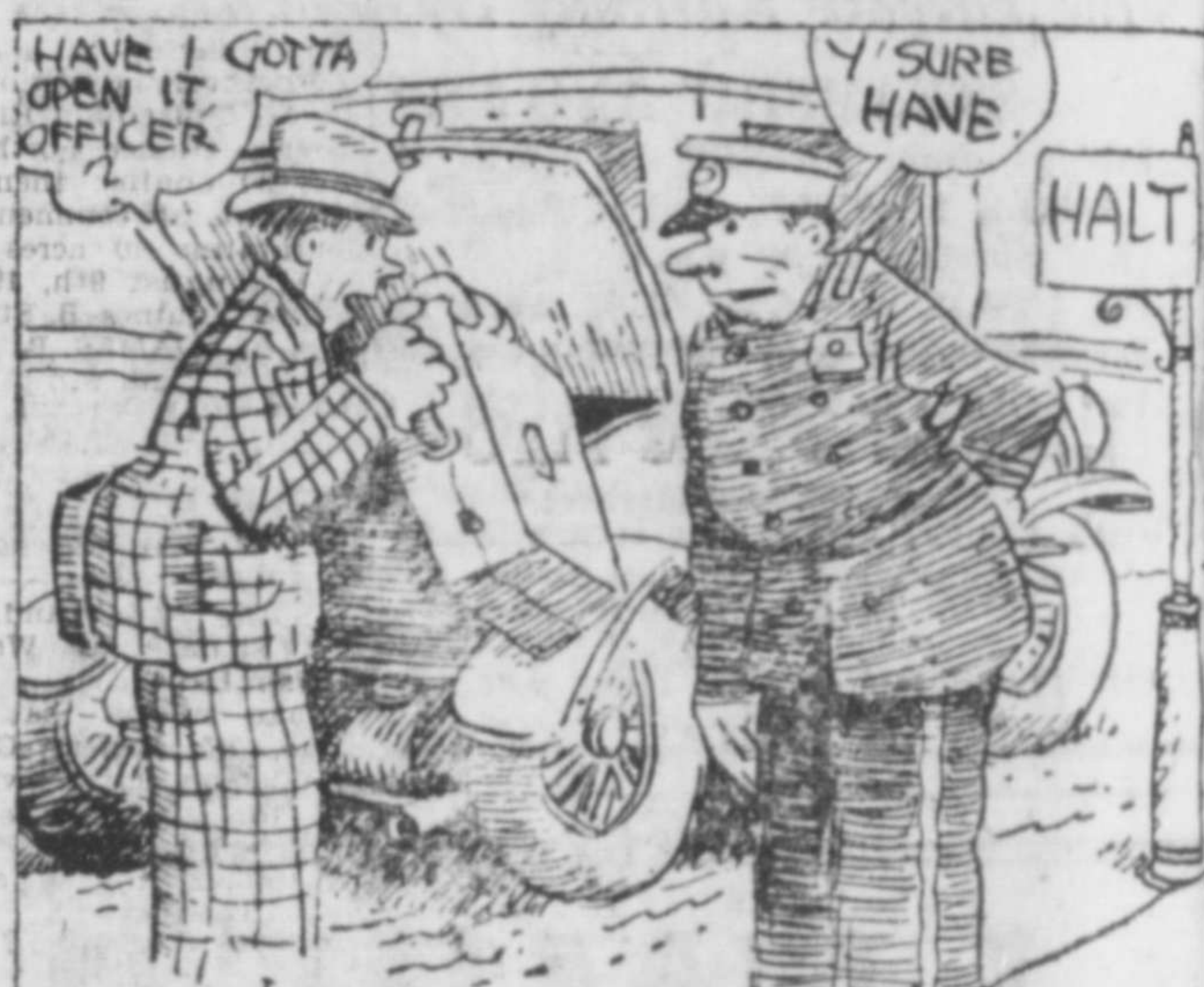
WILL YOU HAVE IN YOUR CAR IS A SUIT CASE FULL OF YOUR WIFE'S INTIMATE BELONGINGS WHEN THE AGRICULTURAL INSPECTOR STOPS YOU AT THE STATE LINE