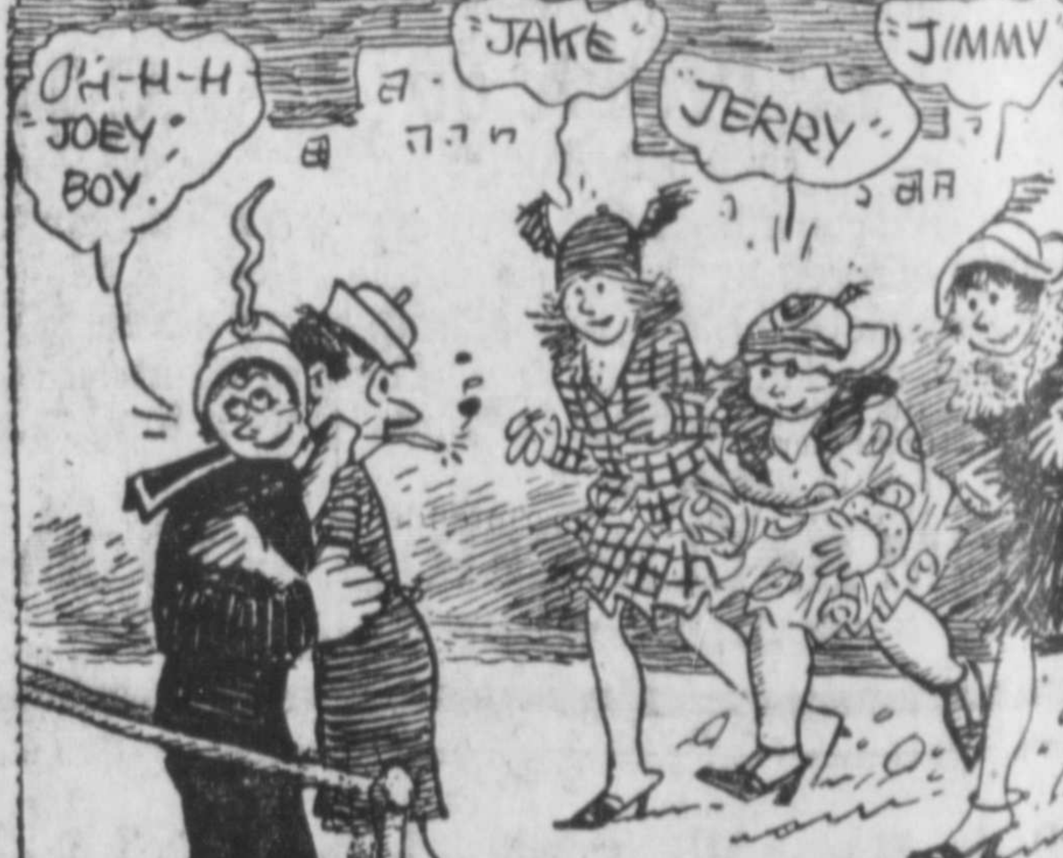
YOU LAND AND GREET THE SWEETHEART'S THEN THREE MORE FROM ADJACENT PORTS BARGE IN ON YOU