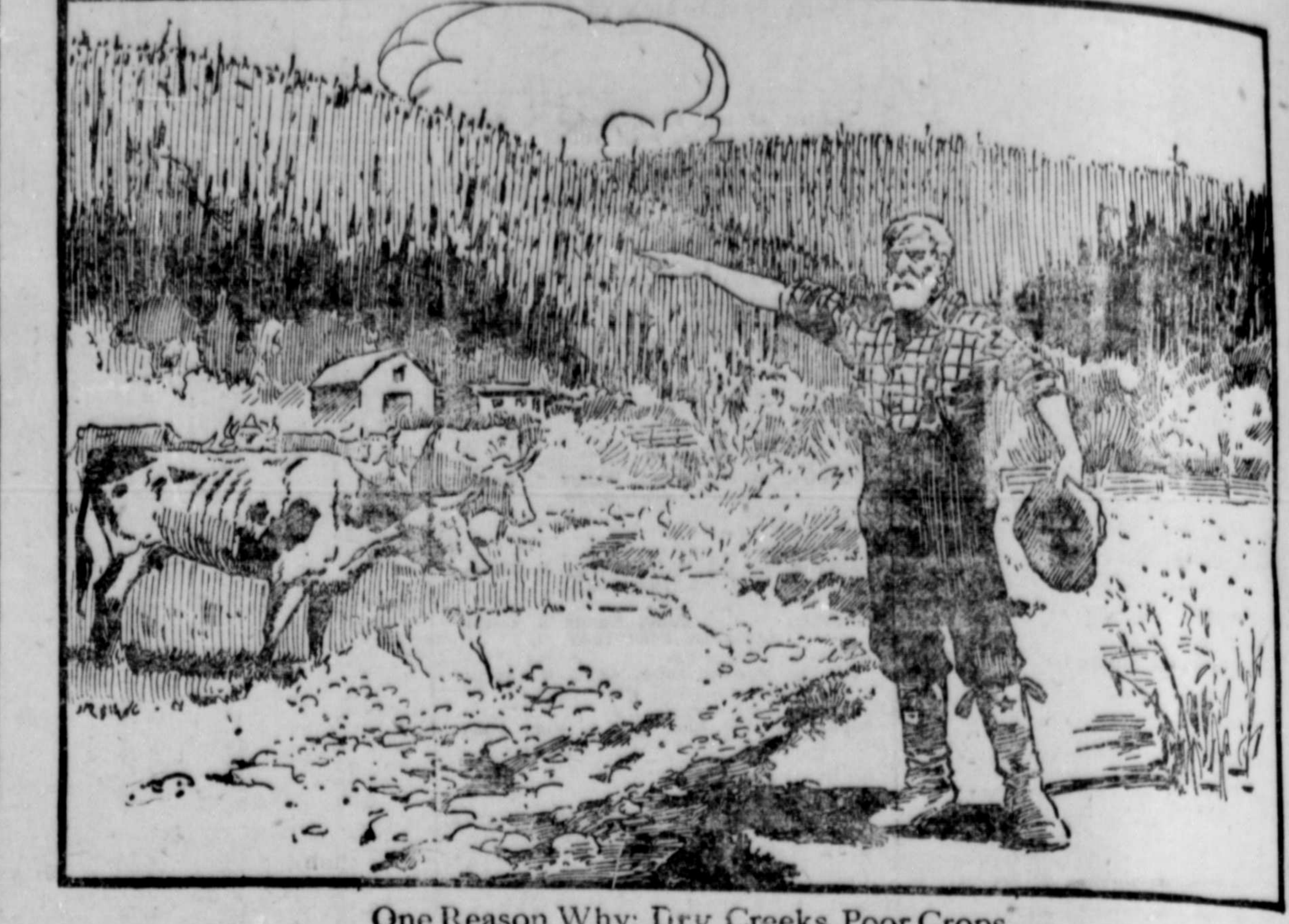
One Reason Why: Dry Creeks, Poor Crops.