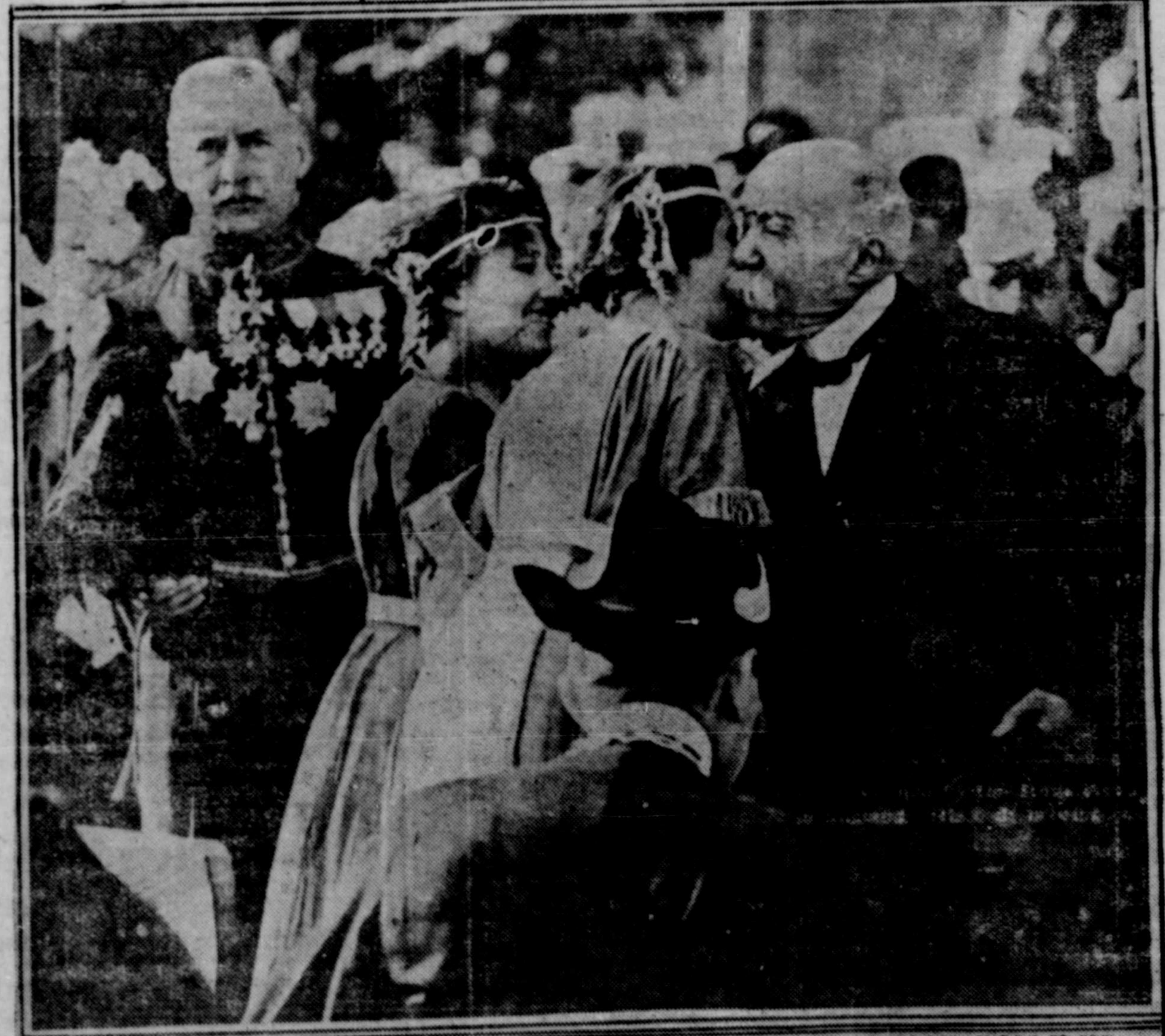
GEORGES CLEMENCEAU IN A NEW ROLE

Among all the great figures whom France loves and whom she welcomed to her peace celebration on July 14 one stands out alone—that of Clemenceau. "Père Victoire," the army calls the man who fought so tirelessly and so magnificently. On what was, perhaps, the greatest day in the history of France her people's deepest cheers were for the octogenarian statesman, who never faltered or hesitated even when the day was darkest but who, fighting at home as gallantly as the poilus were fighting at the front, led his country to victory.