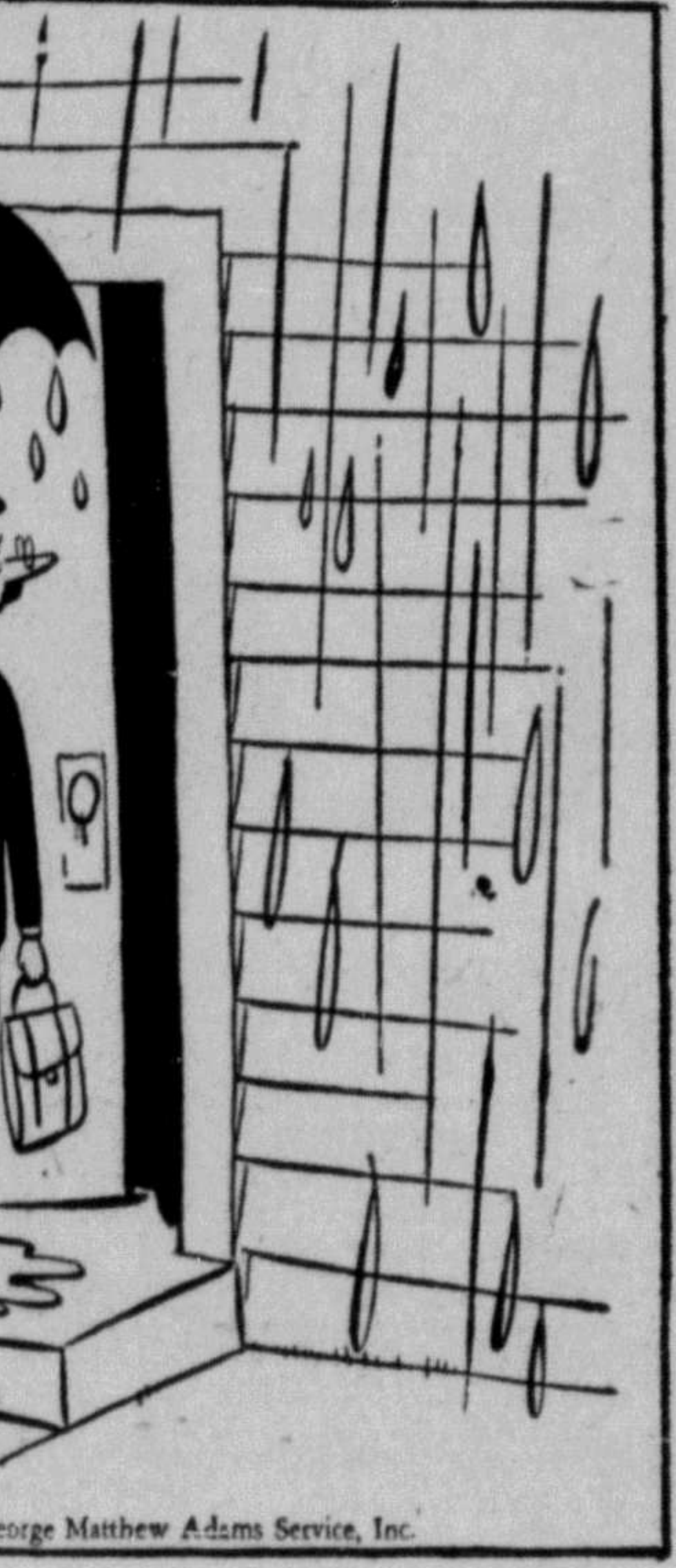
The George Mathew Adams Service, Inc.

"I haven't forgotten anything, pet... rubbers, umbrella, and hat"