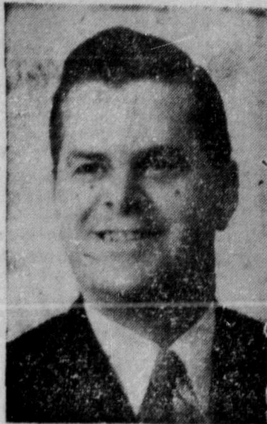
WANTS ELECTED ... W. A. C. Bennett, MLA

W. A. C. Bennett, Okanagan Independent, broke away from the coalition last session, called the British Columbia government yesterday to call a general election at the earliest possible moment. He made his call in the opening of the special session of the Legislature to consider the coalition legislation.