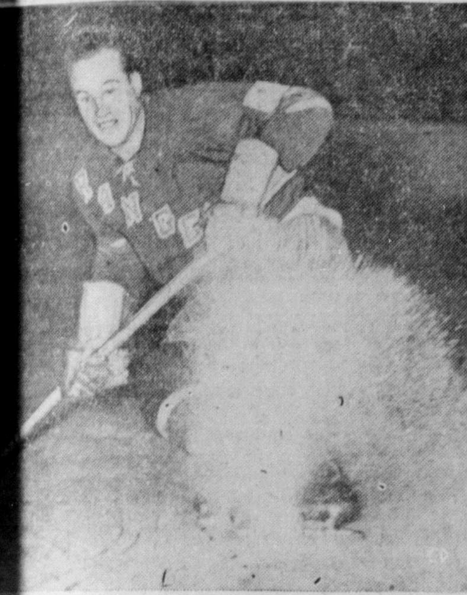
CENTRE—Crafty Edgar Laprade, centre on the New Englanders' first line skates kinks from his 32-year-old legs. Frank Boucher is leaning heavily on the veteran who is in his seventh season with the New Yorkers.

EARLY ABDICATOR The first recorded abdication of a sovereign was that of the Roman Dictator Sulla in 79 B.C.