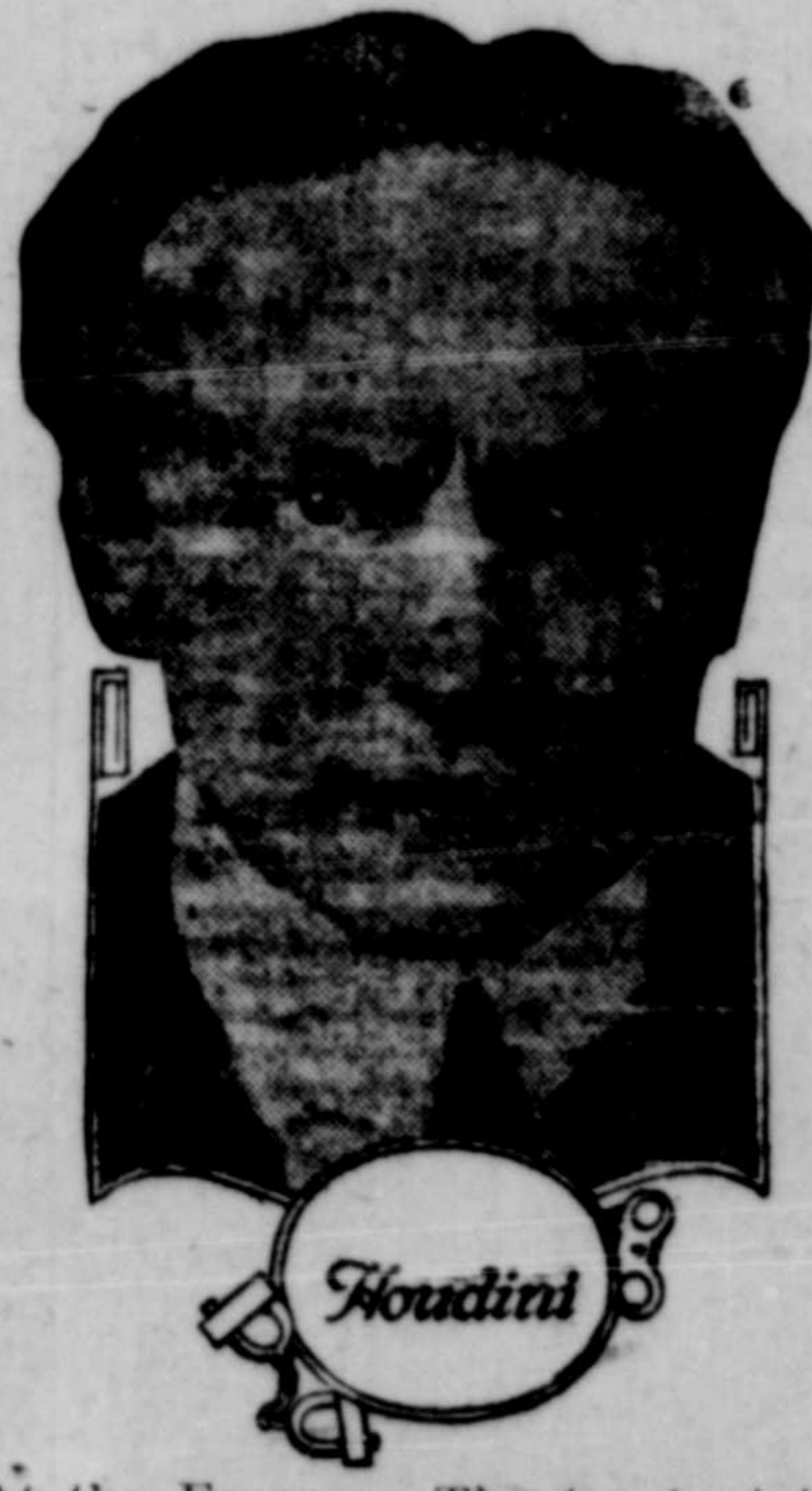
At the Empress Theatre tonight.