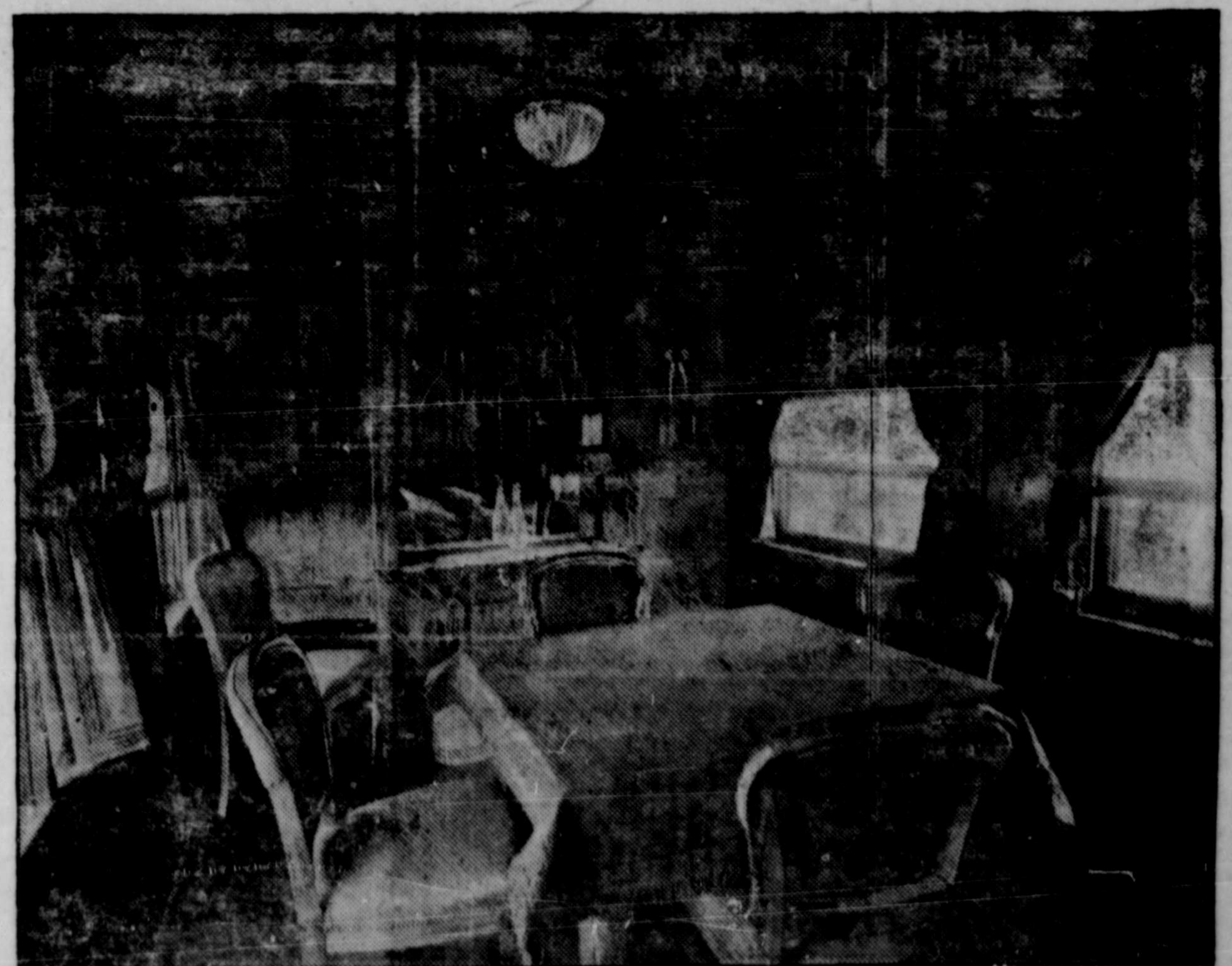
The Parlor Car in which the Prince of Wales travelled, provided by the C.P.R.