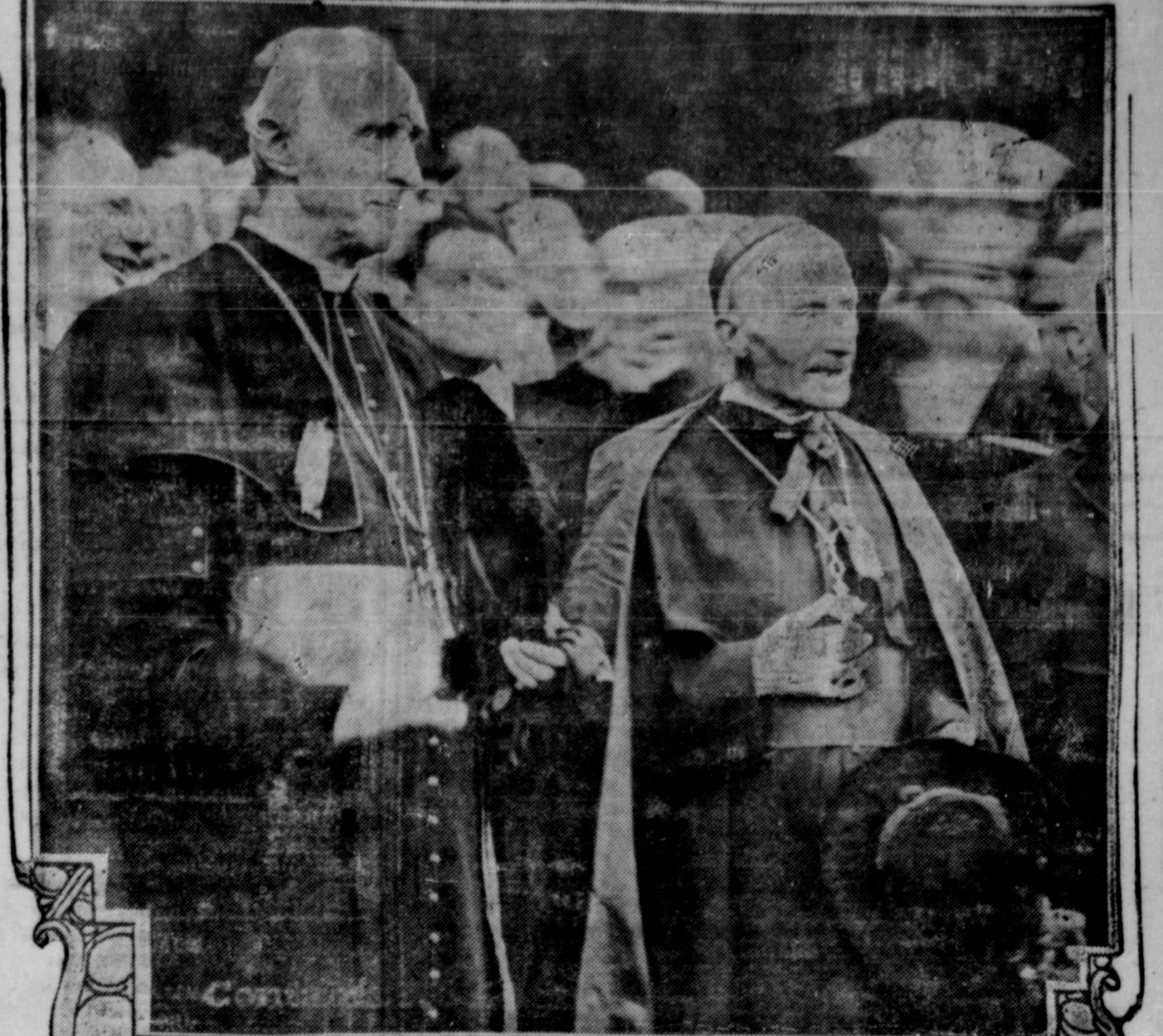
CARDINAL MERCIER, UPON HIS ARRIVAL IN BALTIMORE, and CARDINAL GIBBONS.

Declaring in writing that victory in the great war was due to the American army and lauding General Pershing as a "genial leader." Desideratus Cardinal Mercier, hero priest of Belgium, left New York for Baltimore, Md., after reviewing for half an hour the historic parade of the First Division. On arriving in Baltimore the Belgian prelate was warmly greeted by Cardinal Gibbons. Before leaving for Baltimore Cardinal Mercier prepared a little statement, in which he said:—"The American army won the war. General Pershing is a genial leader; to him our respect, to him our universal gratitude."