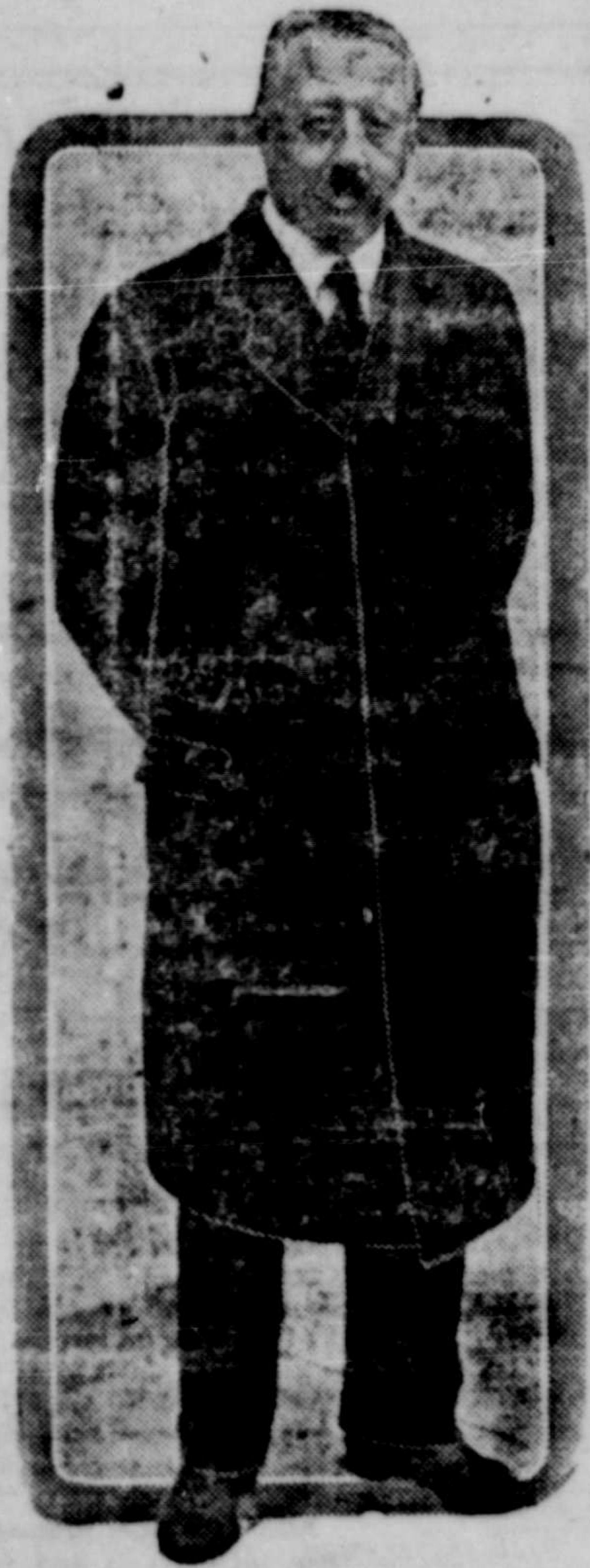
His Excellency the Governor.