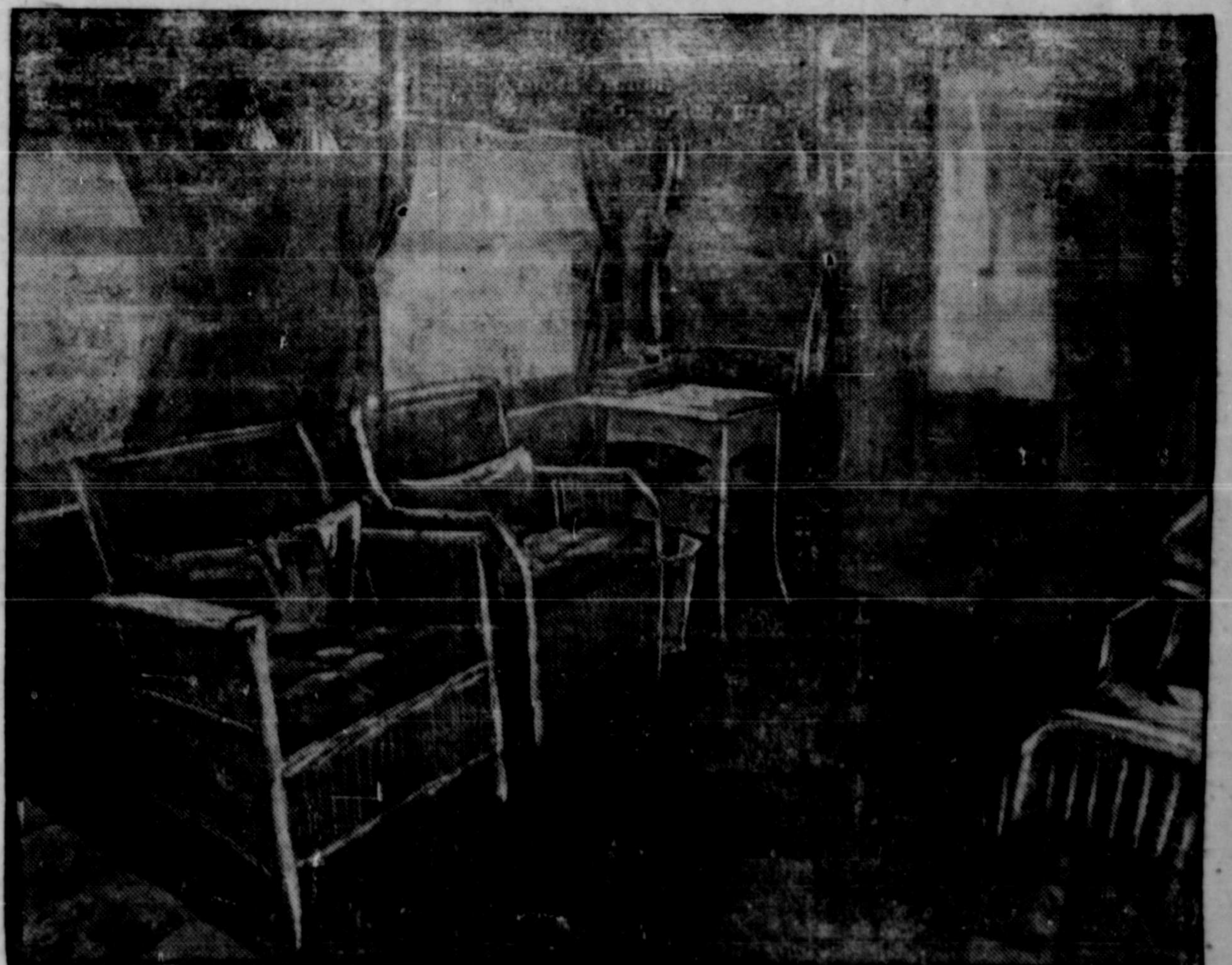
The Parlor Car in which the Prince of Wales travelled, provided by the C.P.R.