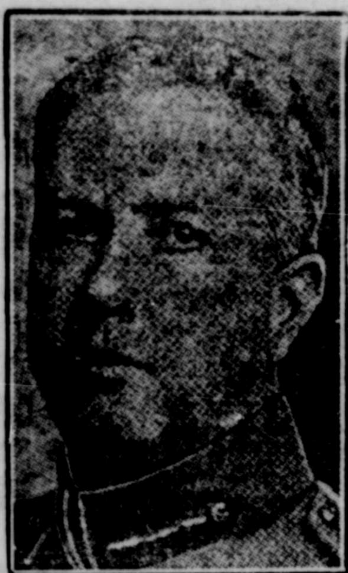
GENERAL SIR ARTHUR CURRIE Who was given a great reception at his home town.

Satin and kid pumps just in.—Family Shoe Store.