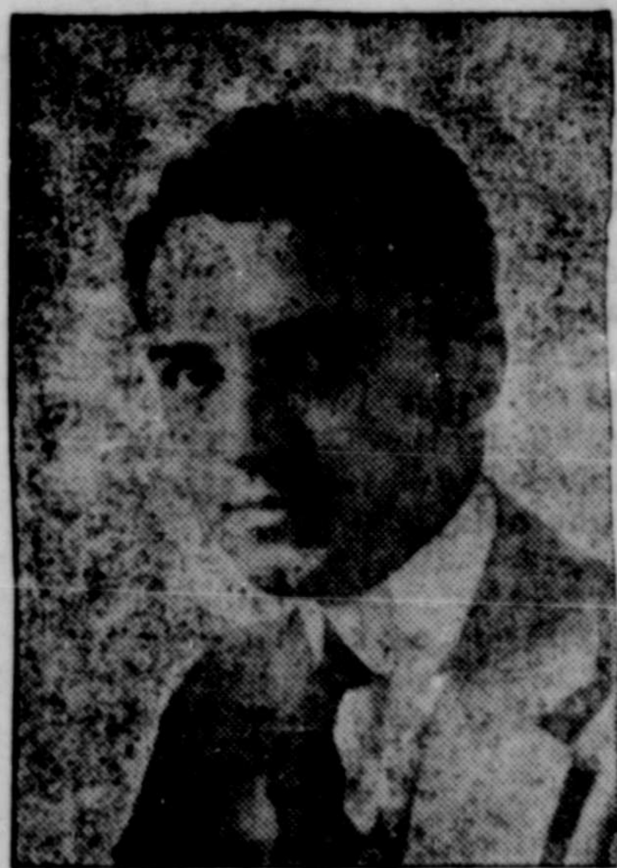
BRYANT WASHBURN—Essanay At the Empress Theatre tonight.

NOTICE OF CANCELLATION. NOTICE is hereby given that the reserve existing over Lots 1819 and 1820, Queen Charlotte District, by reason of a notice published in the B. C. Gazette of 27th December, 1907, is cancelled. G. R. NADEN, Deputy Minister of Lands, Department of Lands, 22nd September, 1919.