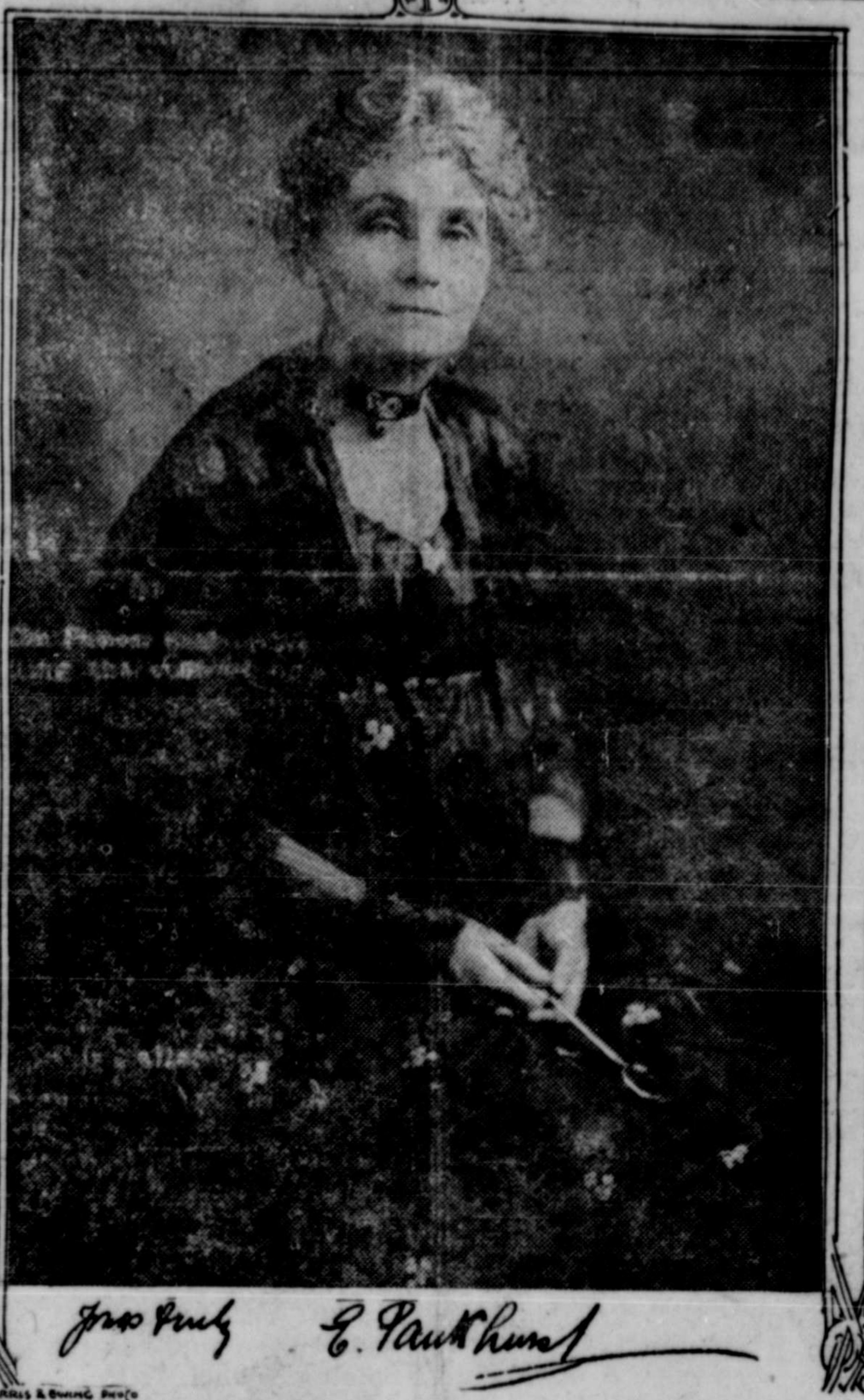
The famous militant, Mrs. Emmeline Pankhurst, English suffragist, lecturer and author, has arrived in the United States to launch a campaign against Bolshevism. She is going to arouse the women of America, both the United States and Canada, in this crusade.