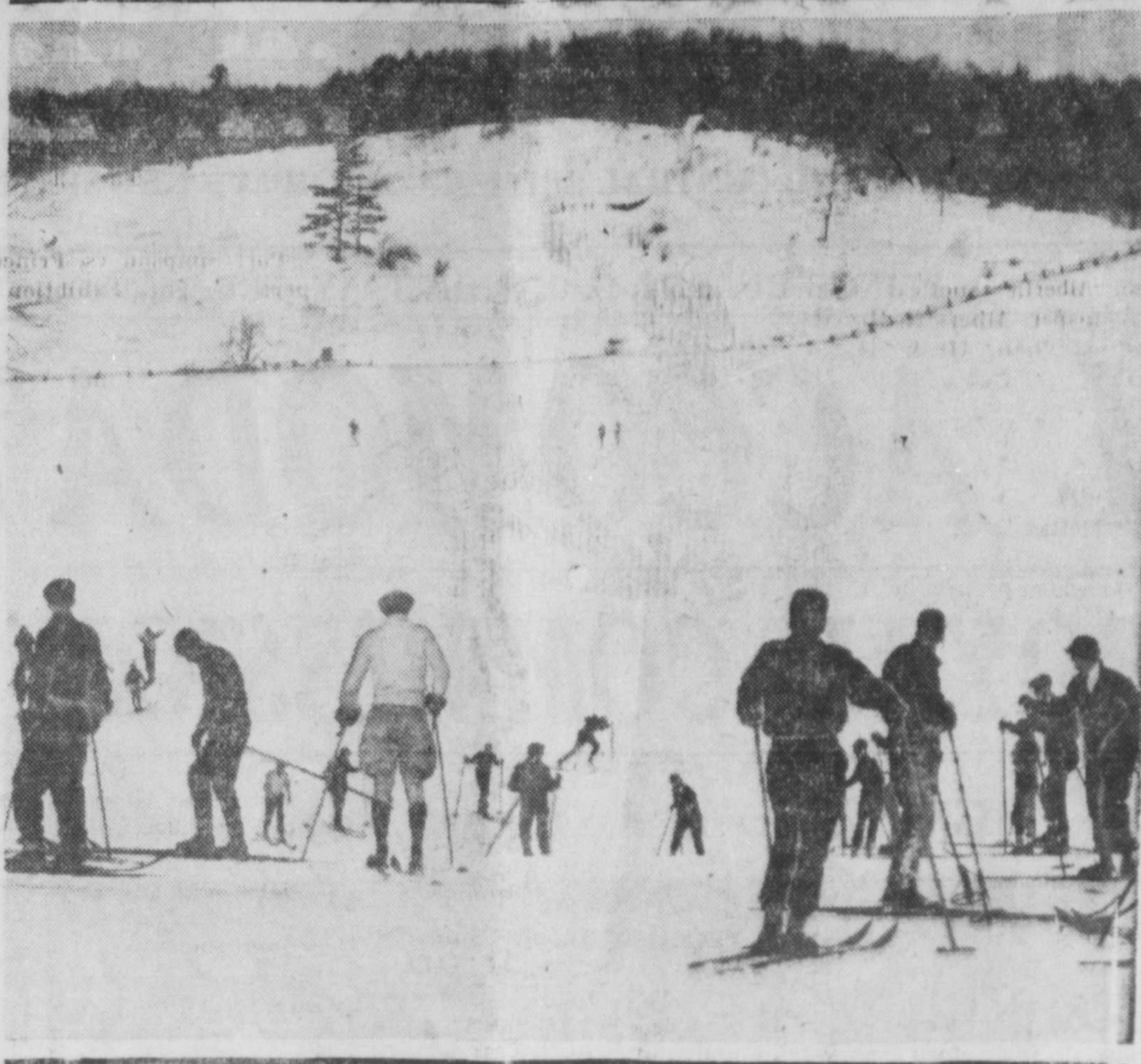
The photograph here shows an attractive view at the Summit Golf course, Toronto, during the down-hill race, held recently, by the Toronto Ski Club.

Liberalism moves for peace as Liberalism has always moved for those things that add to the betterment and richness of life.