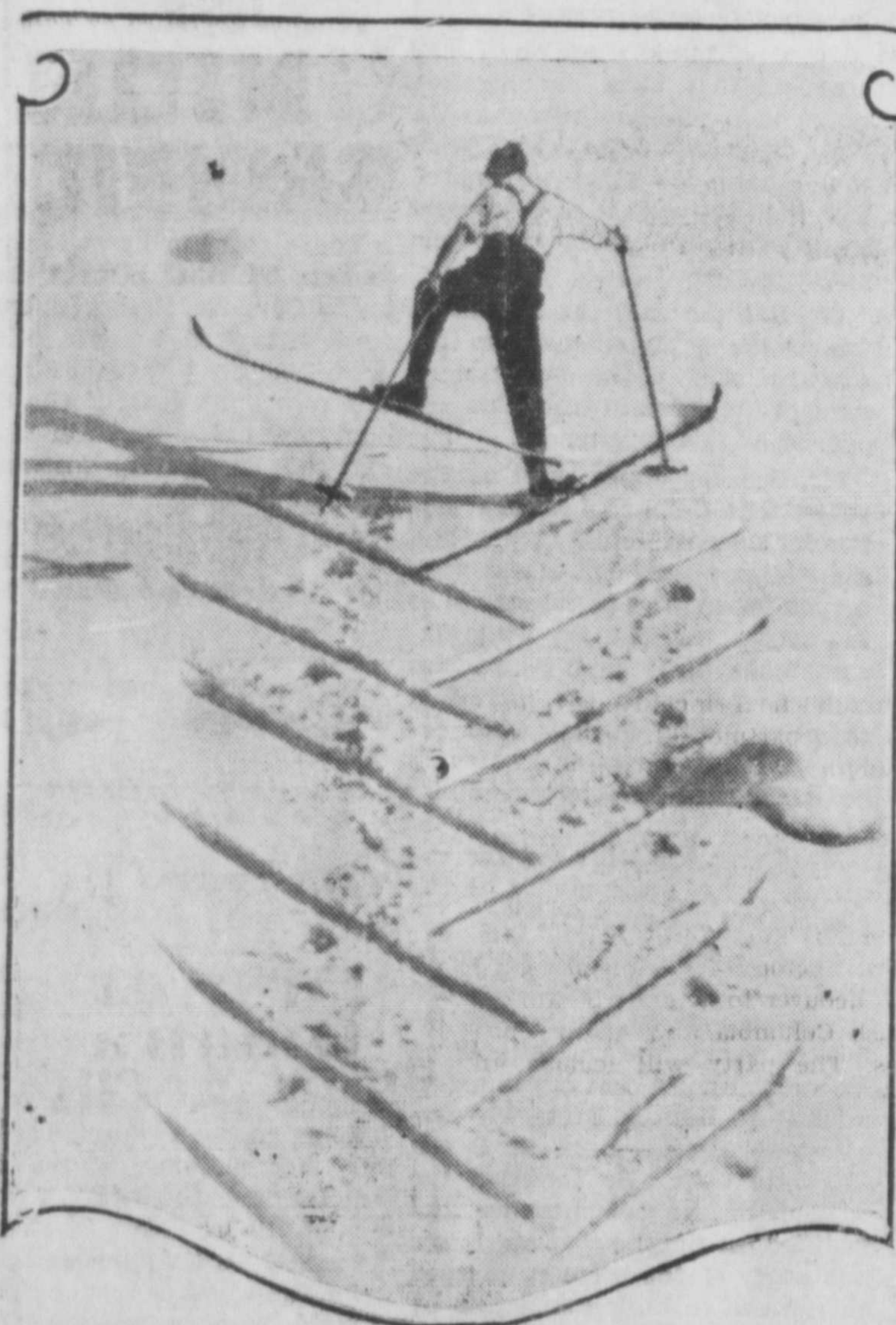
This winter sports enthusiasts at Adelboden, in the Swiss Oberland, can't resist giving expression to a mathematical complex. He is laying out an elaborate design by ski and pole.

The advertisements contain pocketbook news—and that's important!