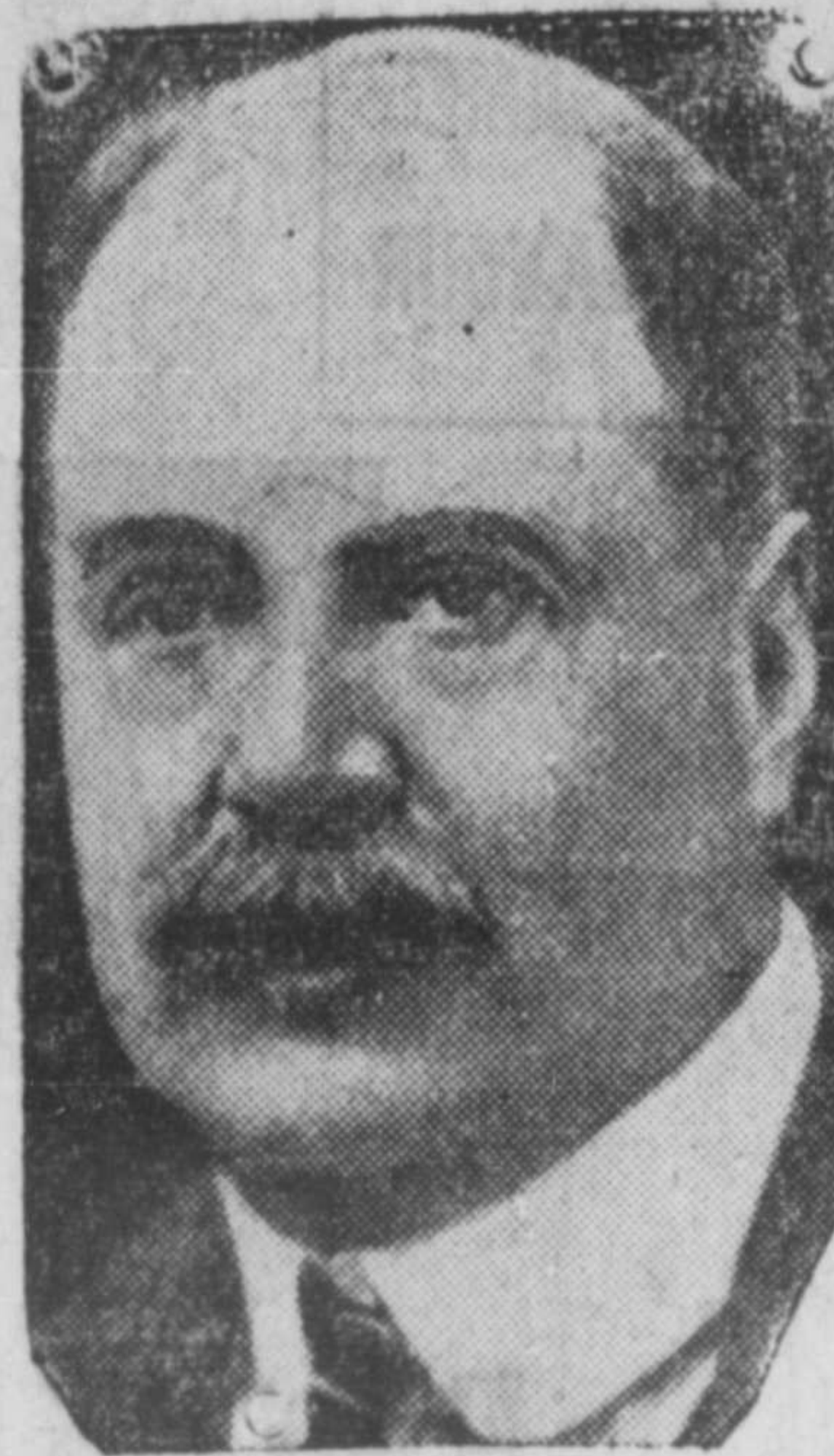
THE EARL OF DERBY

Who tells New Yorkers it should be said "Darby" and not "Derby."