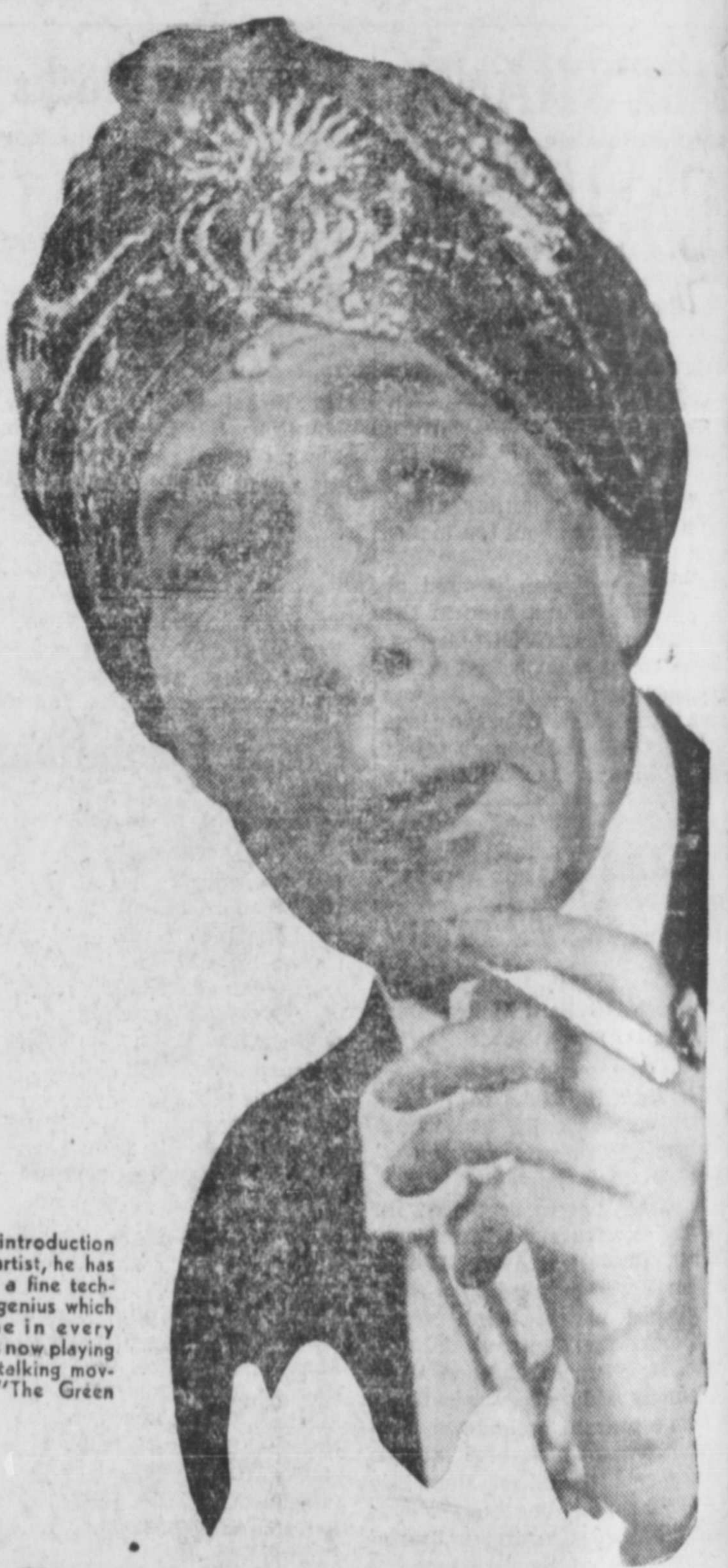
George Arliss needs no introduction to Canadians. A sterling artist, he has brought to his many roles a fine technique and interpretative genius which have made him welcome in every Canadian city. Mr. Arliss is now playing across Canada in the all-talking moving picture production "The Green Goddess".

Dim lights... human passions at play... a figure dominating the stage... a voice musical, insistent... holding audiences breathless... invoking strange gods... calling on ancient powers... conveying across the footlights the inscrutable mystery of the East. Here is the thrill of perfect acting. Equally unique is the Buckingham thrill... a deep, lasting and pleasurable thrill awaiting every Buckingham smoker. Buckingham Cigarettes are the coolest, mellowest cigarette obtainable... blended exclusively from choicest tobaccos... possessing an original fascinating flavor... kept always fresh and fragrant by the sealed patented package. No other cigarette gives you the Buckingham thrill. Buckinghams are quality through and through... a cigarette selling on excellence alone... no coupons or premiums with Buckingham but ALL QUALITY