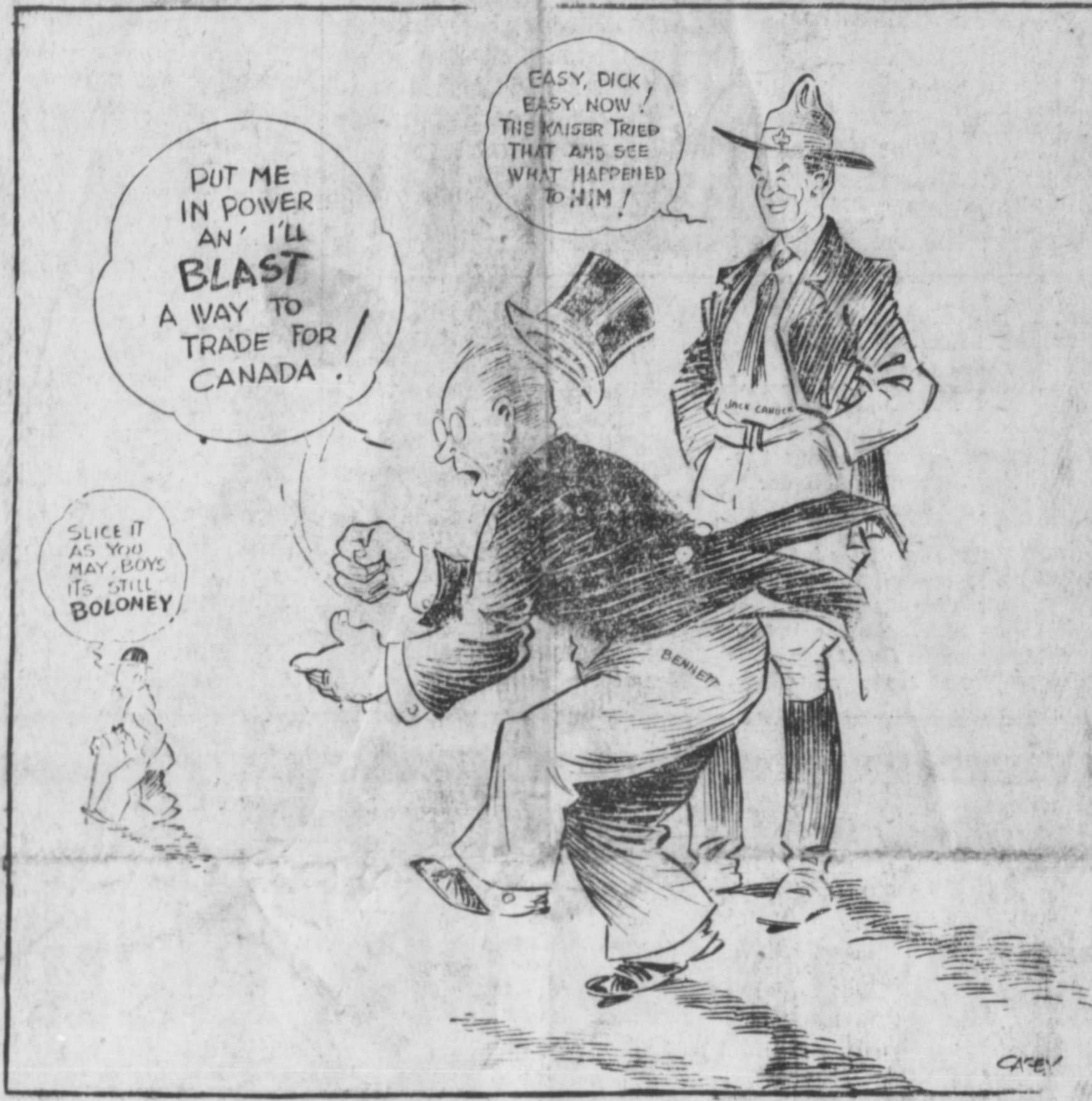
Casey in the Montreal