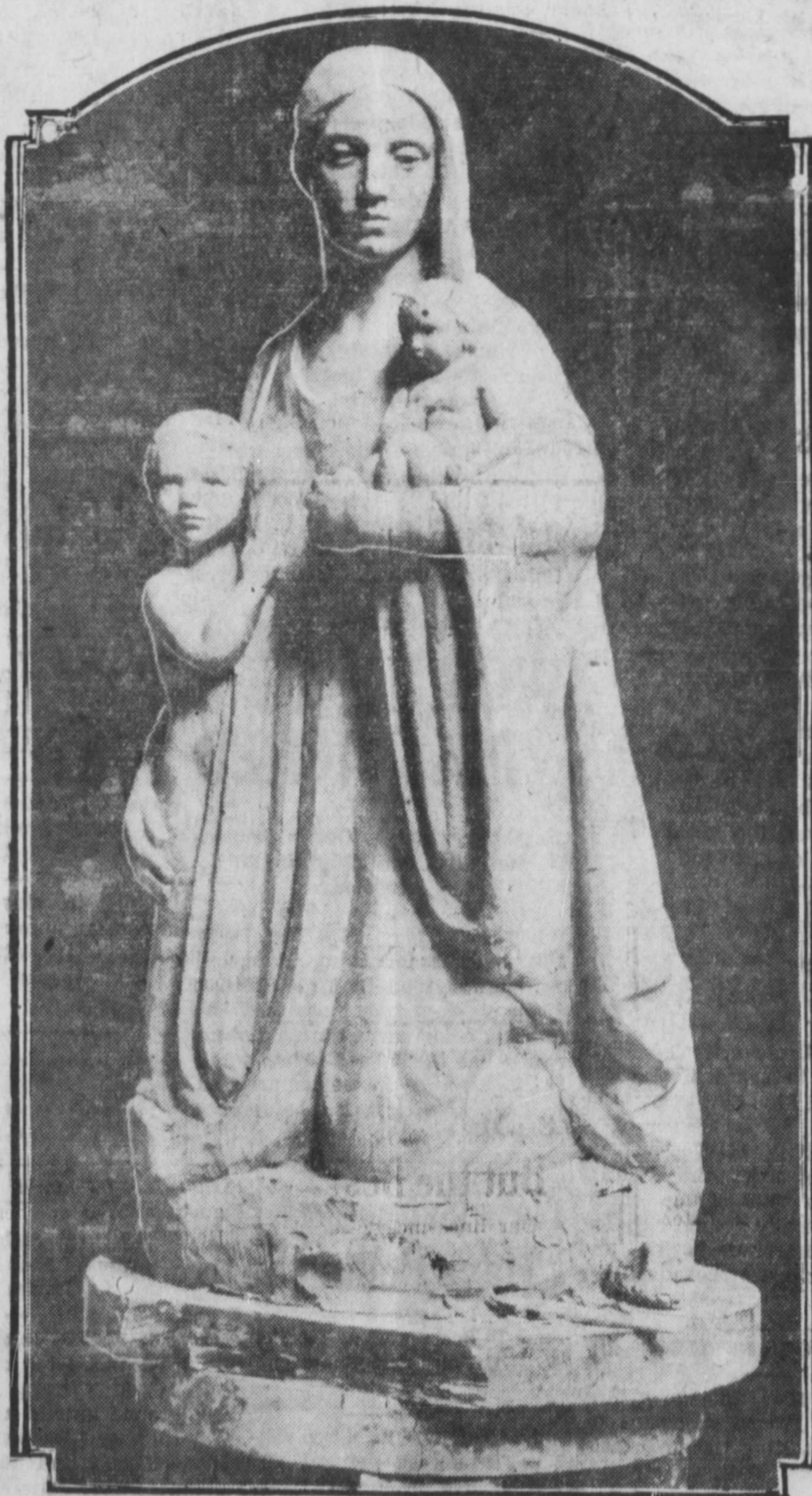
This fine piece of sculpture, executed by Frances Loring, Toronto, will form part of decoration for Memorial Chambers, Parliament buildings, Ottawa.